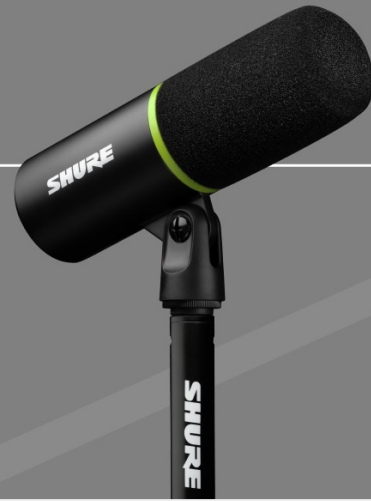
Figure 2: Visual guide for quick setup of the Shure MV6.

We've taken everything we know about dynamic vocal microphones and packed it into the MV6 to produce a USB microphone that is easy for anyone to use, right out of the box. With design & technology borrowed from our iconic SM7 and MV7 range of microphones, the MV6 has been designed to enable gamers and streamers to take their first step into Shure dynamic vocal microphones and sound like a pro.