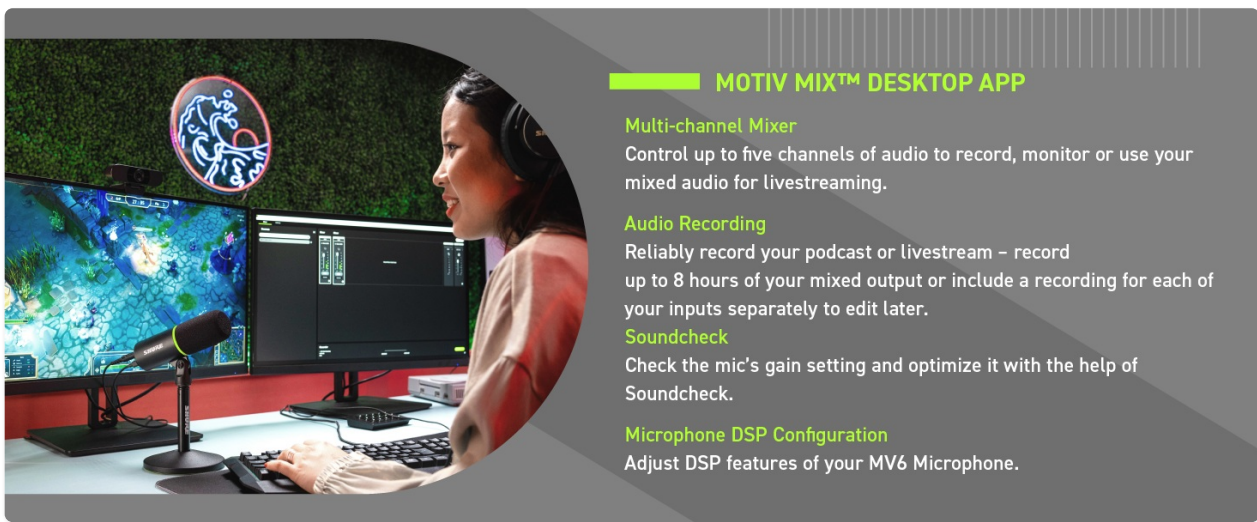
Figure 5: Key audio processing features of the Shure MV6.