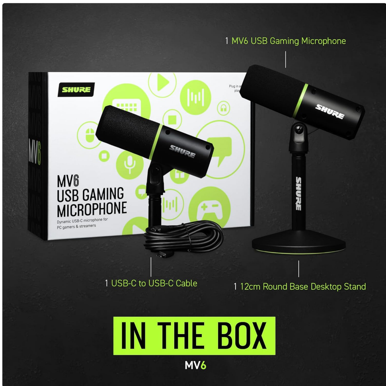
Figure 1: Contents of the Shure MV6 Gaming Microphone package.