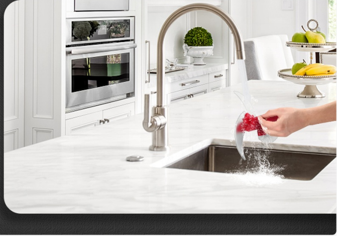
Figure 5: Easy Cleaning and Storage