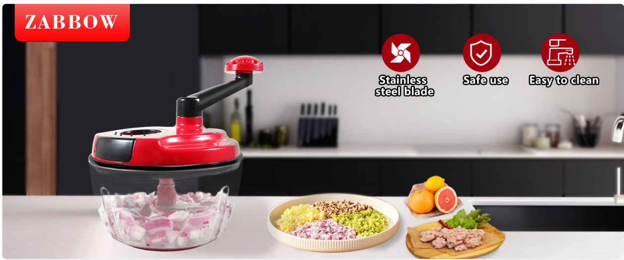
Figure 2: Assembled Food Processor in Use