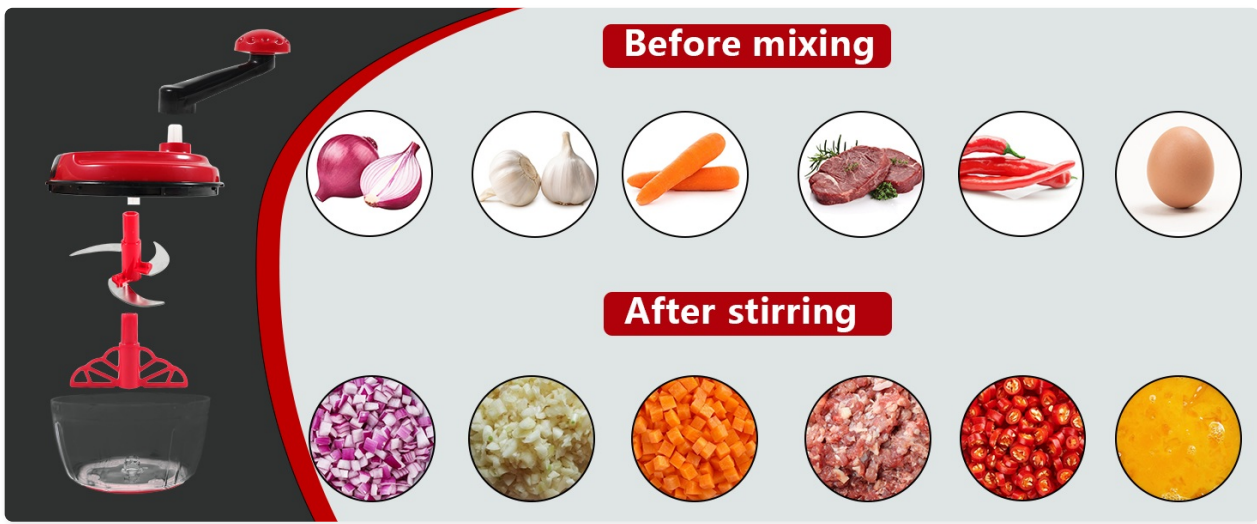
Figure 4: Before and After Mixing Examples