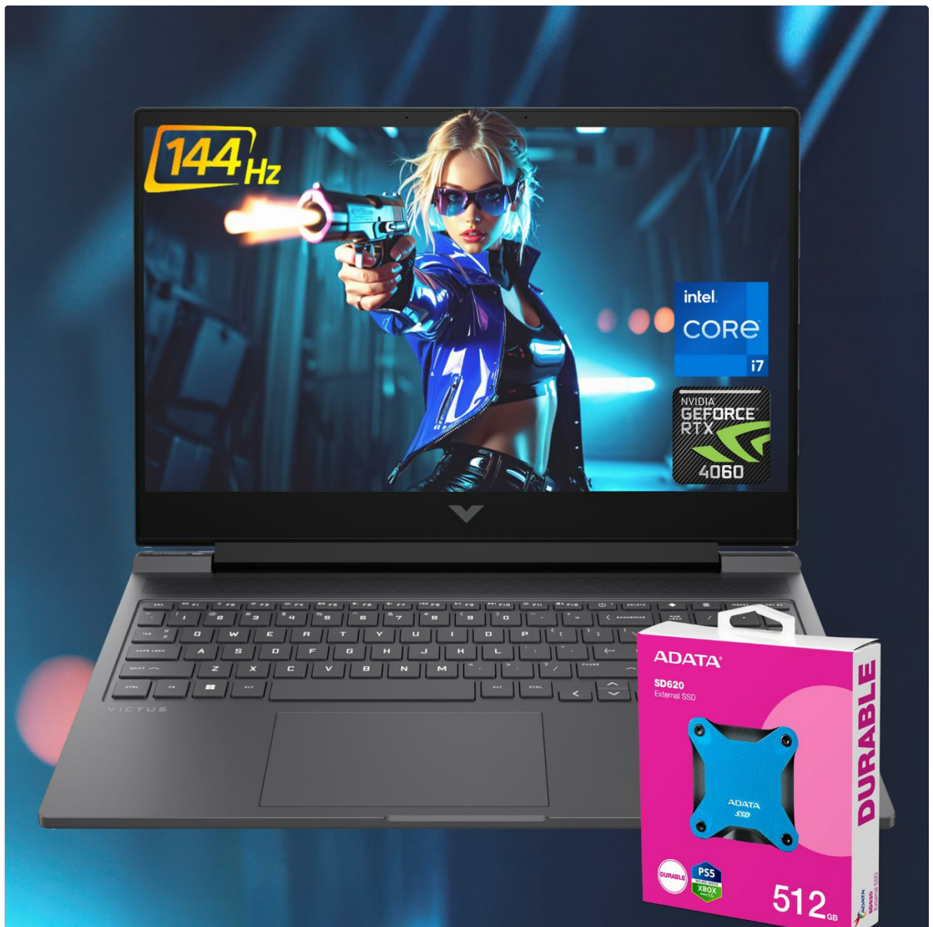
Image: The HP Victus 16.1-inch Gaming Laptop, showcasing its sleek design and vibrant screen.