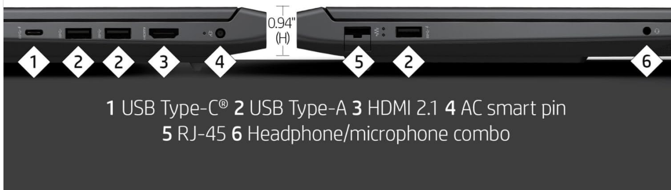
Image: A visual representation of the HP Victus 16.1-inch Gaming Laptop and its included accessories, highlighting its dimensions and port layout.