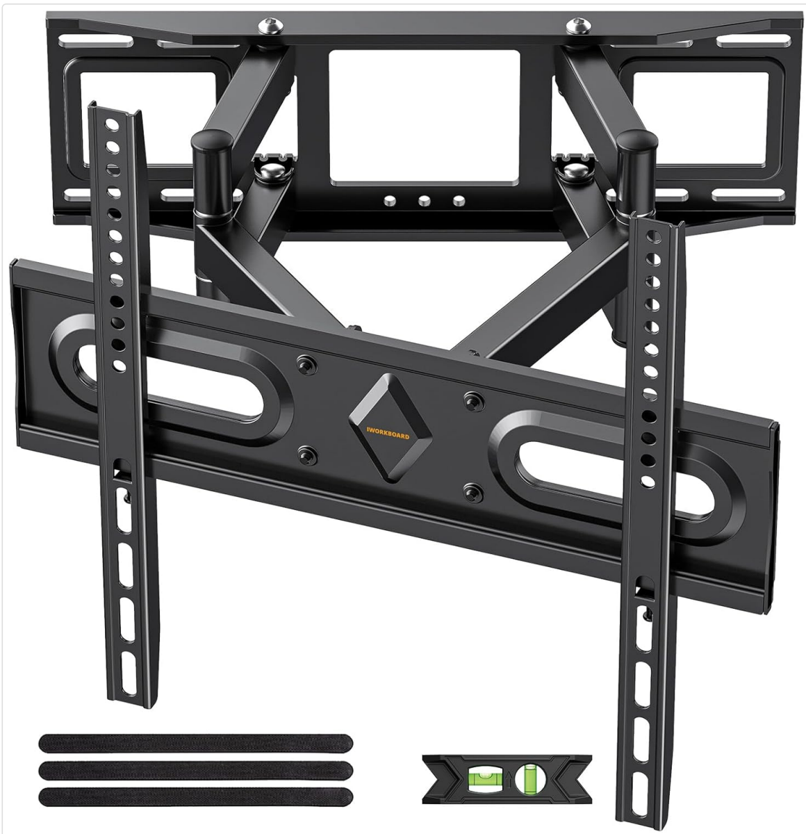
Image: All components of the IWORKBOARD Full Motion TV Wall Mount, including the main wall plate, dual articulating arms, TV mounting brackets, and a small bubble level for installation.