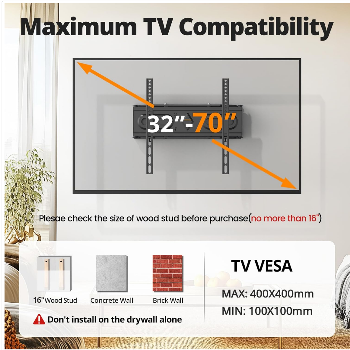
Image: Visual guide for TV size (32-70 inches), VESA compatibility (Max 400x400mm, Min 100x100mm), and supported wall types (16" wood stud, concrete, brick). Includes a warning against drywall-only installation.