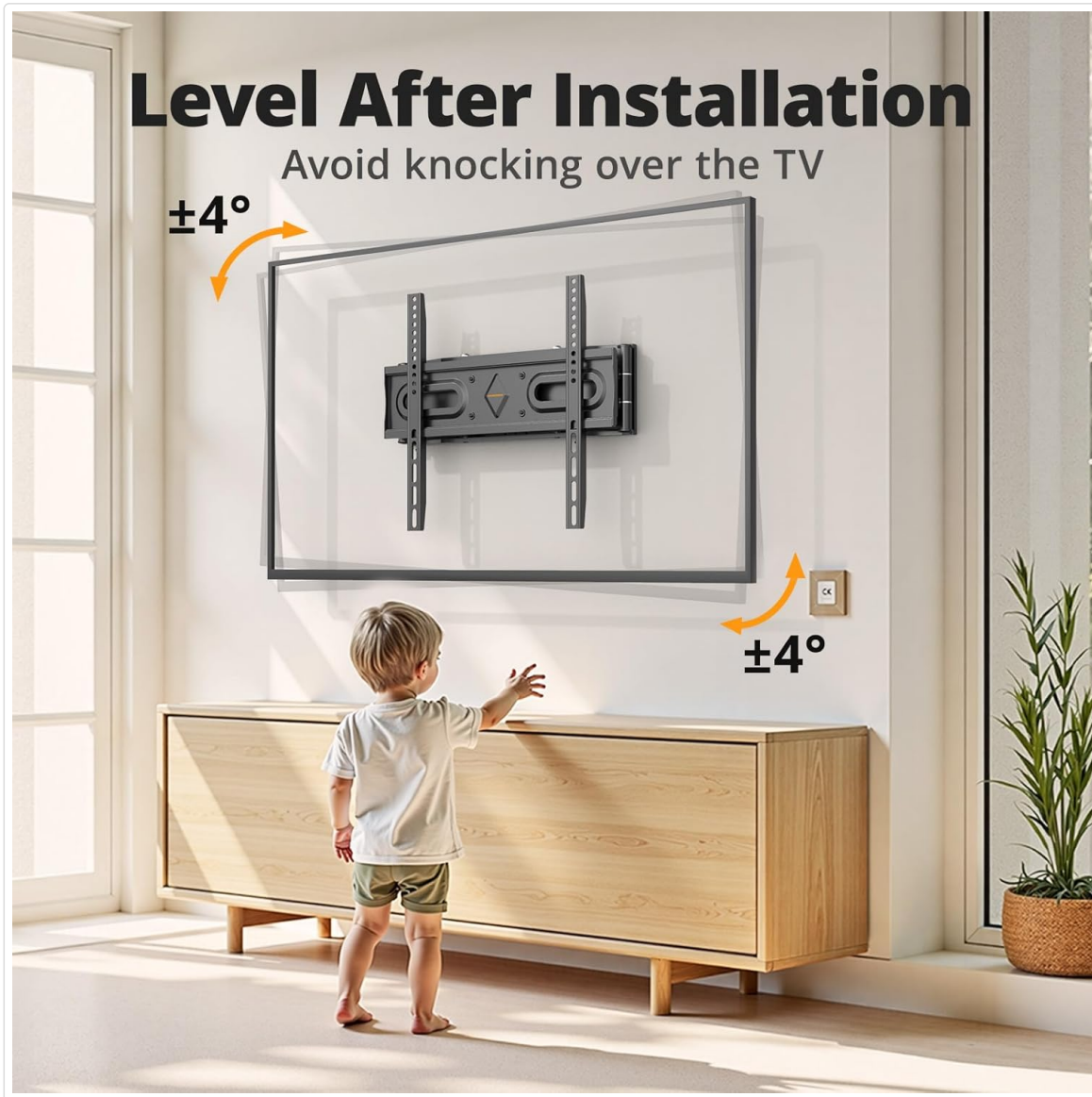
Image: Demonstrates the +/-4 degree level adjustment feature, allowing for fine-tuning of the TV's horizontal position after installation.