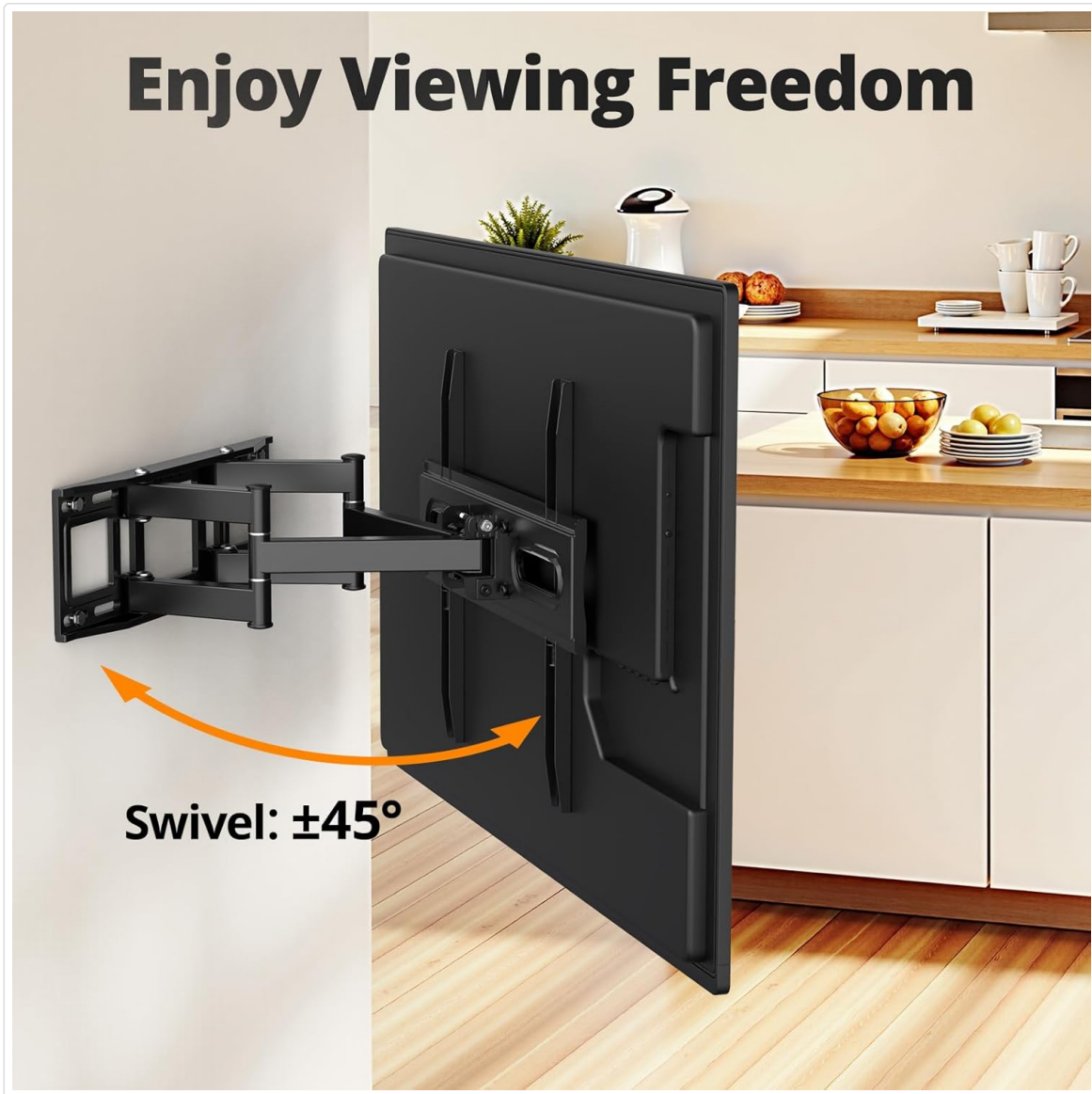
Image: Illustration of the TV mount's swivel capability, allowing rotation up to +/-45 degrees for flexible viewing.