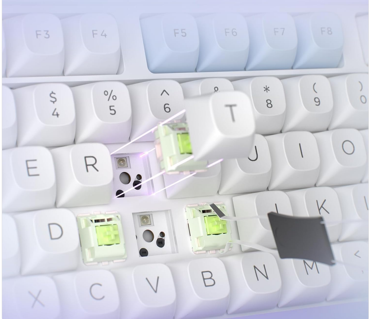
Image: Advanced hot-swap sockets on the Redragon K673 MAX keyboard, featuring custom Mint Mambo switches for plush and solid typing feedback.