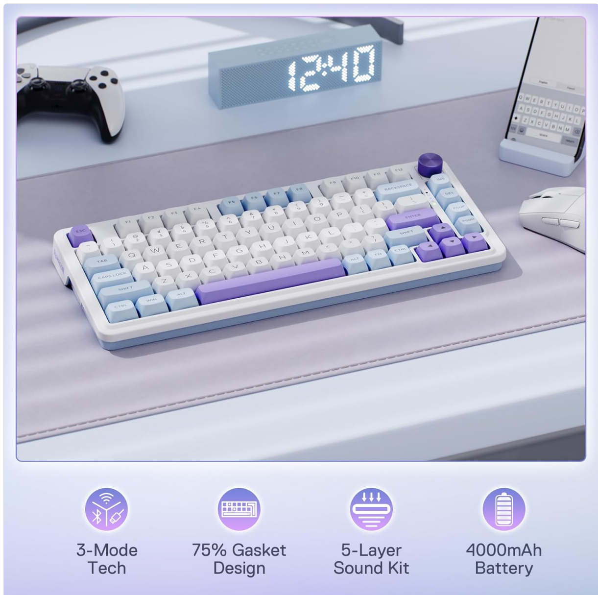
Image: Redragon K673 MAX keyboard with included accessories, highlighting its 3-mode tech, 75% gasket design, 5-layer sound kit, and 4000mAh battery.