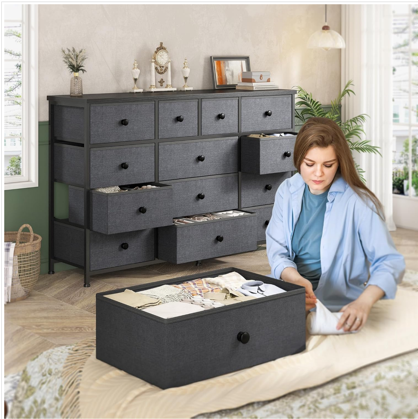
Image 5.2: A person demonstrating the organization of items within the fabric drawers.