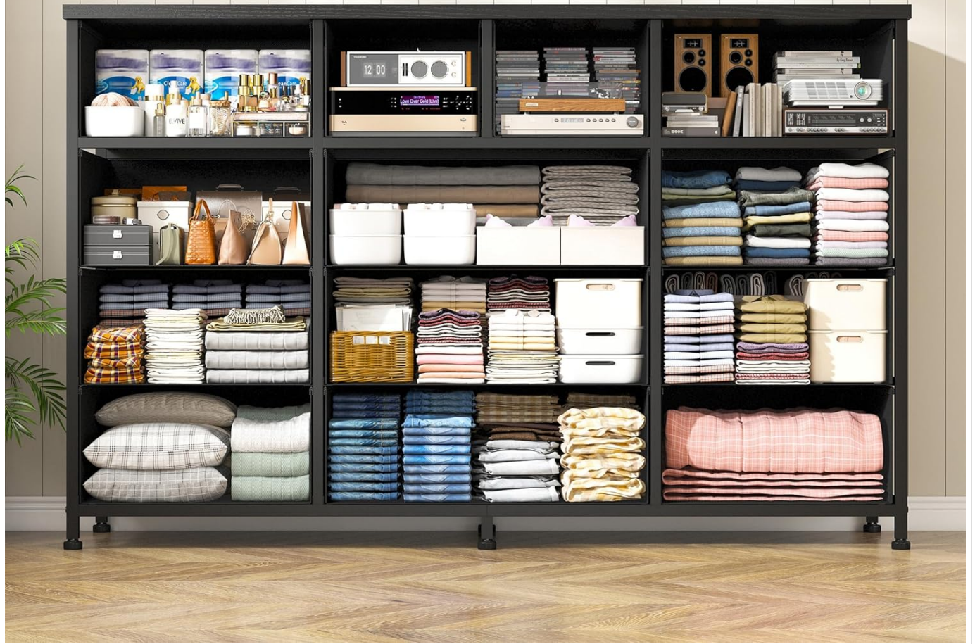
Image 5.1: Examples of items that can be stored in the drawers, including clothes, food, toys, books, quilts, and cosmetics.