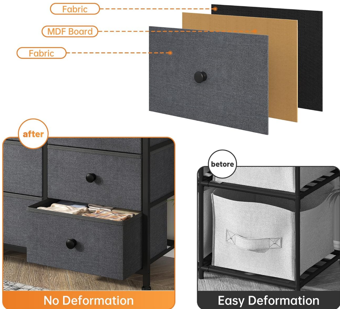
Image 6.1: The 3-layer design of the fabric drawers, indicating enhanced durability.