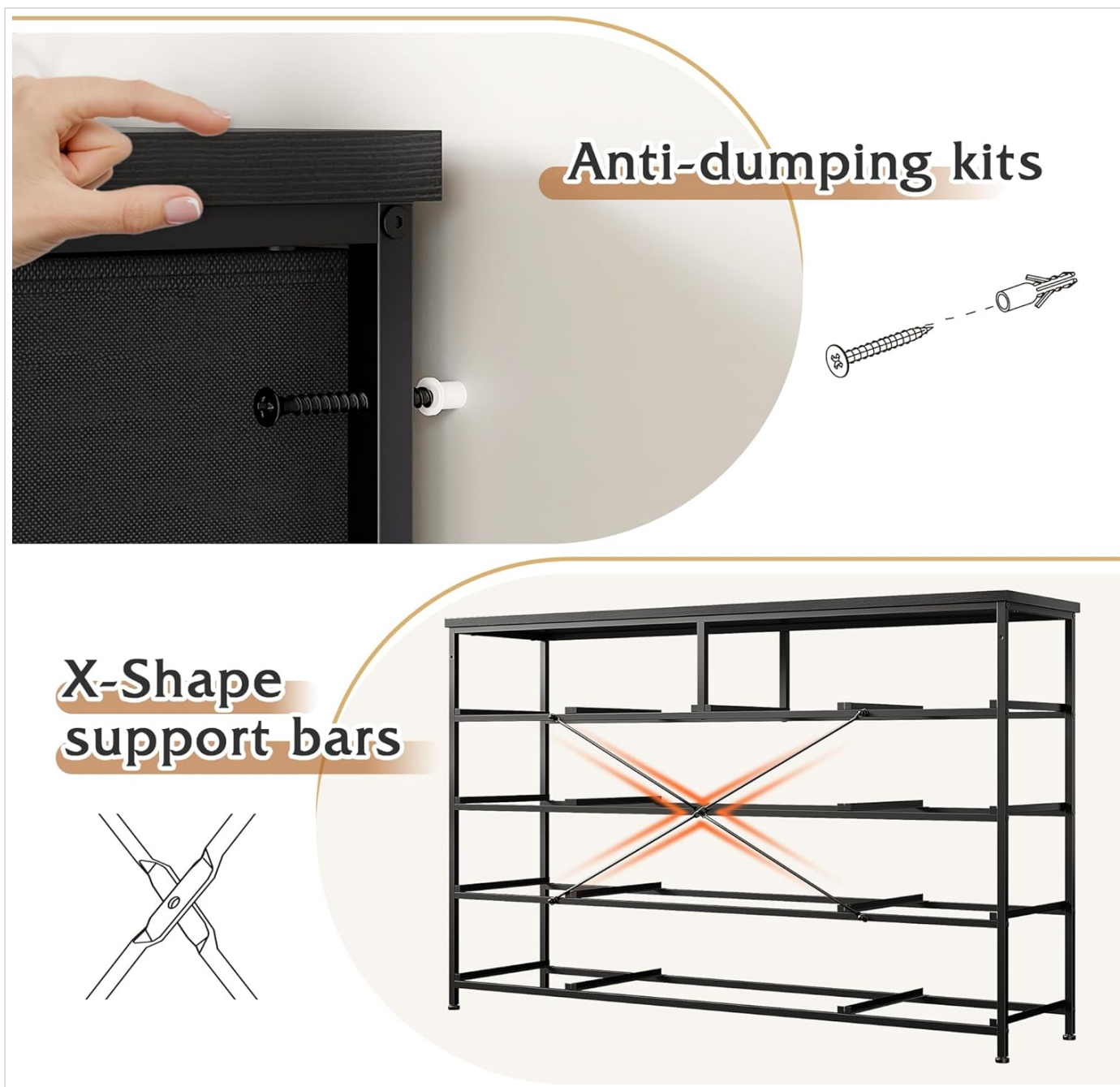
Image 2.1: Anti-tipping kit and structural support for enhanced stability.