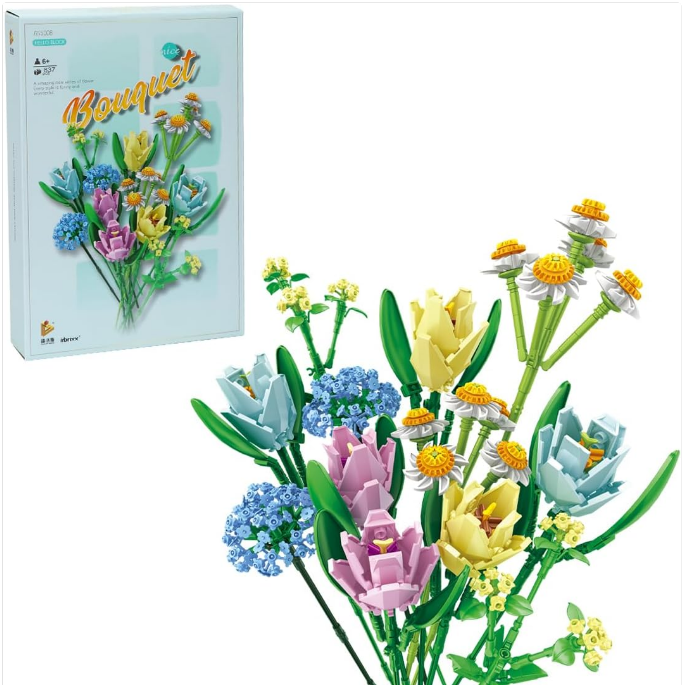
Image: The PANLOS Flower Bouquet Building Set box alongside a fully assembled flower bouquet, showcasing the variety of flowers included.