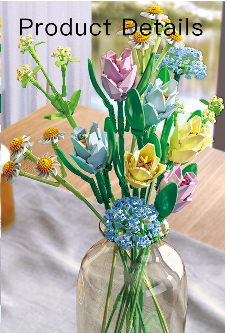
Image: Detailed views of the four distinct flower types: Tulip, Hydrangea, Camomile, and Bupleurum Rotundifolium, highlighting their unique designs.