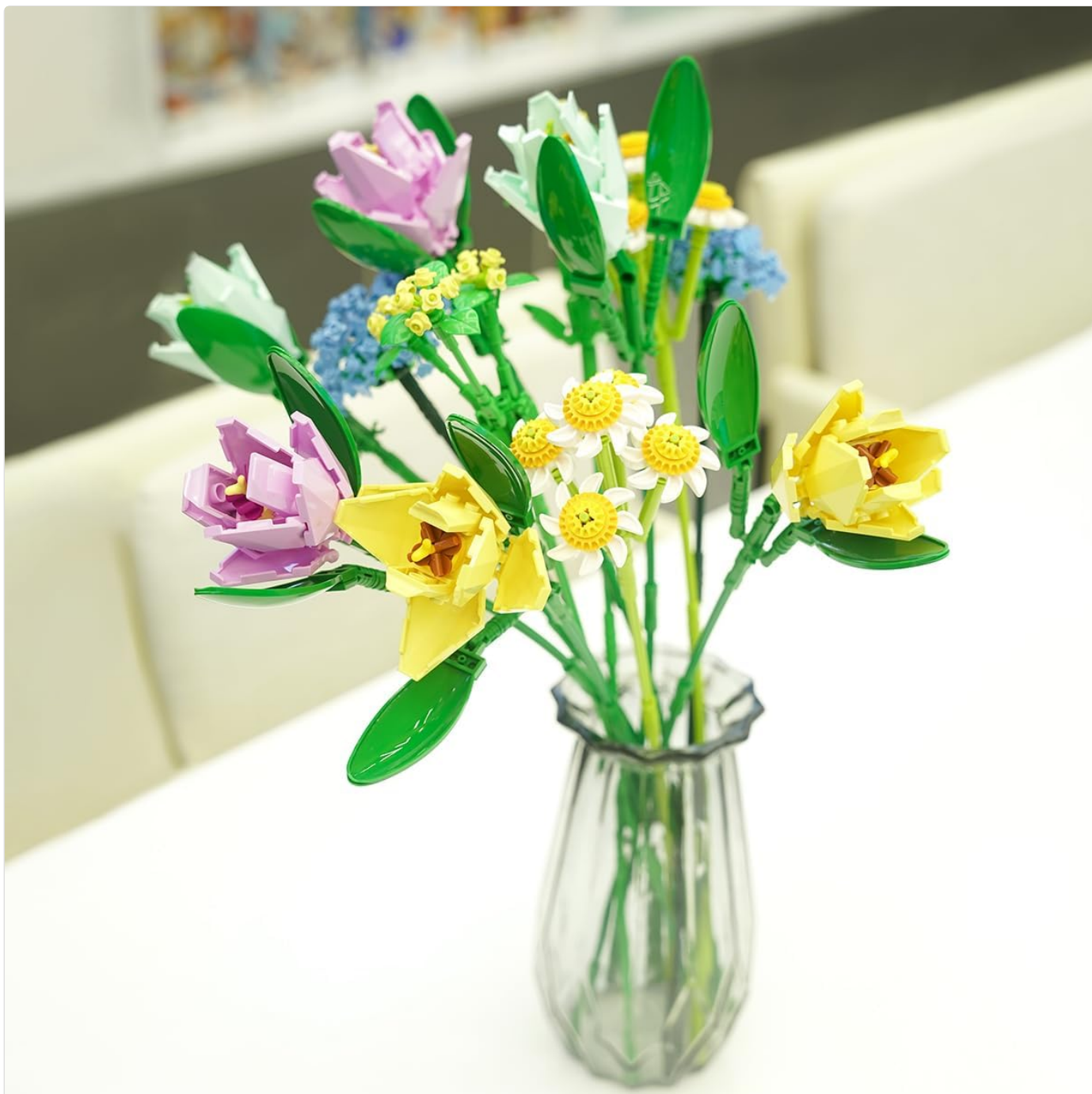
Image: The completed flower bouquet elegantly displayed in a clear glass vase, suitable for home or office decor.