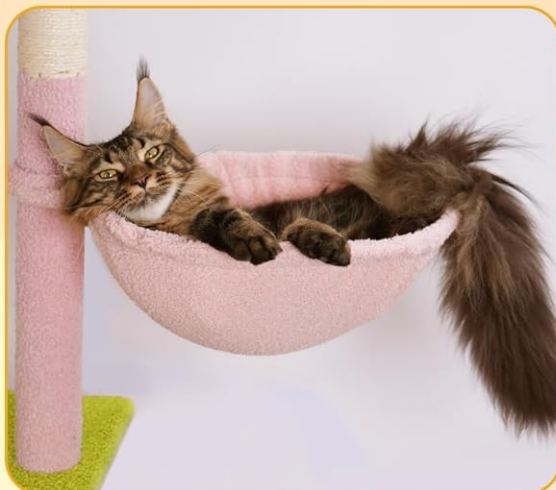
Image: Close-up of cats resting in the hammocks and condo.