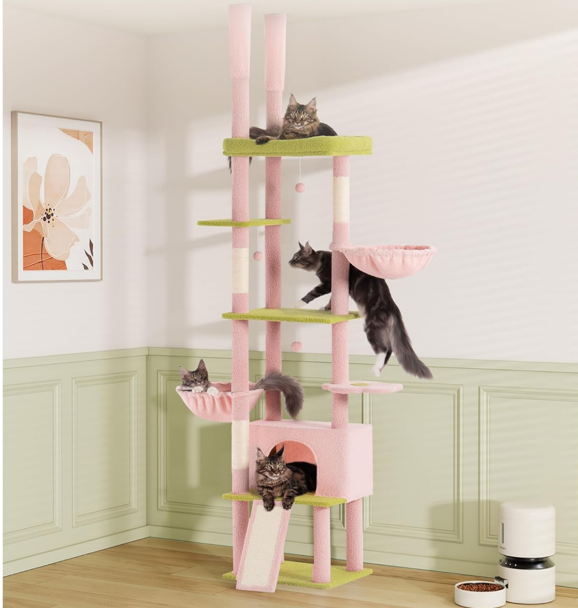
Image: An assembled Aechonow Flower Cat Tree with cats on different levels.