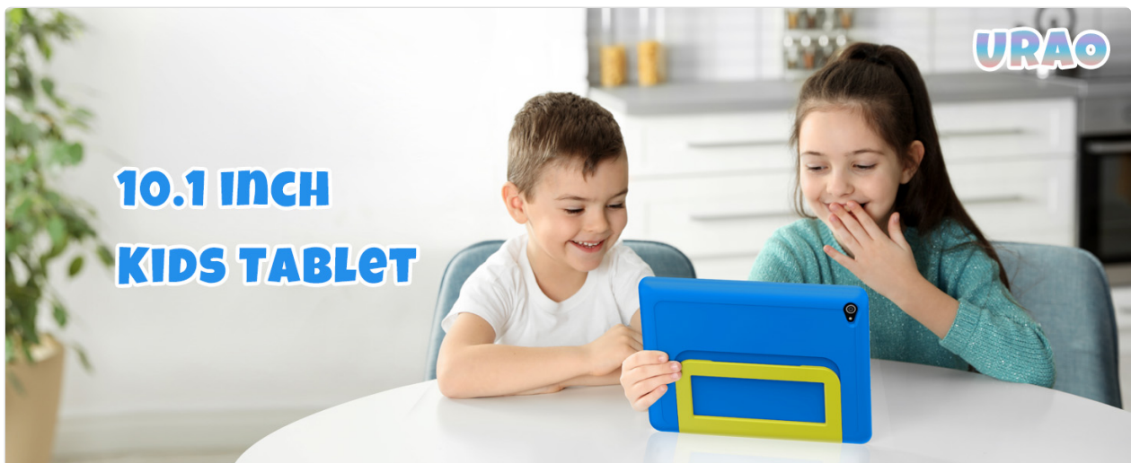
Image 1.1: URAO Kids Tablet KT1016. This image shows the tablet in its protective case, displaying the Android 14 operating system and memory specifications.