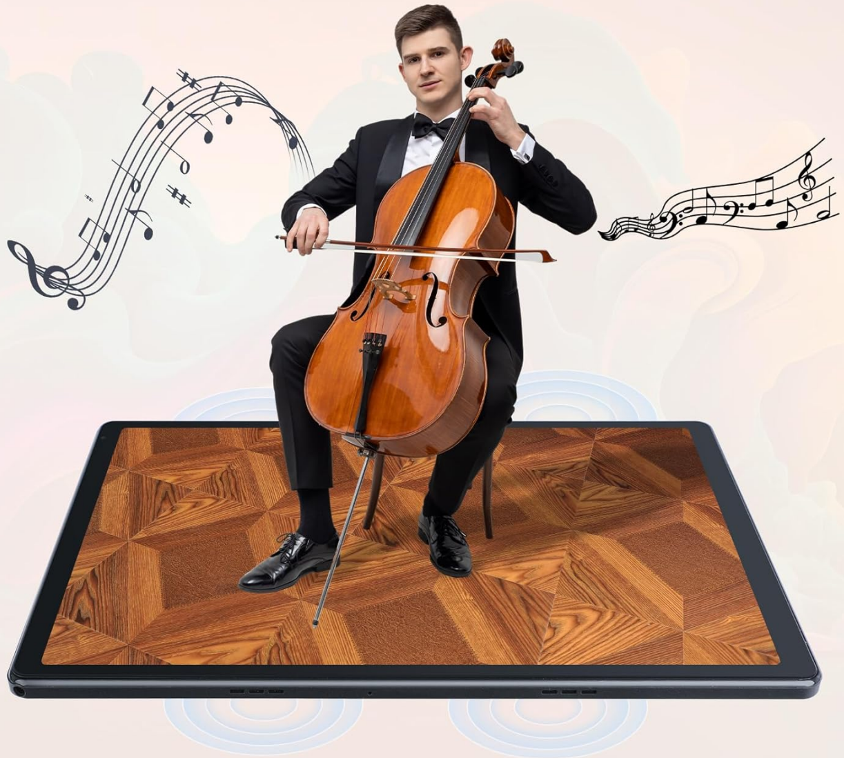
Image: Visual representation of the 10.1-inch wide-viewing angle IPS display with 1280x800 resolution, multi-touch capability, 16:10 golden ratio, and Face Recognition feature.