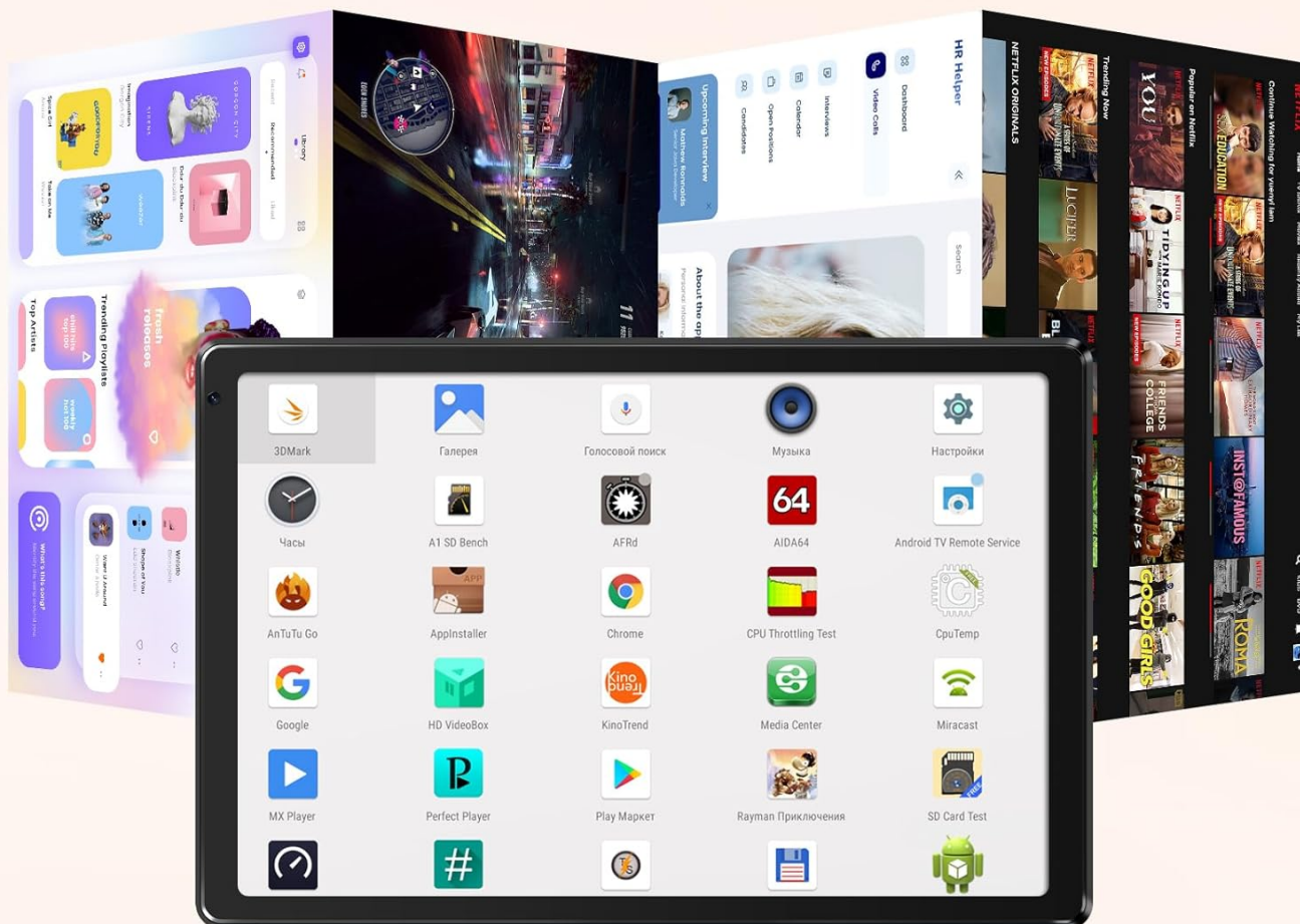
Image: An illustration showcasing the URAO tablet's storage capabilities, including 24GB RAM, 128GB ROM, and support for up to 1TB external storage via TF card.