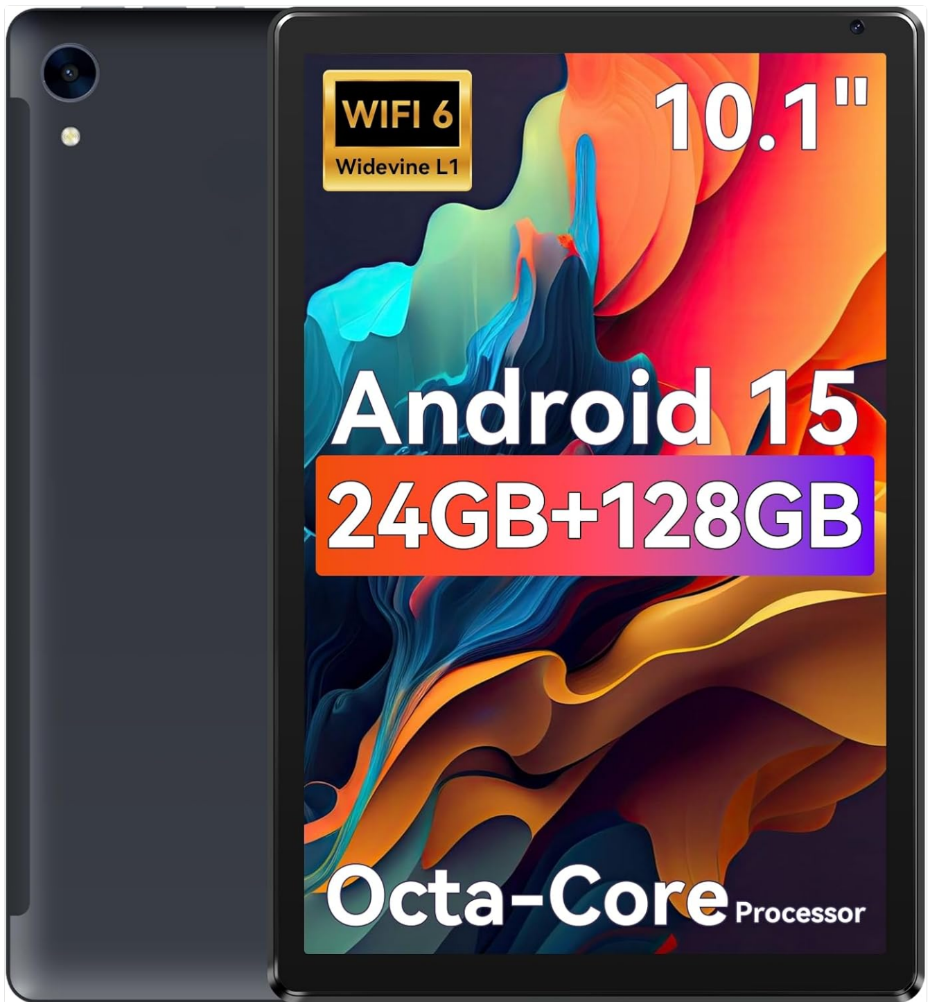
Image: The URAO 10.1 inch Android Tablet along with its charging adapter and USB cable.