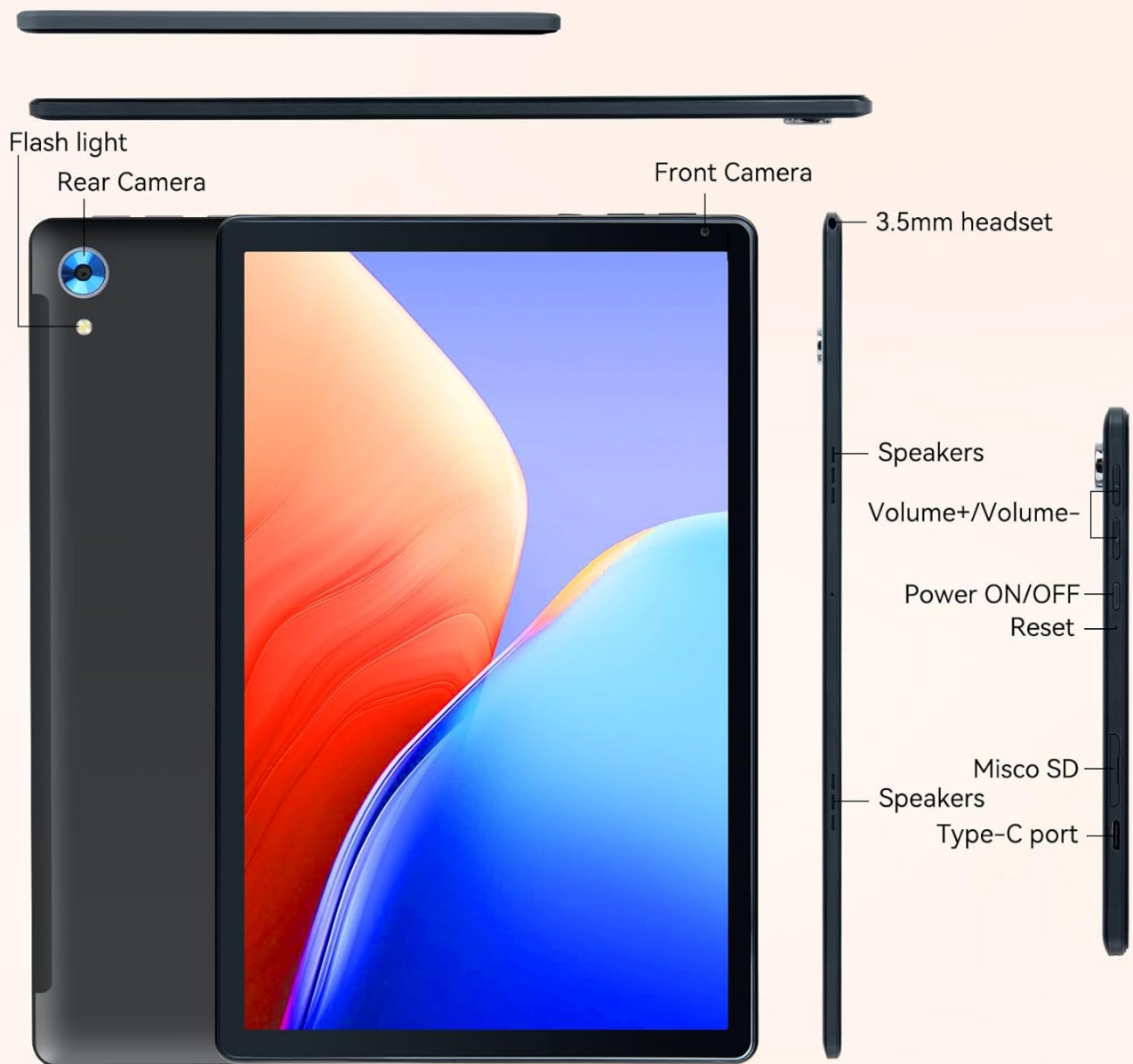
Image: Illustration highlighting the stereo dual speakers of the URAO tablet, emphasizing its audio capabilities.