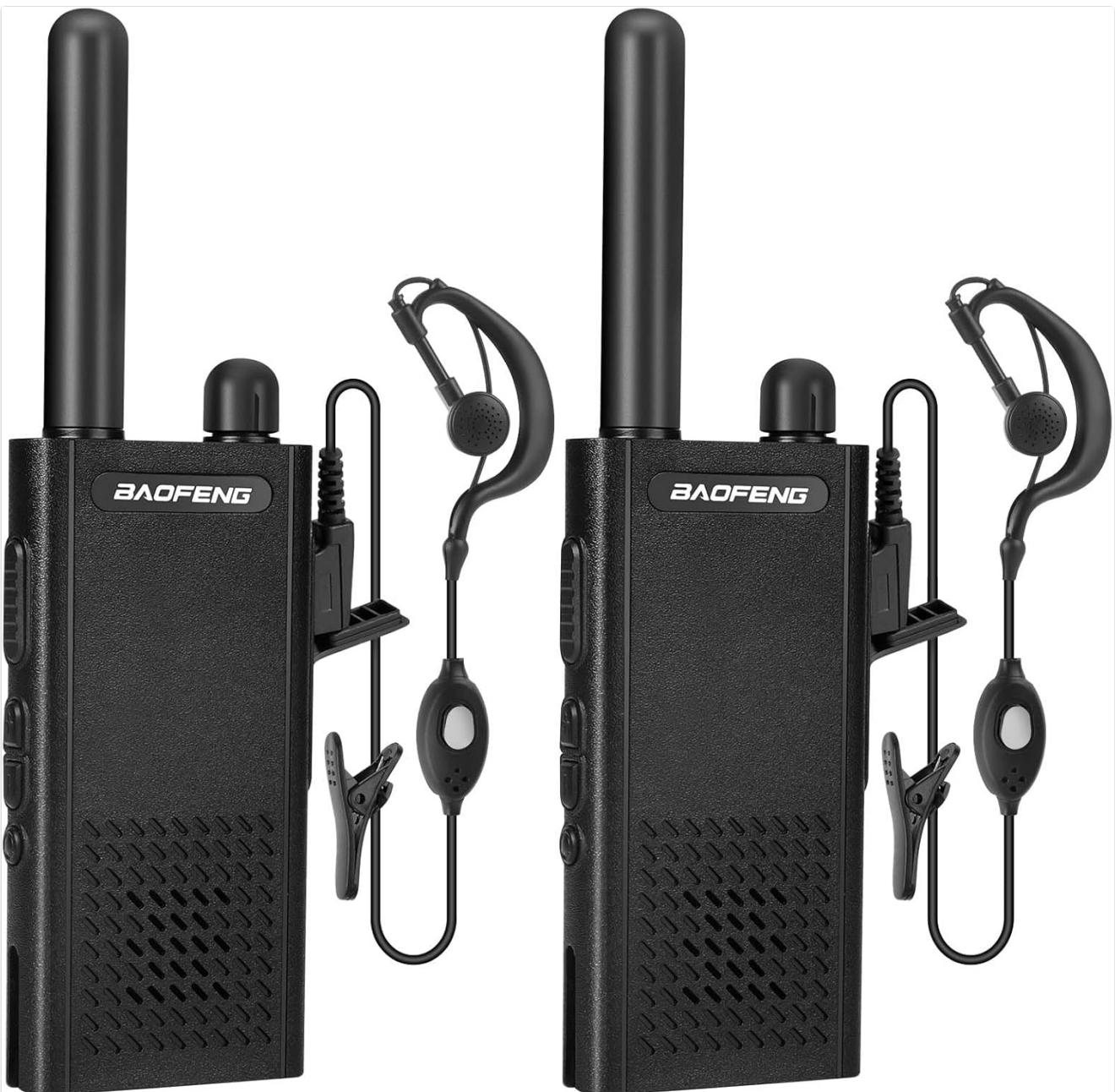
Image 1.1: Two BAOFENG T26 FRS Two-Way Radios with included earpieces.