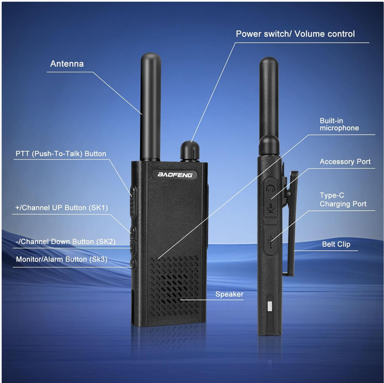
Image 4.1: Labeled diagram of the BAOFENG T26 radio's external components.

Familiarize yourself with the various parts of your BAOFENG T26 radio: