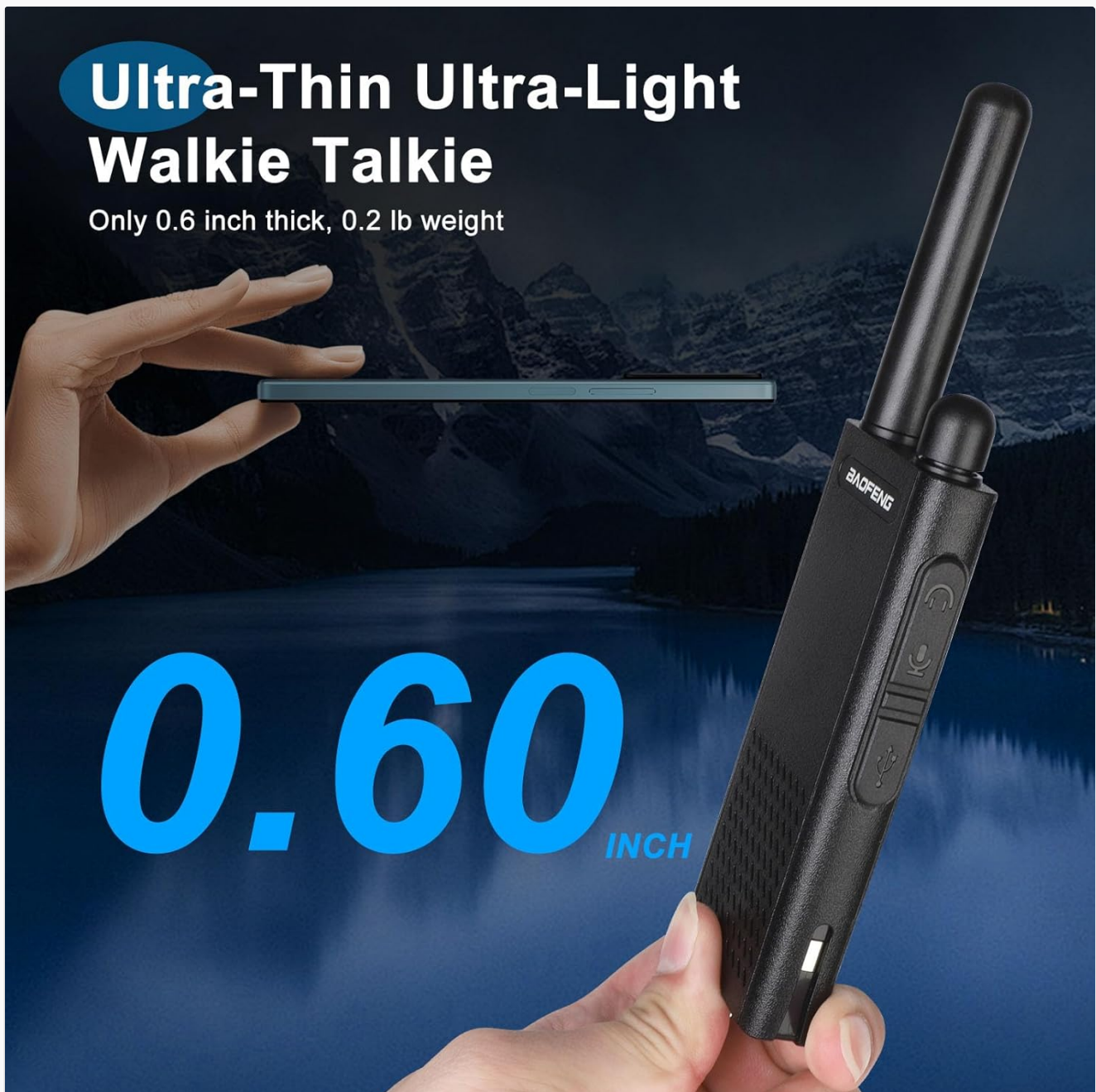
Image 2.1: The BAOFENG T26 radio's slim profile, highlighting its portability.