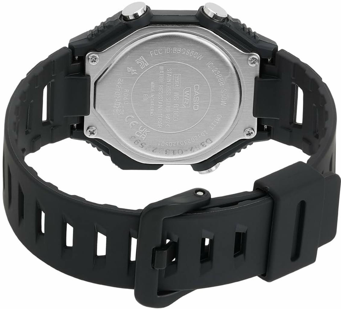
Figure 2.4: Rear view of the Casio WS-B1000-1AVDF watch, showing the stainless steel case back with water resistance and model information.