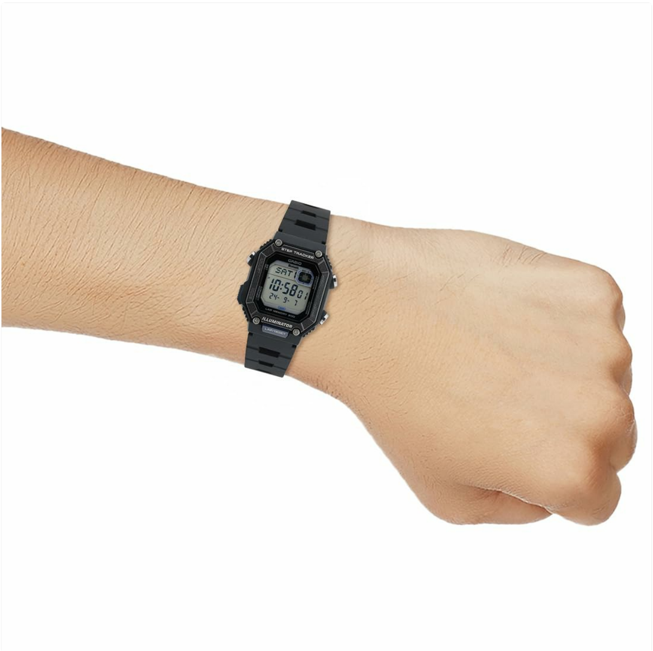
Figure 2.5: The Casio WS-B1000-1AVDF watch displayed on a wrist, illustrating its size and fit.