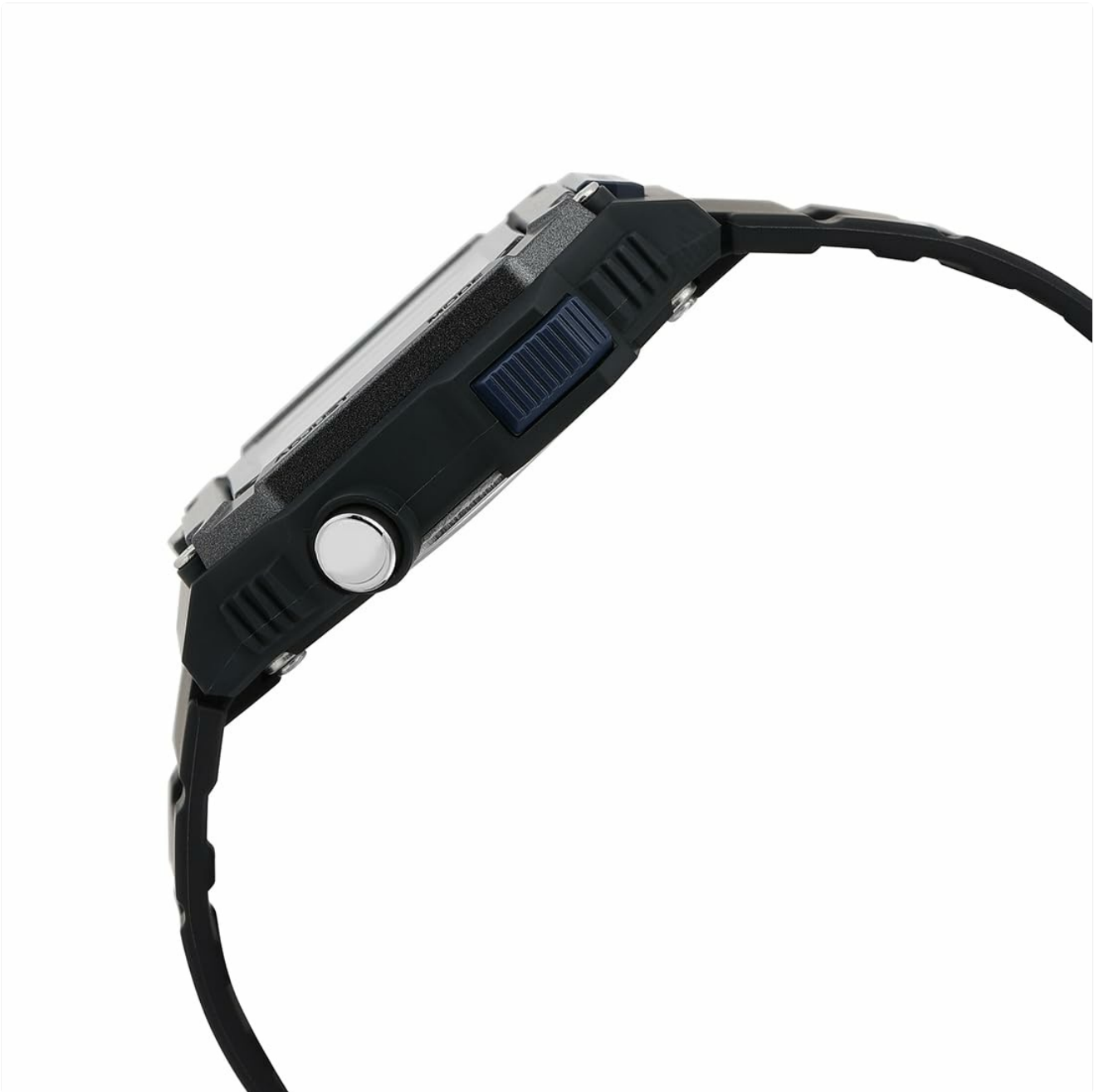
Figure 2.2: Left side view of the Casio WS-B1000-1AVDF watch, highlighting the 'ADJUST' and 'MODE' buttons.