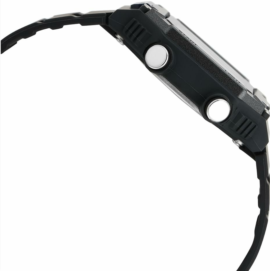
Figure 2.3: Right side view of the Casio WS-B1000-1AVDF watch, highlighting the 'LIGHT', 'SEARCH', and 'START' buttons.