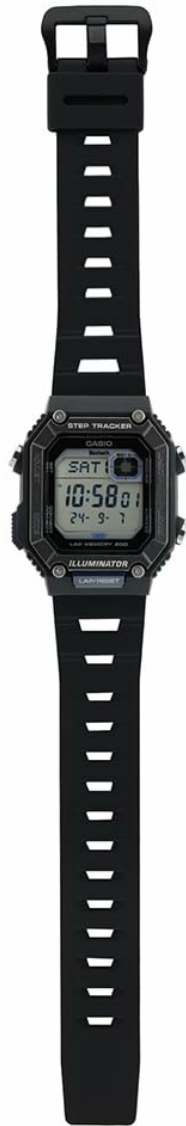
Figure 2.6: The Casio WS-B1000-1AVDF watch with its resin band fully extended, showing the buckle and strap holes.