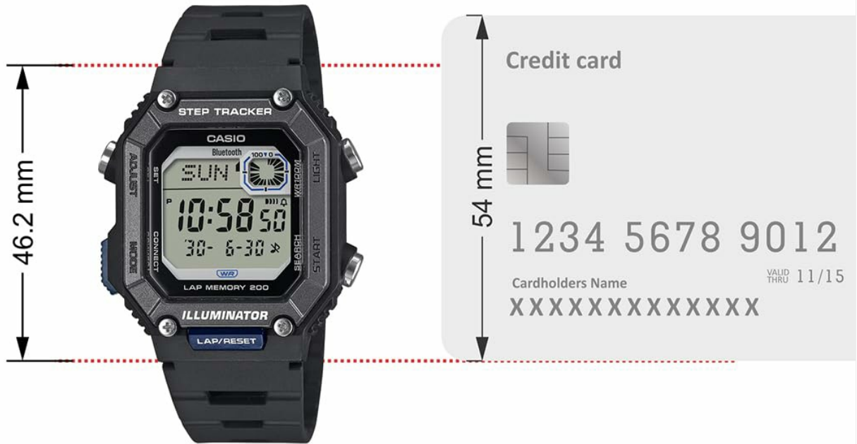
Figure 2.7: Size comparison of the Casio WS-B1000-1AVDF watch against a standard credit card, indicating approximate dimensions of 46.2 mm in height.