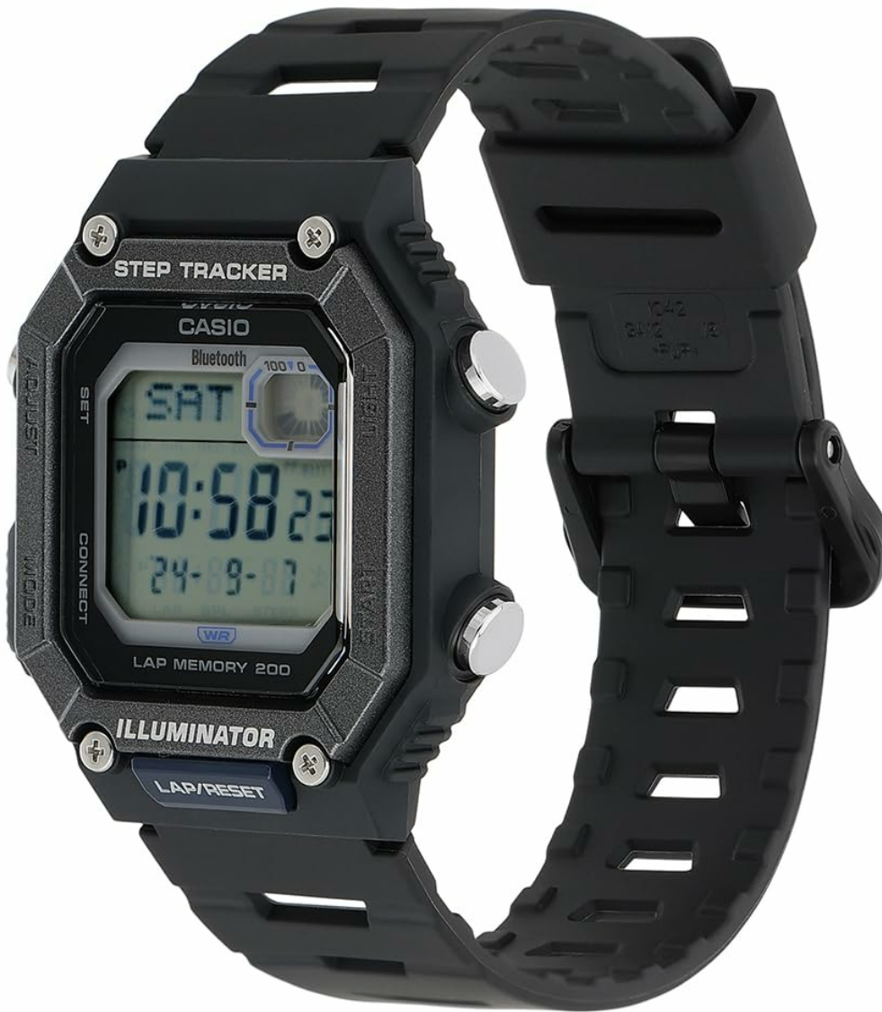
Figure 2.8: Angled view of the Casio WS-B1000-1AVDF watch, showcasing the digital display with current time and date, along with the 'STEP TRACKER' and 'ILLUMINATOR' labels.