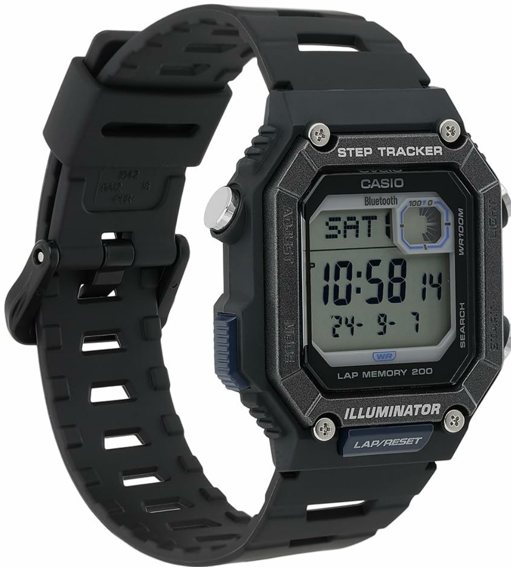
Figure 2.9: Another angled view of the Casio WS-B1000-1AVDF watch, providing a clear perspective of the watch face and its robust design.