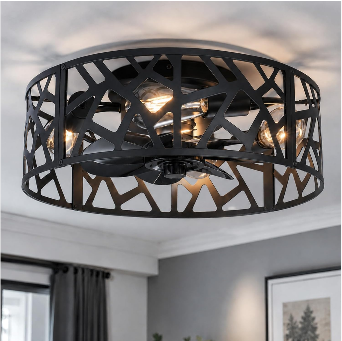
Image: Overview of the Wheatronic 18-inch Caged Ceiling Fan with Light, showing its main components including the fan body, light sockets, and decorative cage.