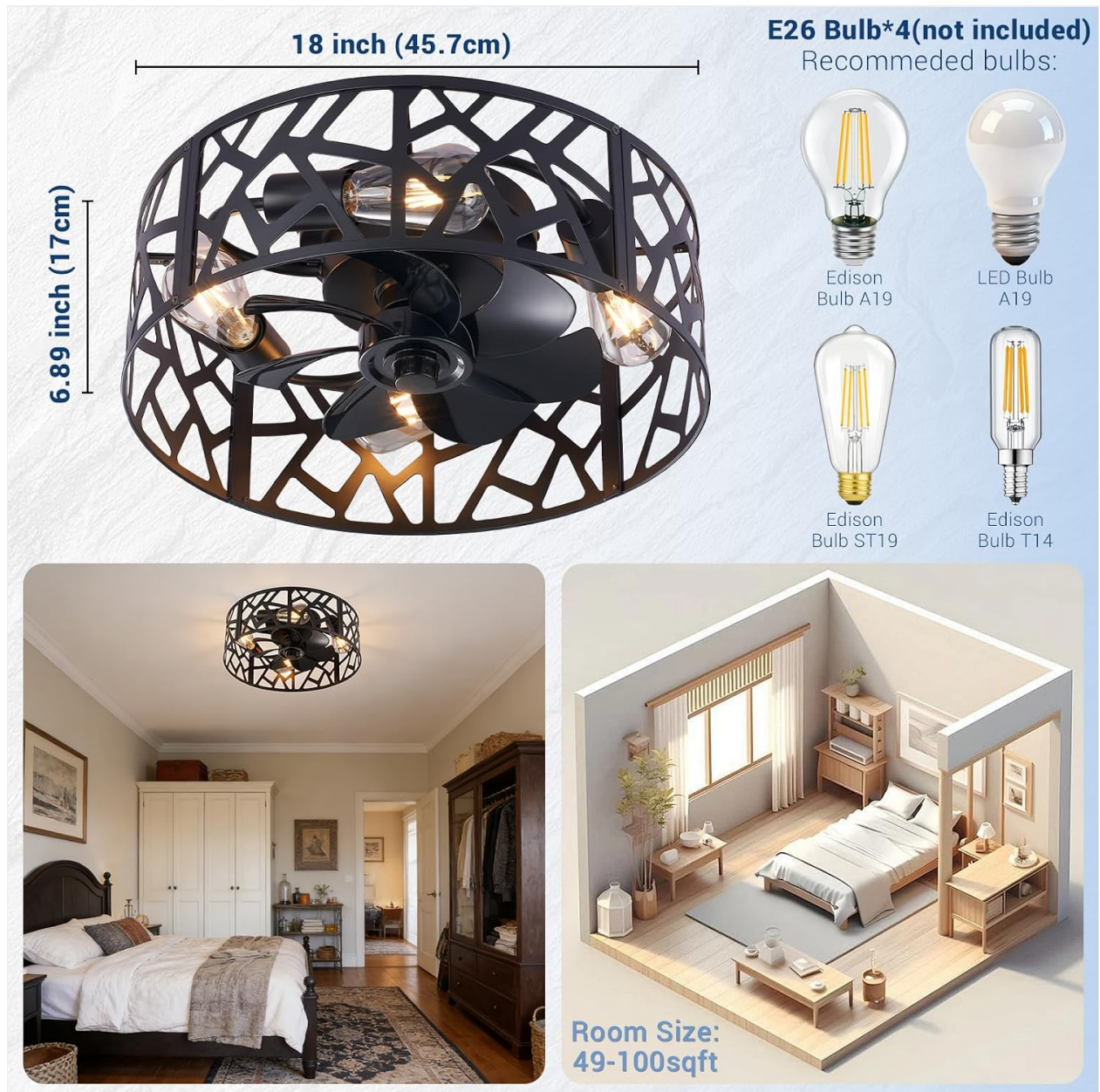
Image: Detailed view of the fan's dimensions (18 inches diameter, 6.89 inches height) and recommended E26 bulb types (Edison A19, LED A19, Edison ST19, Edison T14).