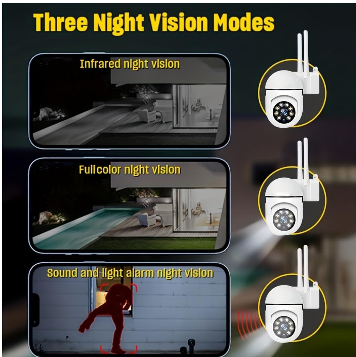
Image: Illustrations of the three night vision modes: Infrared (black and white), Full Color (illuminated by white light), and Sound and Light Alarm (with a red outline indicating an alarm trigger).