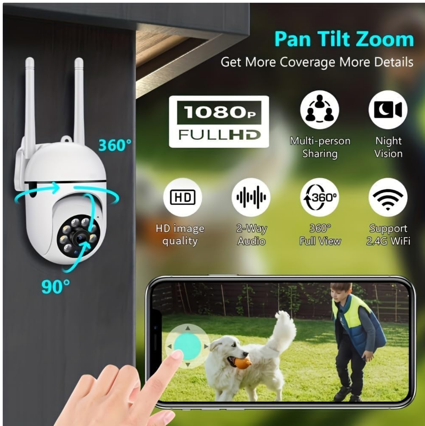
Image: The camera is shown with a wide-angle view of a house, illustrating its ability to cover a large area. A smartphone screen demonstrates remote control of the camera's rotation.

tilt (vertical) movements directly from the app interface to adjust the viewing angle.