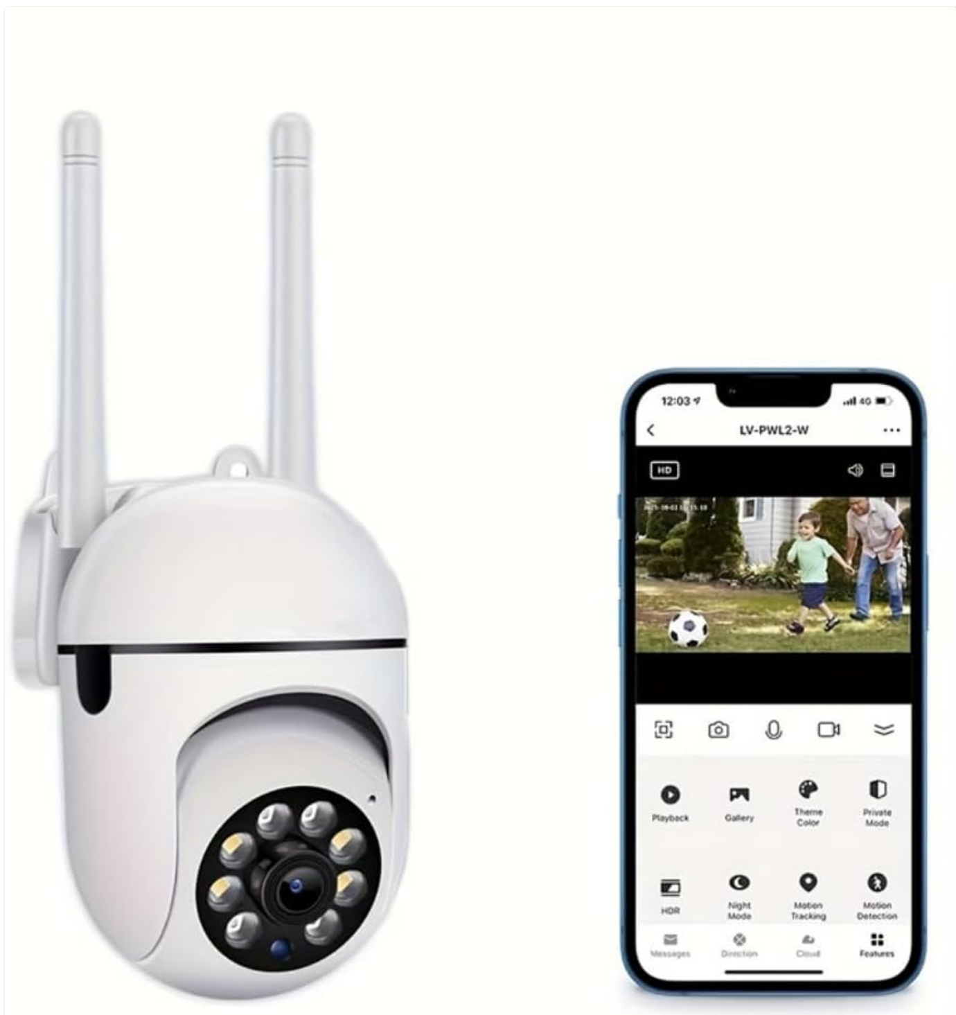
Image: The Ease Life 1080P Security Camera shown alongside a smartphone displaying its live view interface. The camera is white with two antennas and a prominent lens array. The app shows a live feed of a child and an adult playing with a ball.