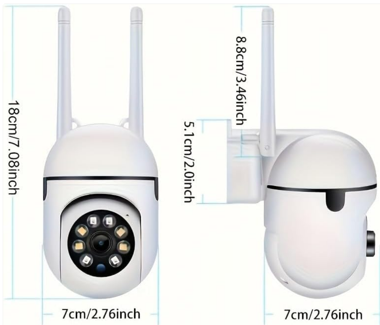
Image: A detailed view of the camera's front, highlighting the lens, infrared LEDs, and visible light LEDs for color night vision.

Familiarize yourself with the main components of your security camera.