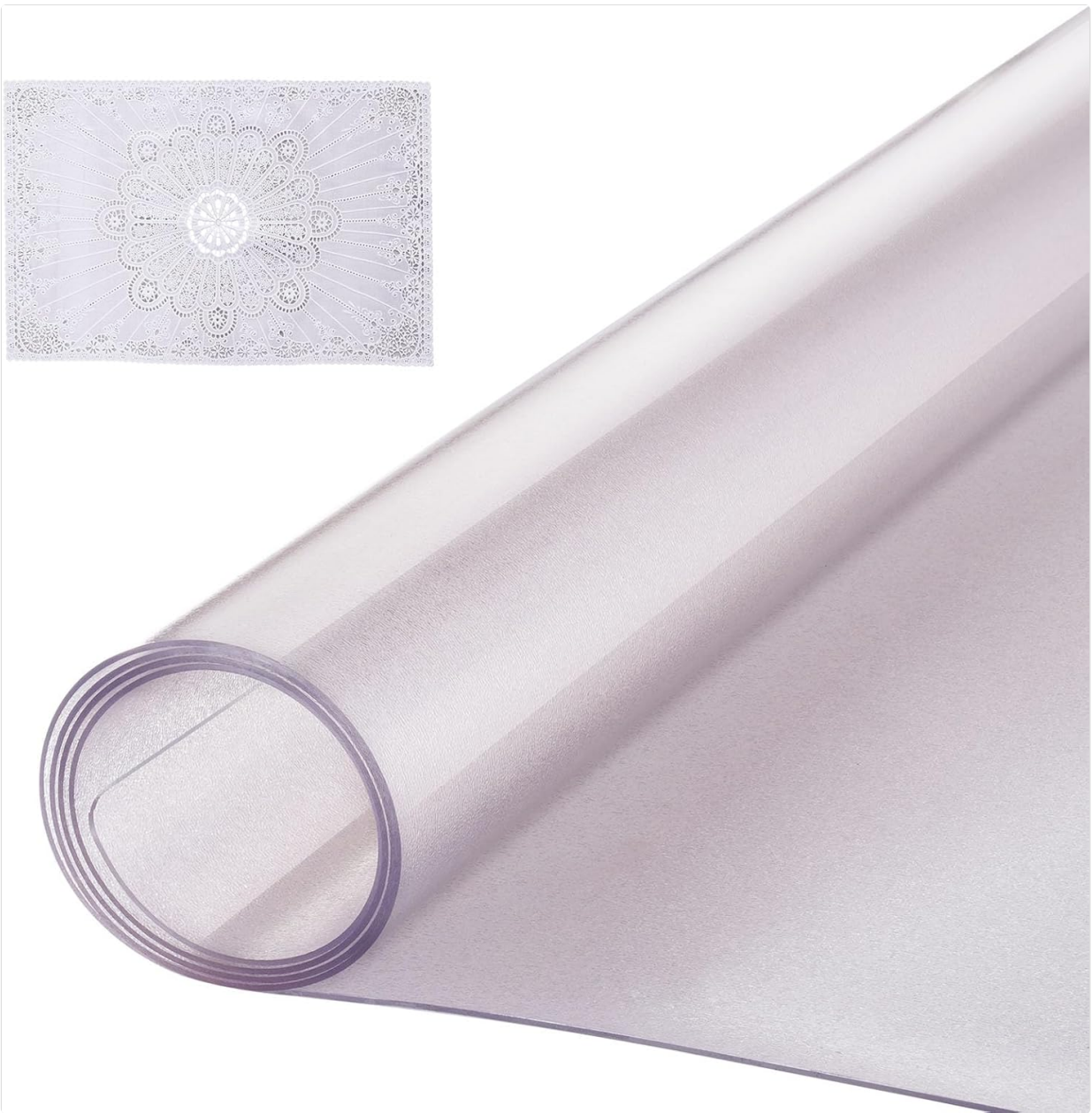
Figure 1: VEVOR 36x60 Inch Frosted PVC Table Protector, shown rolled up and ready for installation.