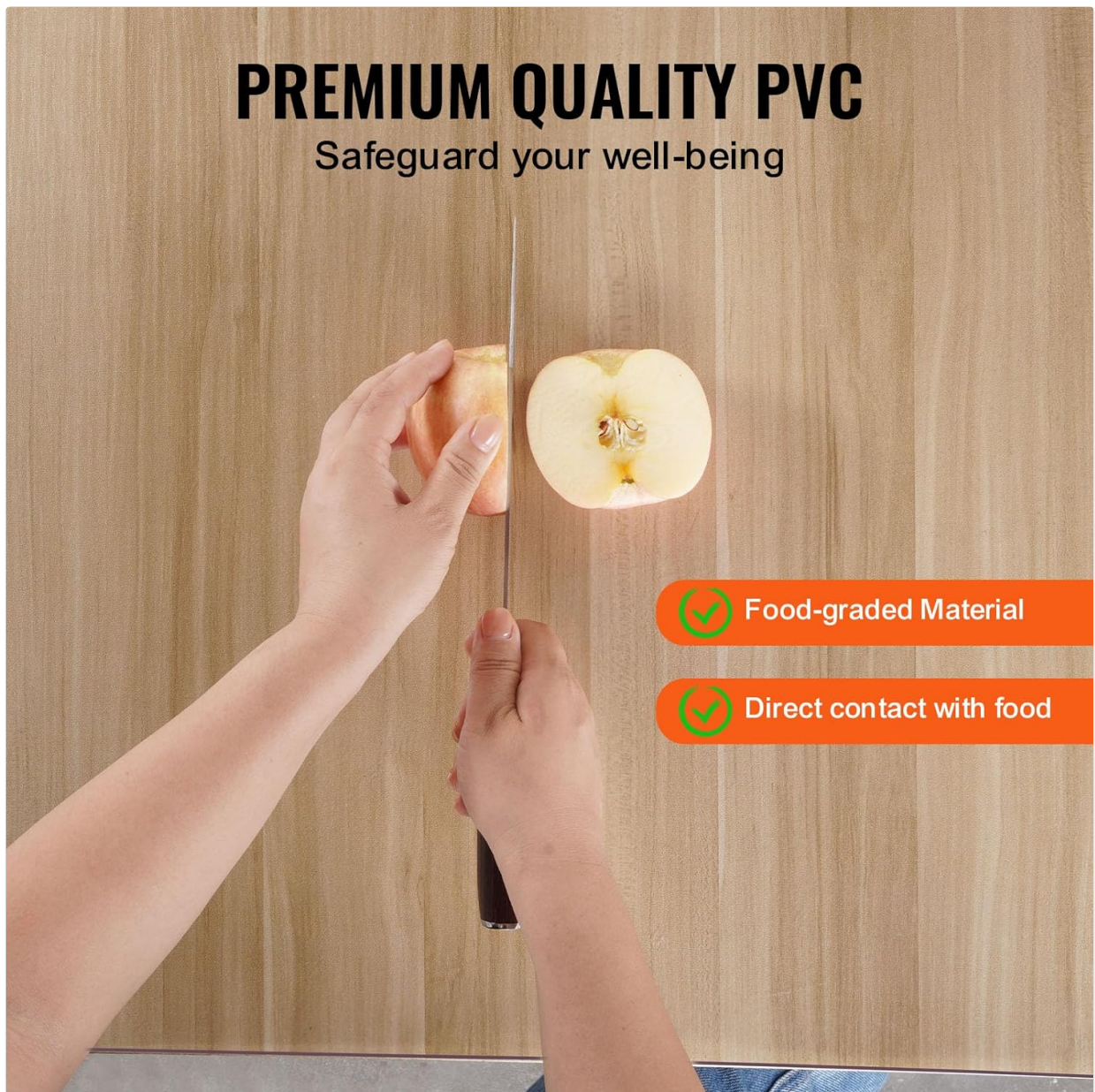
Figure 3: Demonstrating direct food contact on the table protector.