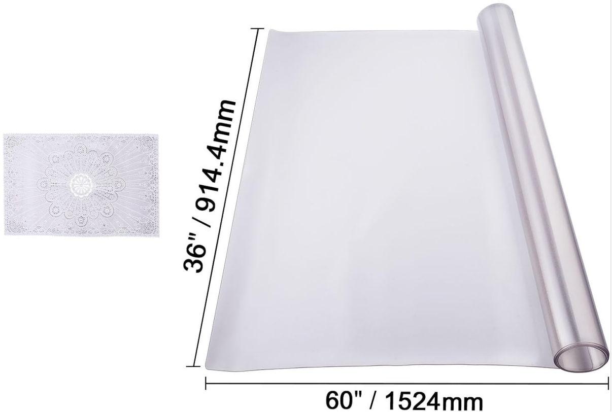
Figure 6: Detailed product dimensions and key specifications.

Product Size : 36 x 60 inch / 914.4 x 1524 mm