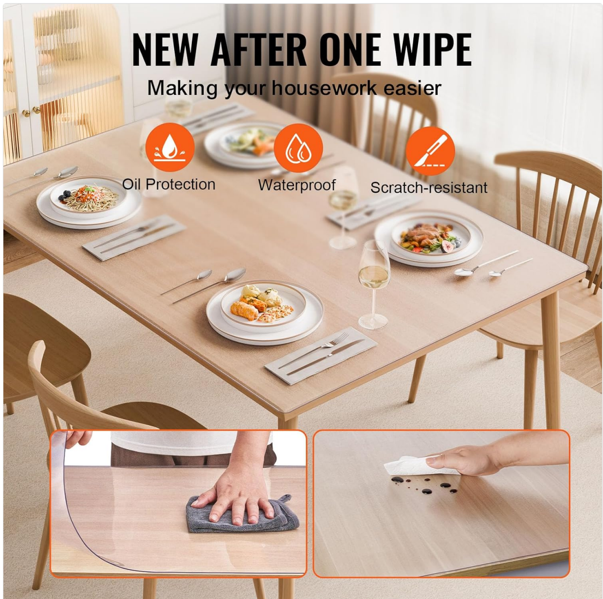
Figure 5: Easy cleaning of spills from the table protector surface.