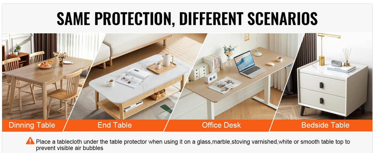
Figure 4: Examples of the table protector used on dining tables, end tables, office desks, and bedside tables.