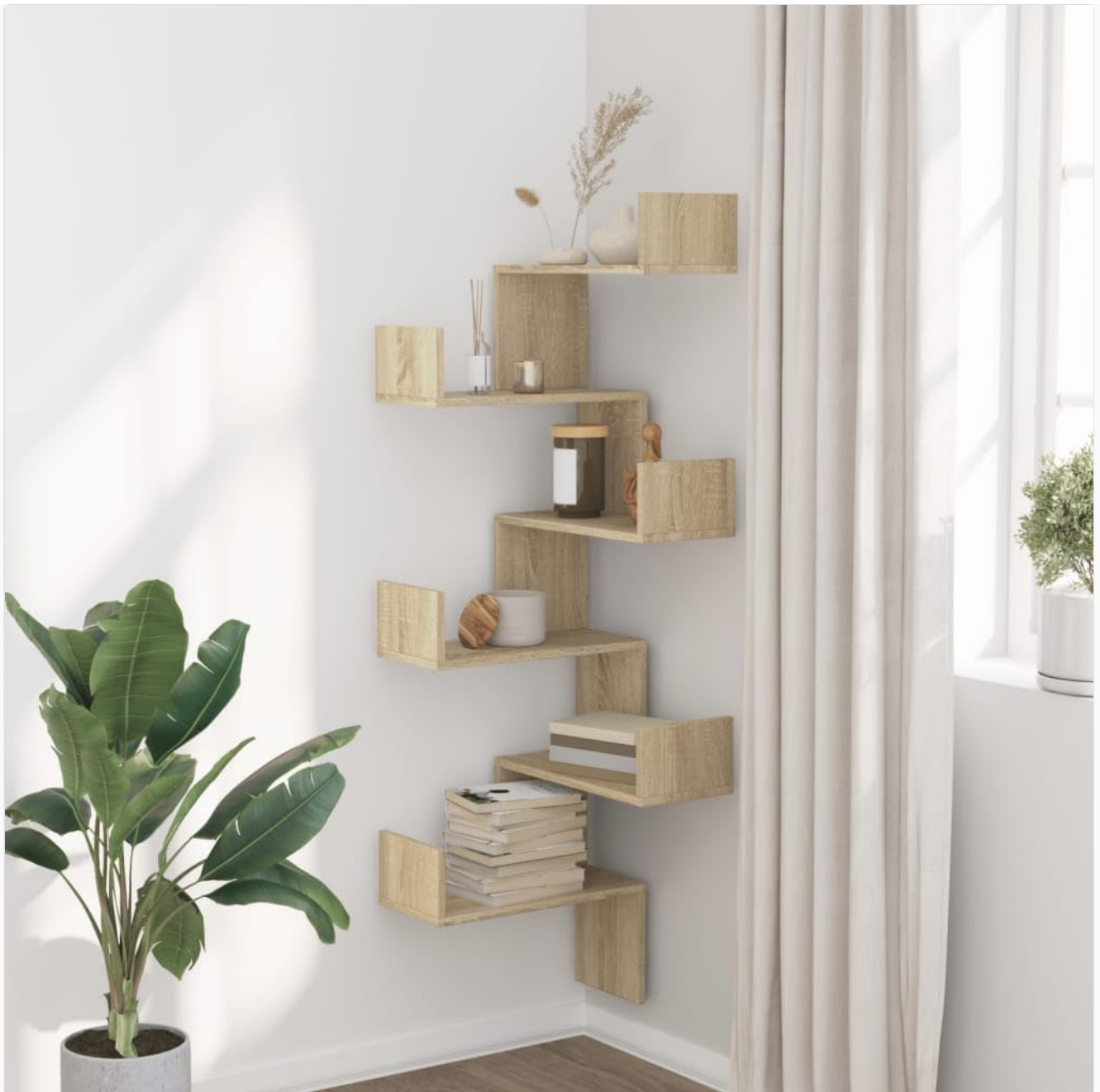
Figure 3: Assembled Corner Wall Shelf with Decorative Items