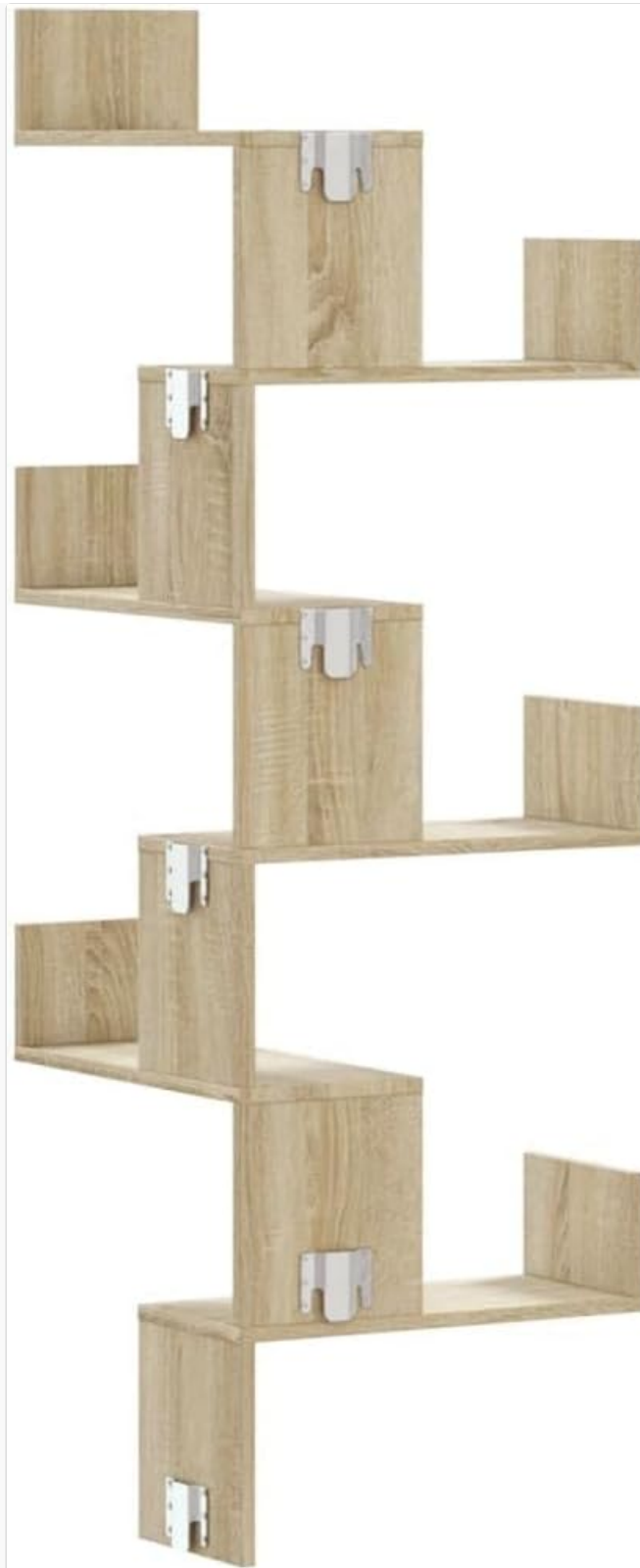
Figure 2: Detail of a Wall Mounting Point

Your browser does not support the video tag.