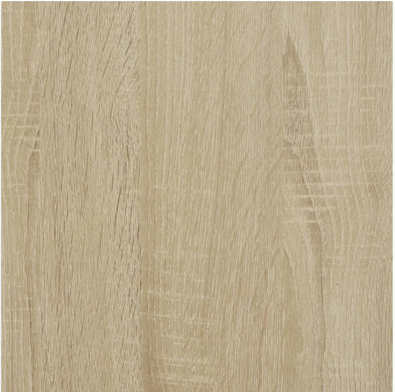
Figure 4: Sonoma Oak Wood Grain Detail