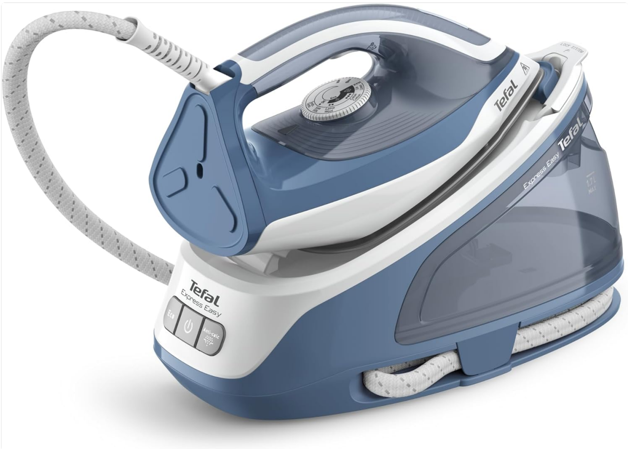
Image 4.1: Side view showing the temperature dial and steam trigger.

4. Move the iron smoothly over the fabric.