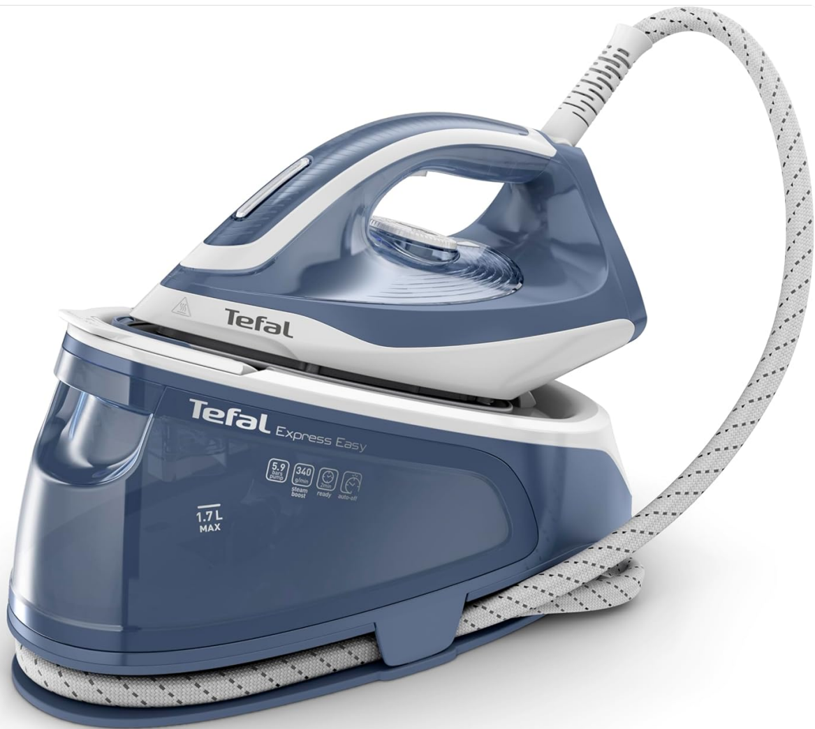
Image 1.1: Front view of the Tefal Express Essential Steam Generator Iron.