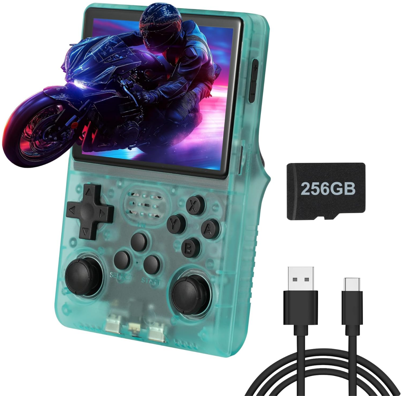
Image 1.1: HHU R40S Pro Handheld Game Console and included accessories.