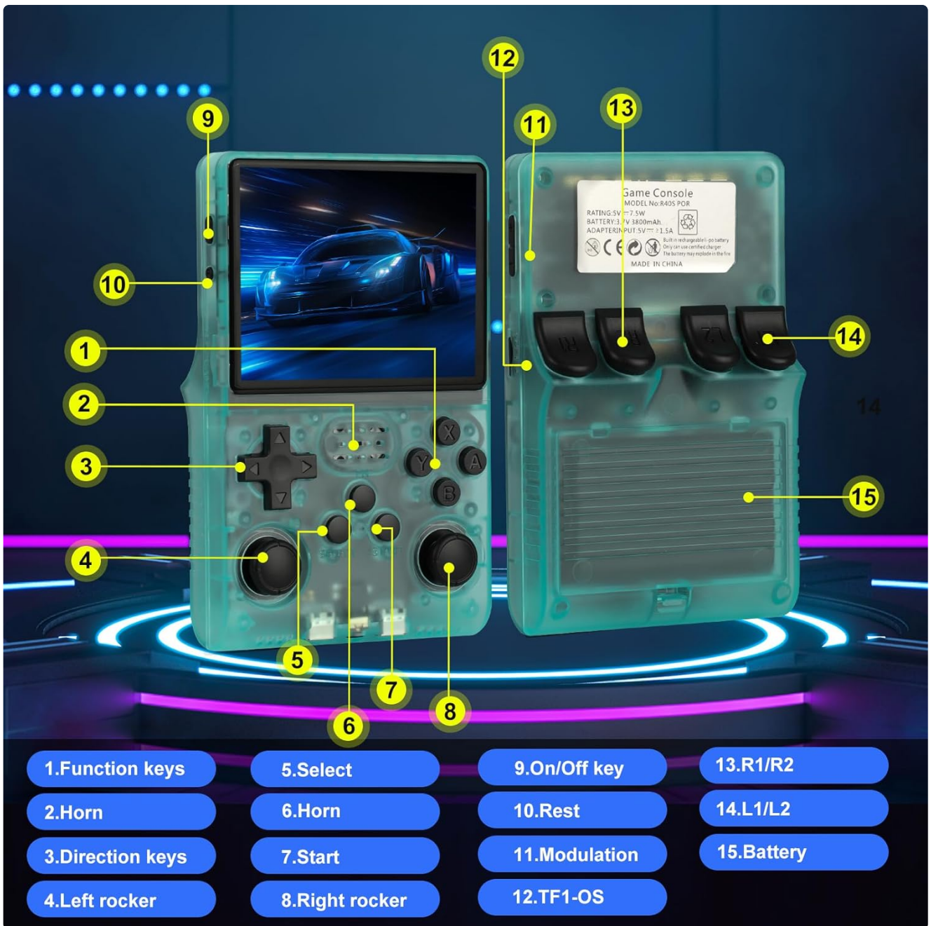
Image 2.1: Front and rear view of the HHU R40S Pro with labeled components.