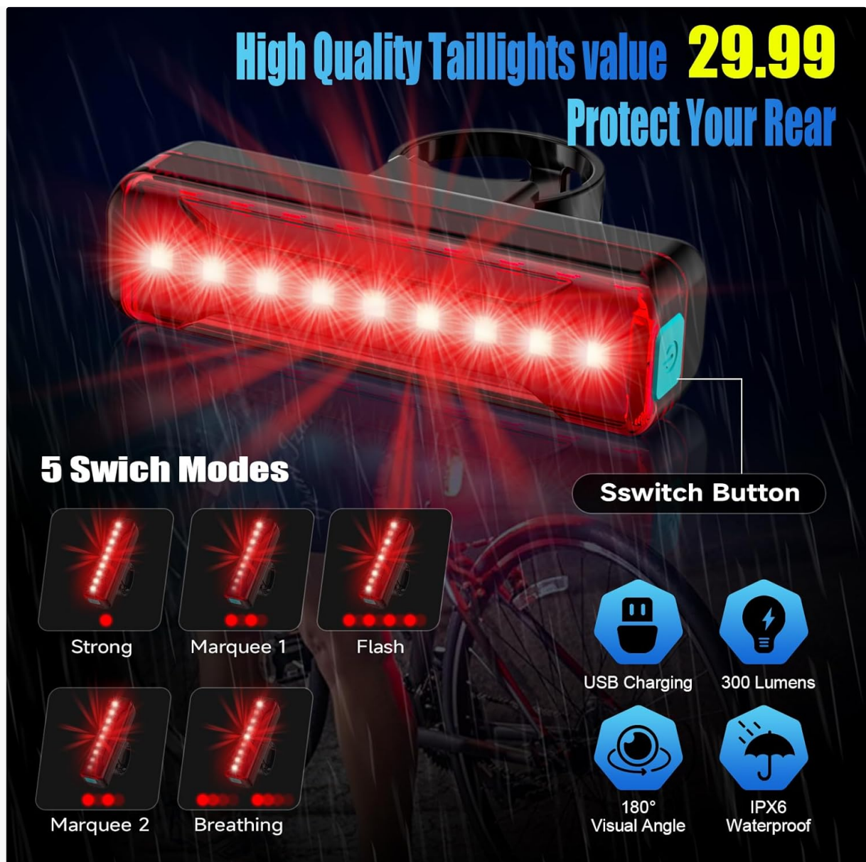
Figure 3: Taillight modes and features.

High Quality Taillights value 29.99 Protect Your Rear