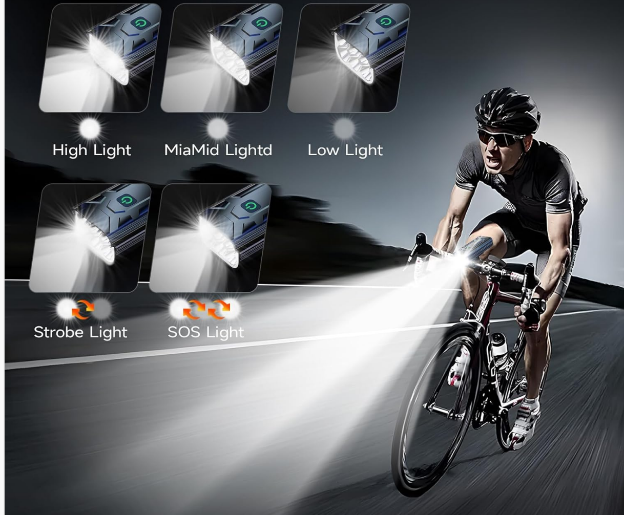
Figure 2: Headlight modes and their appearance.

Long press the switch for 5 seconds to switch modes