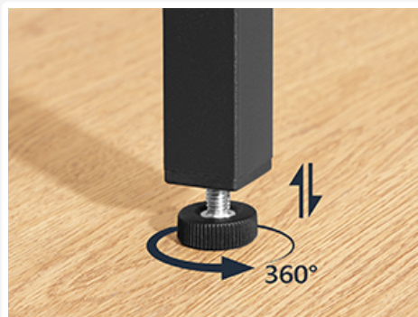
Image: A close-up of one of the four adjustable feet, which can be rotated 360 degrees to level the stand on uneven surfaces.