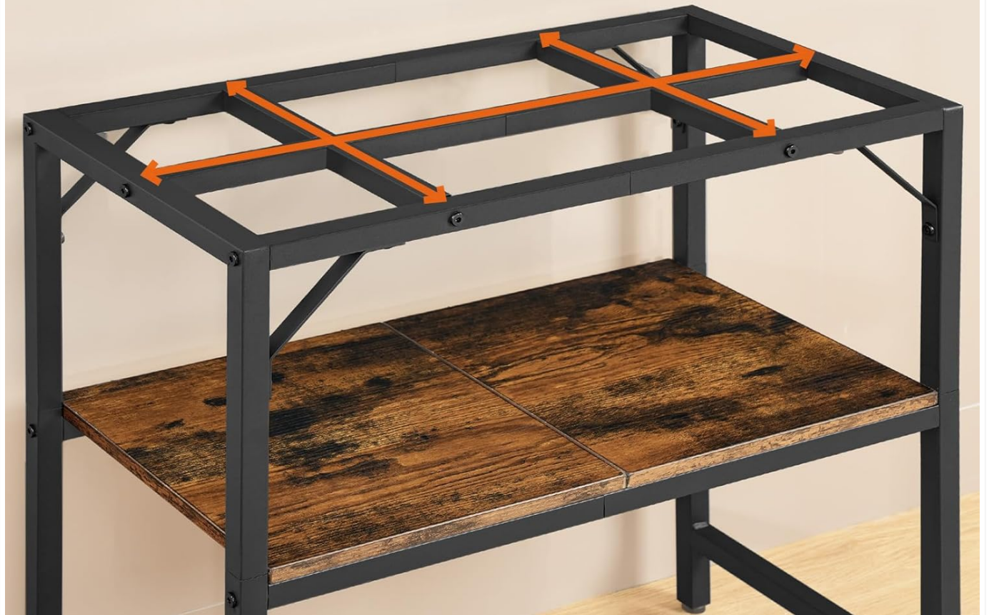
Image: An illustration demonstrating the 2-in-1 design of the stand, which allows for organized storage habits by dividing the space into left and right zones.