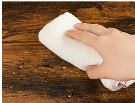
Image: A close-up showing a hand wiping water from the stand's surface, demonstrating its easy-to-clean material.