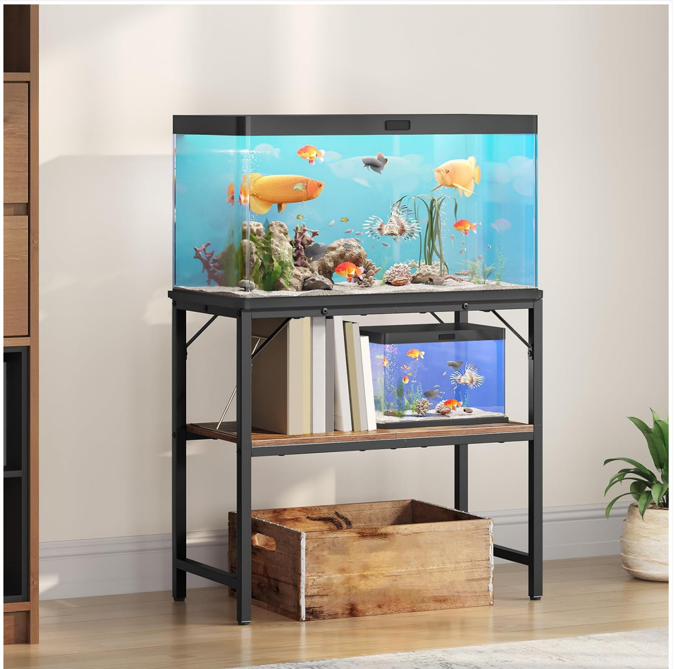
Image: The MAHANCRIS 30 Gallon Fish Tank Stand, showcasing its two-tier design with a large fish tank on the top level and a smaller tank with books on the lower shelf. A wooden crate is placed on the floor beneath the stand.