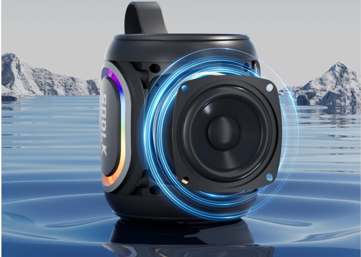
Figure 2: Internal components of the SODLK T13 speaker, illustrating its sound engineering for loud sound and bass boost.