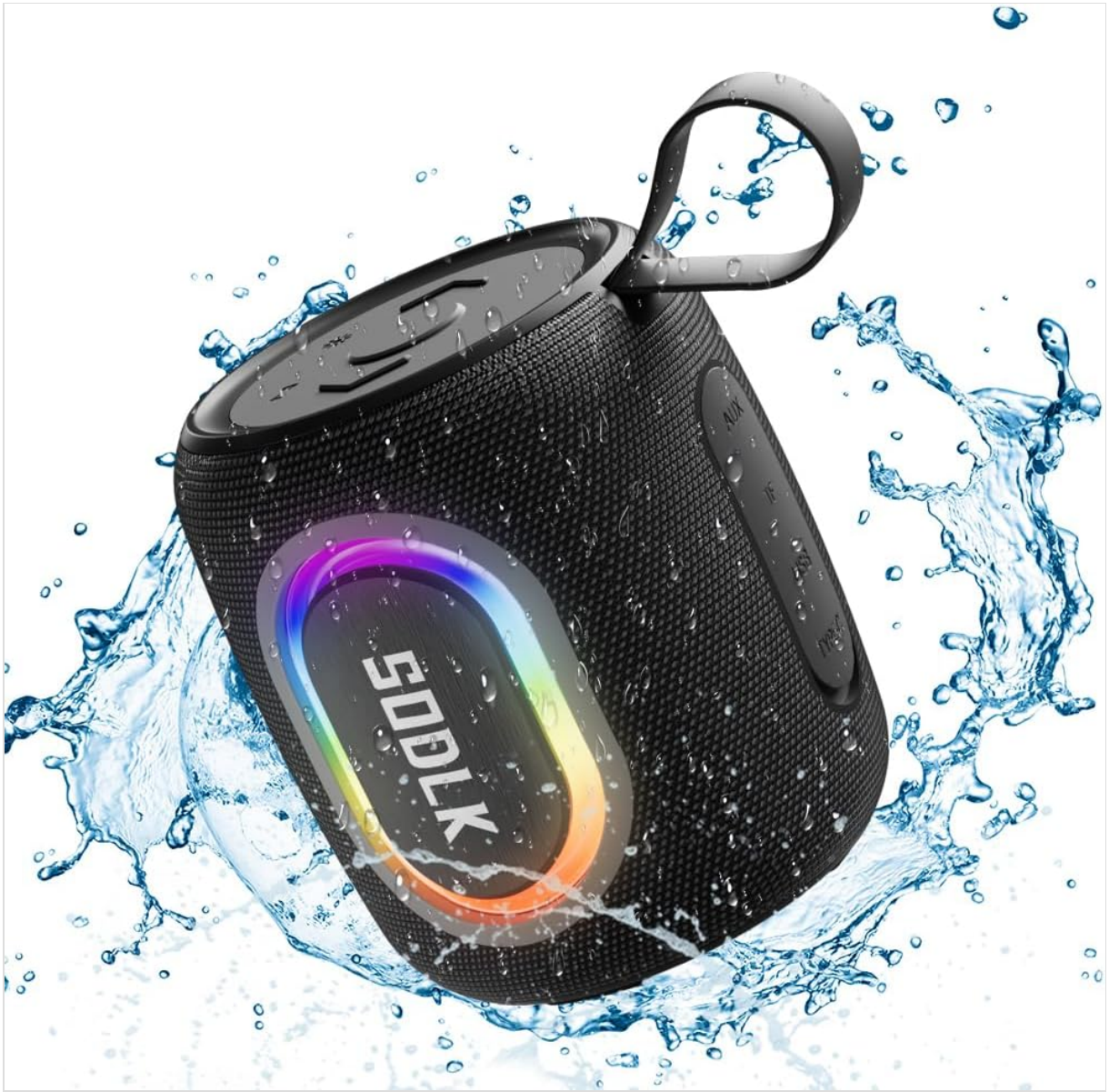
Figure 1: The SODLK T13 Portable Bluetooth Speaker demonstrating its IPX7 waterproof capability amidst splashing water.