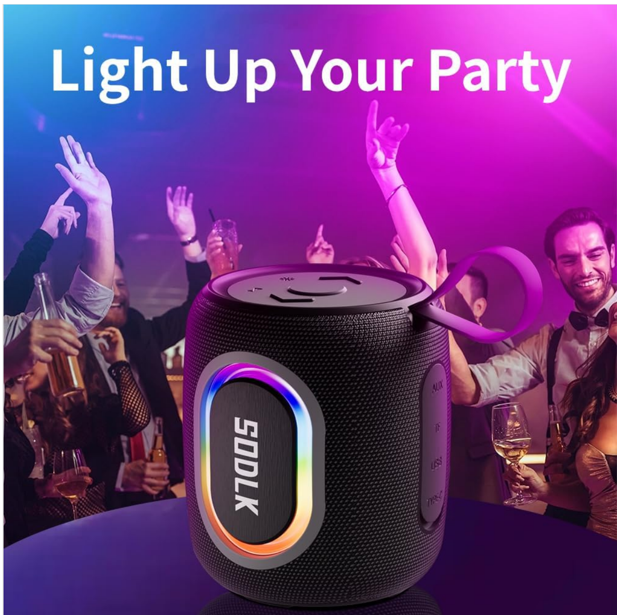
Figure 3: The SODLK T13 speaker illuminating a party atmosphere with its integrated RGB lighting.

The SODLK T13 features dynamic RGB lighting. Press the Light Mode button (often indicated by a lightbulb icon or similar) to cycle through different light patterns and colors. Press and hold to turn the lights off or on.