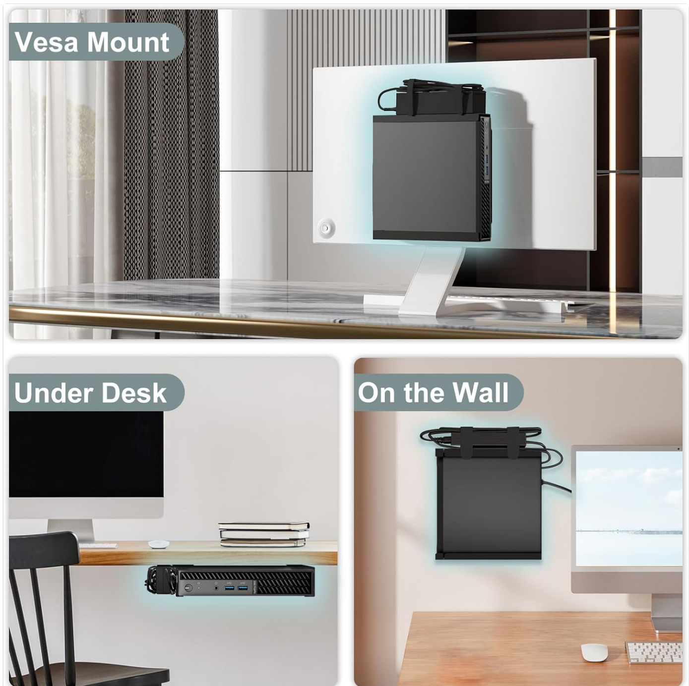
Figure 4: A Dell Micro PC securely mounted behind a monitor using the VESA bracket, demonstrating a clean and integrated setup.