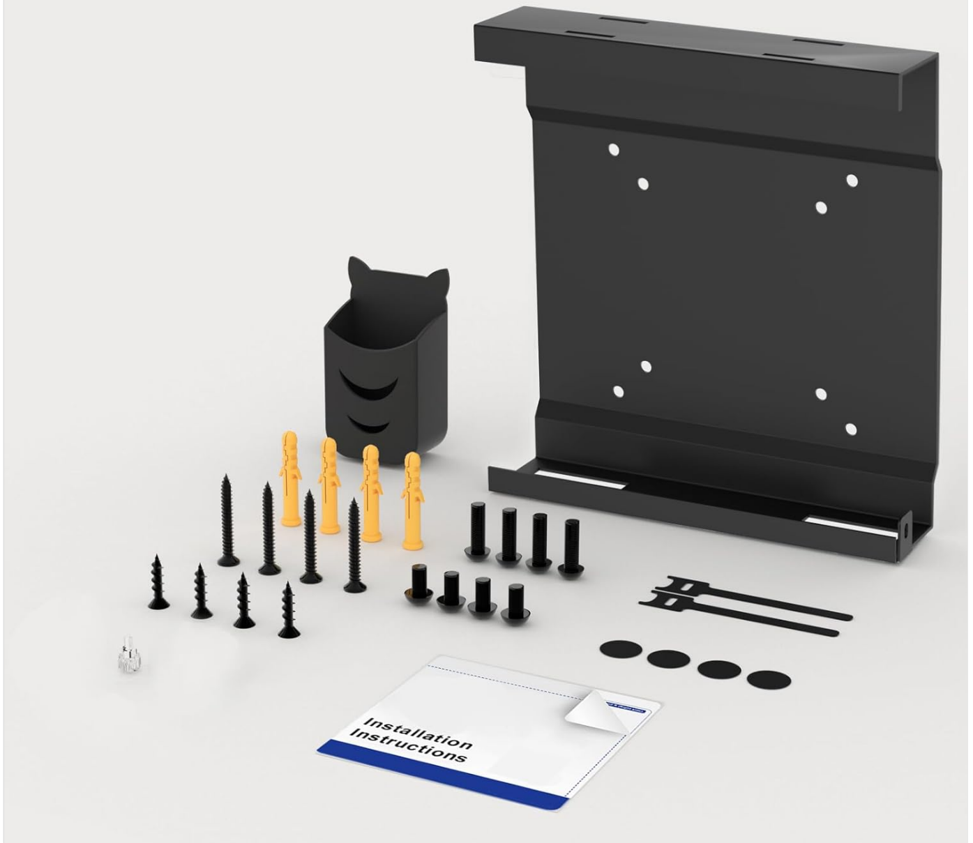
Figure 9: Product dimensions and a complete set of included accessories, including the bracket, pen holder, various screws, and installation instructions.

18.6cm*4.2cm*17cm / 7.32in*1.65in*6.69in