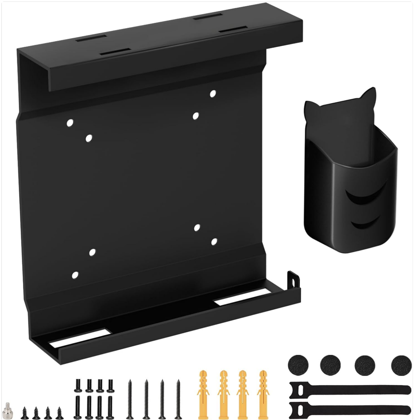
Figure 2: All components included in the Varghesyla mounting bracket package. This includes the main bracket, a pen holder, various screws, wall anchors, Velcro straps, and rubber pads.