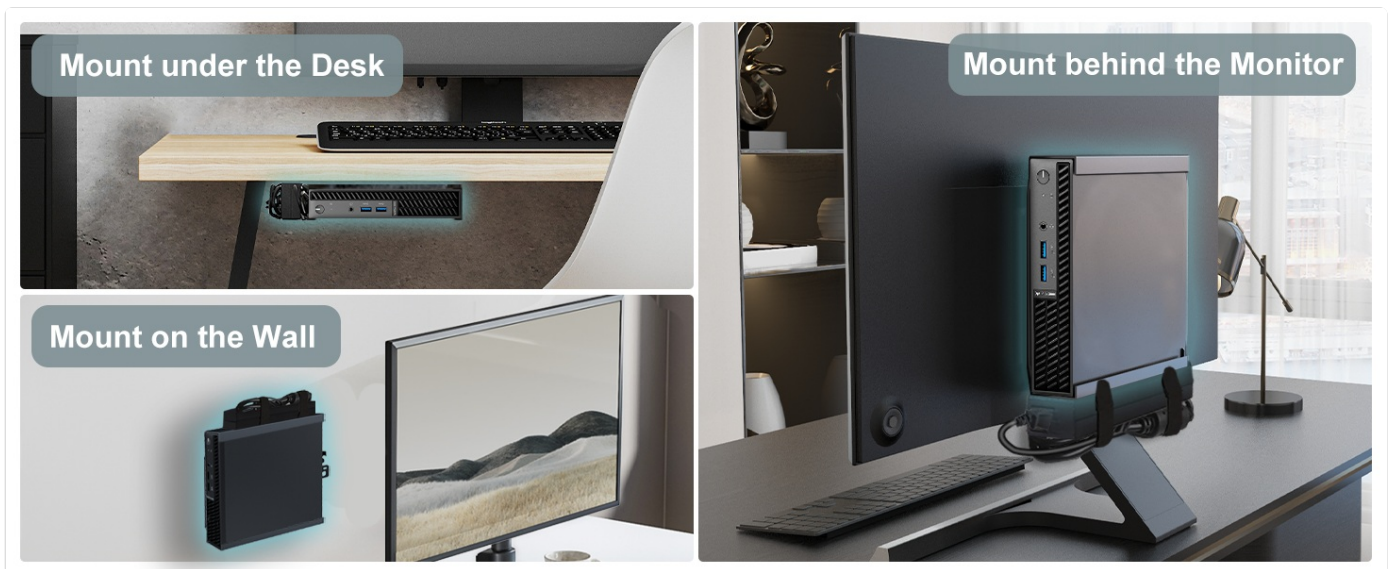
Figure 7: Overview of the three primary mounting options: VESA mount behind a monitor, under desk mount, and wall mount, demonstrating the versatility of the bracket.