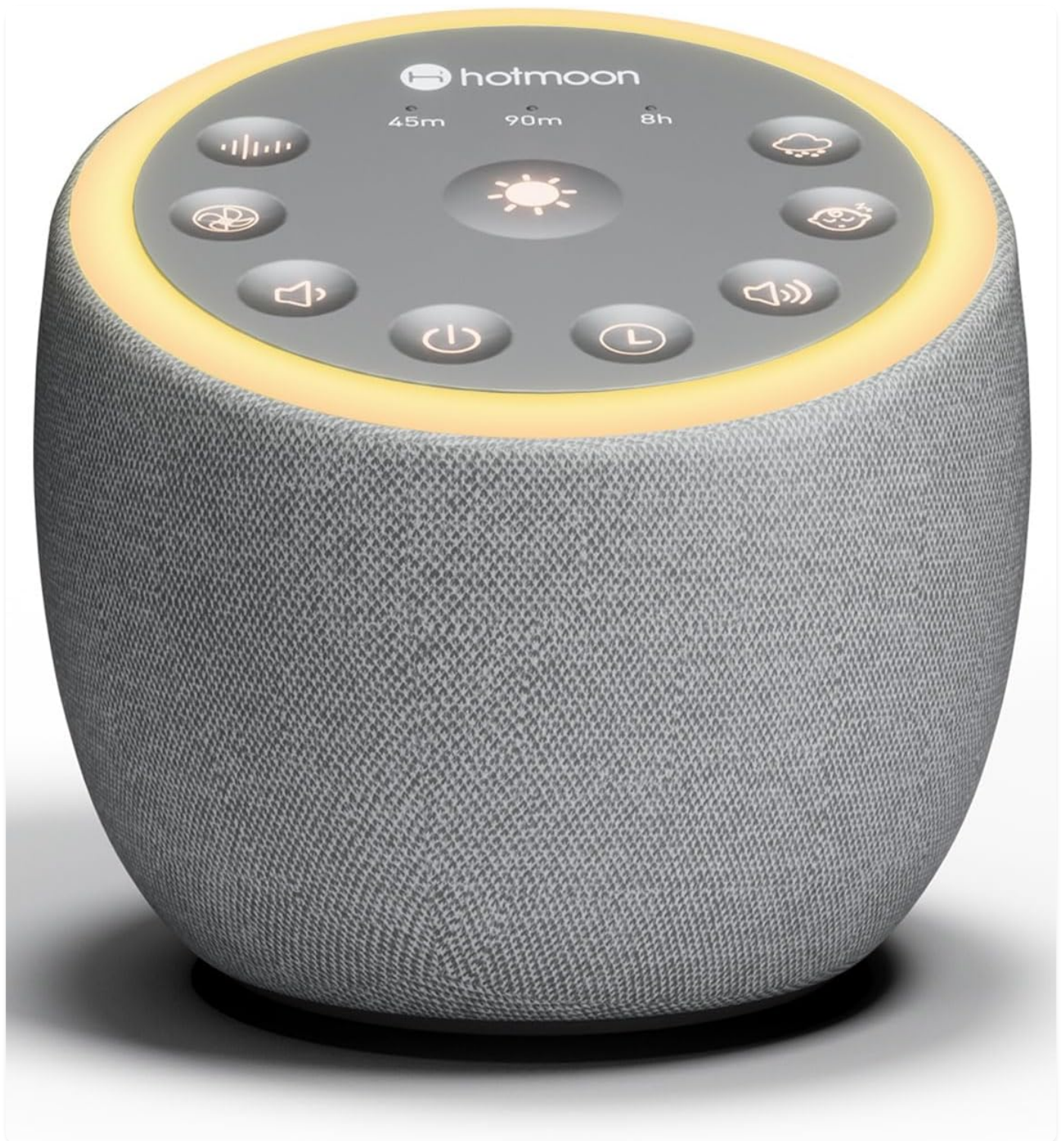
Image 3: Close-up view of the Hotmoon Mona Pro's top control panel, showing buttons for power, volume, sound selection, light, and timer.