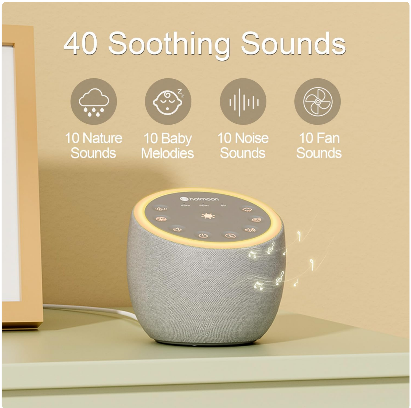
Image 2: Illustration of the 40 soothing sounds available on the Hotmoon Mona Pro, categorized into nature, baby melodies, noise, and fan sounds.