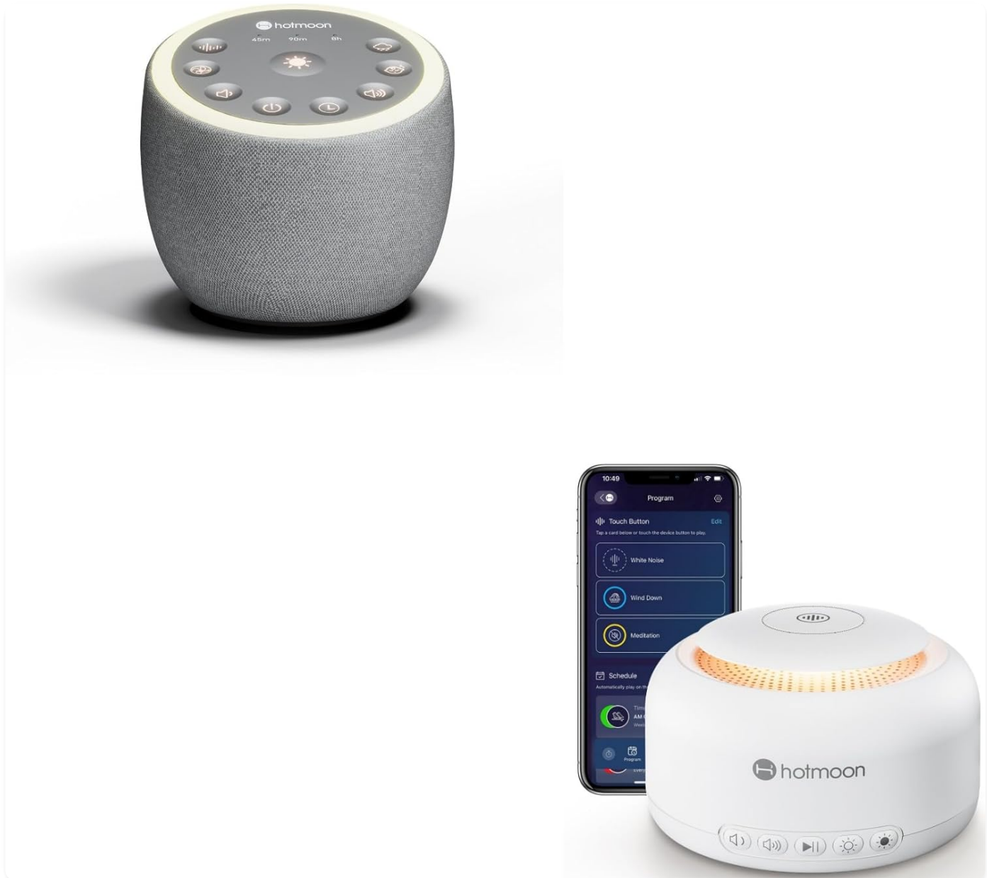
Image 1: Hotmoon Mona Pro Smart White Noise Sound Machine. This image shows the primary grey fabric model of the sound machine with its top control panel illuminated.