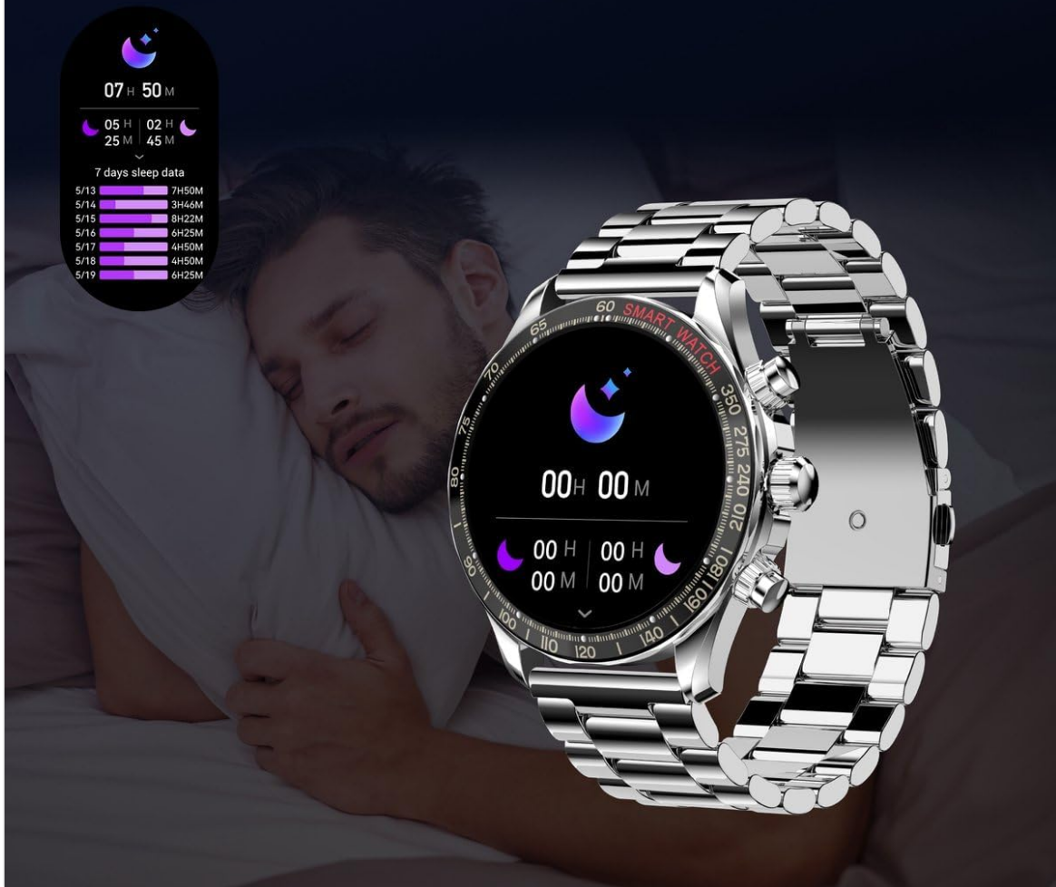
Image: The sleep monitoring function of the Maoo Titan smartwatch, tracking sleep duration and quality.