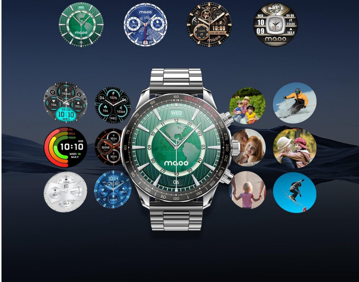
Image: A selection of over 300 watch faces available for the Maoo Titan, including options for custom photo backgrounds.