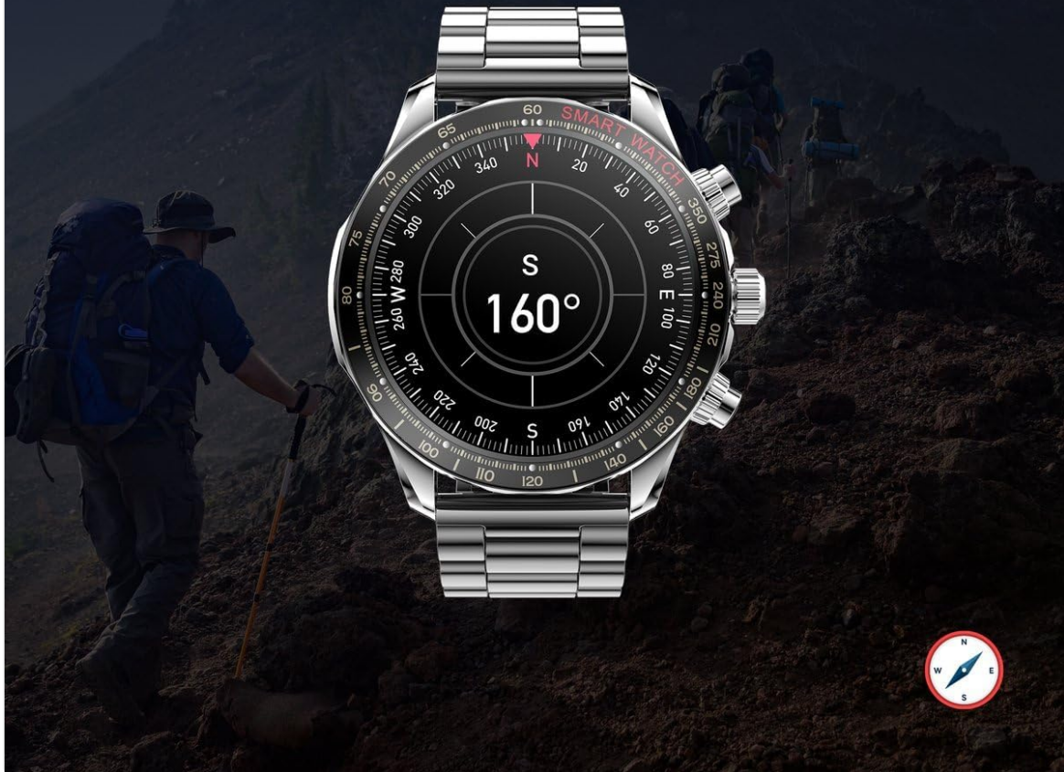
Image: The internal compass feature of the Maoo Titan smartwatch, showing directional readings.