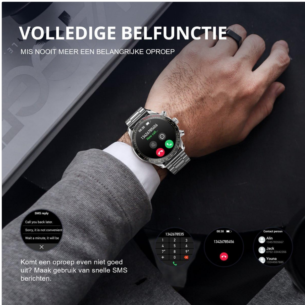
Image: Demonstrating the full call function of the Maoo Titan smartwatch, allowing users to answer and make calls directly from the watch.

With Bluetooth 5.2, the Maoo Titan allows you to answer incoming calls and make calls directly from your wrist without needing to use your phone. Ensure your watch is connected to your smartphone via Bluetooth.