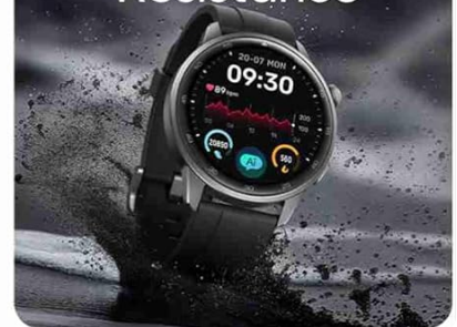
Image: The watch screen showing a heart rate graph, illustrating the AI-customized health tracking feature.