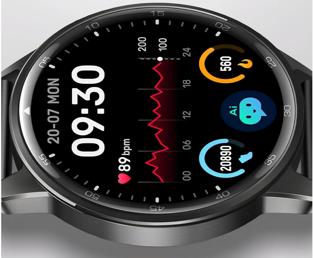
Image: The realme Watch S2 highlighting its AI capabilities for analyzing over 110 sports modes.