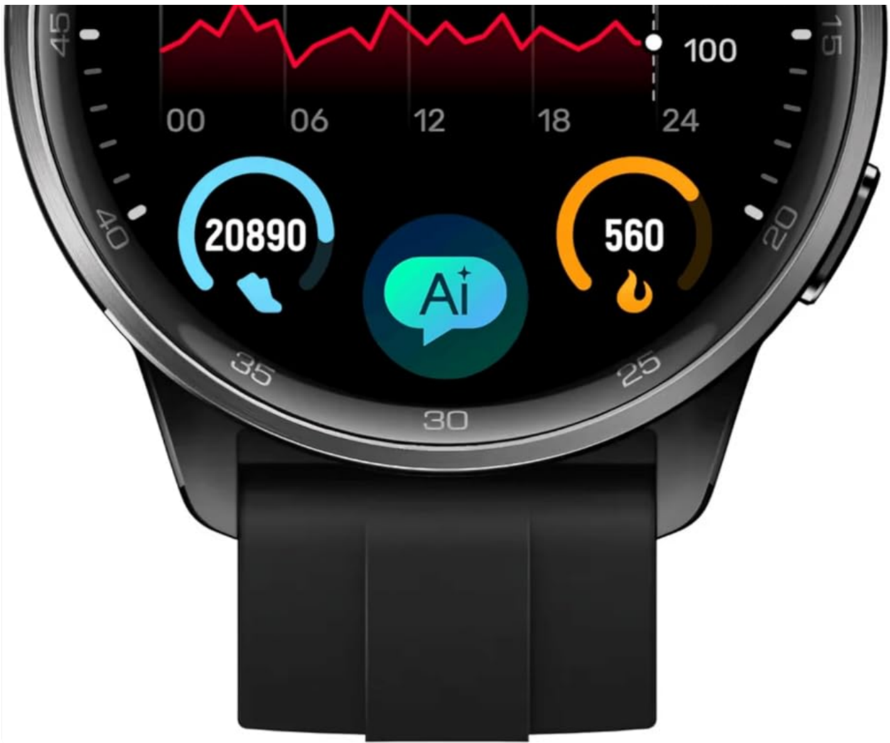
Image: Front view of the realme Watch S2, showcasing its round AMOLED display with various health metrics.