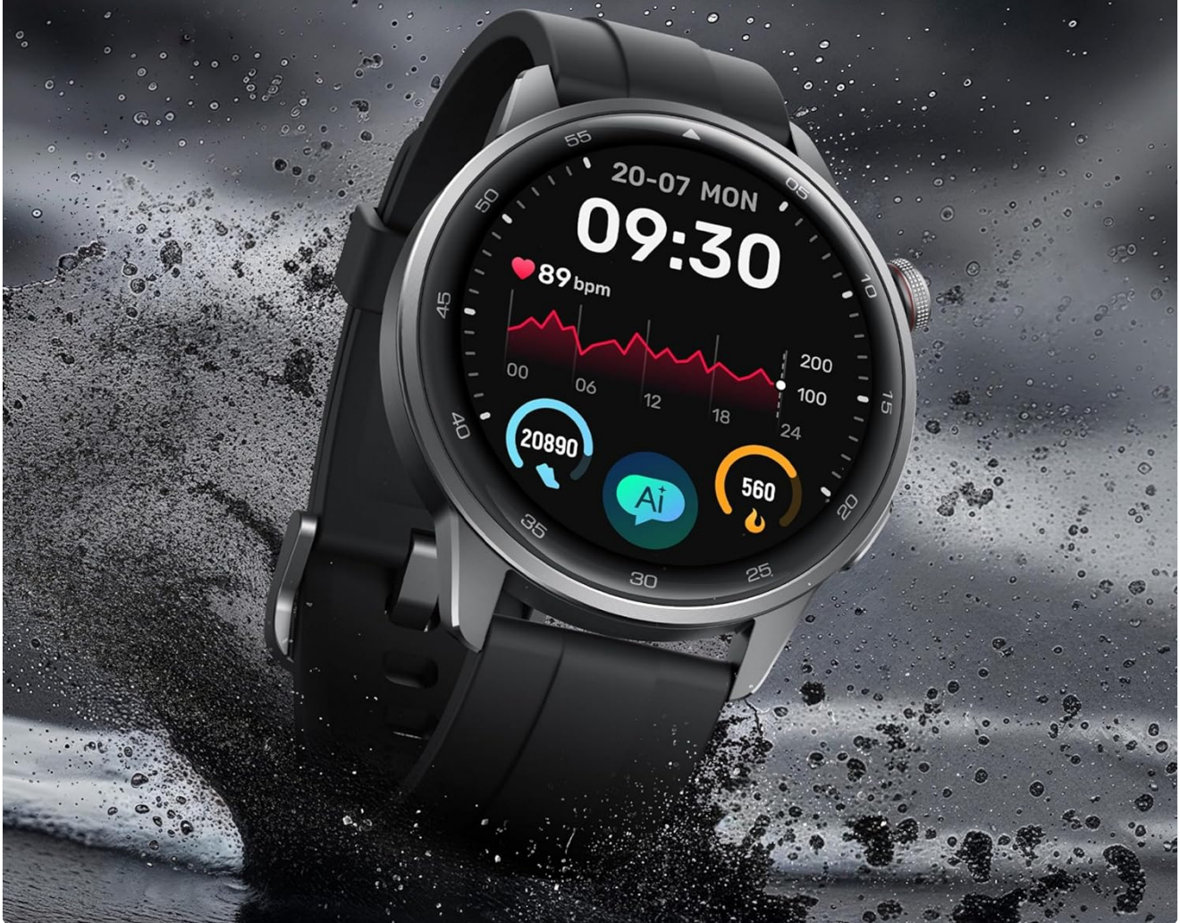
Image: The realme Watch S2 submerged in water, illustrating its IP68 dust and water resistance.