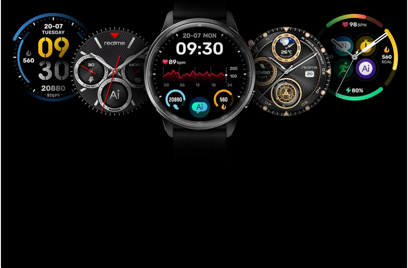
Image: The realme Watch S2 screen showing the 'AI voice dial' function, powered by its Super AI Engine.