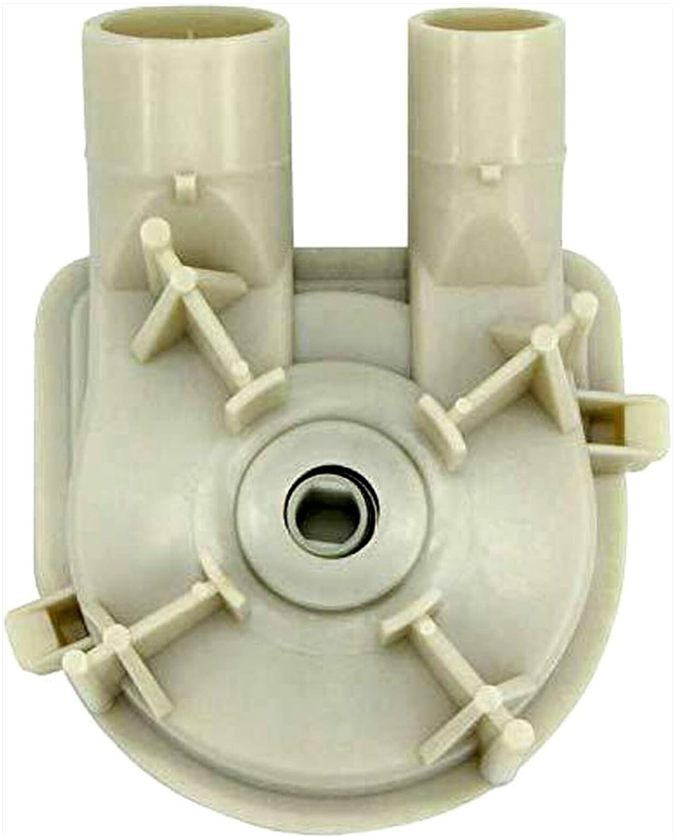
Image 1: Overview of the replacement water drain pump. This component is responsible for expelling water from the washer tub during the drain cycle.