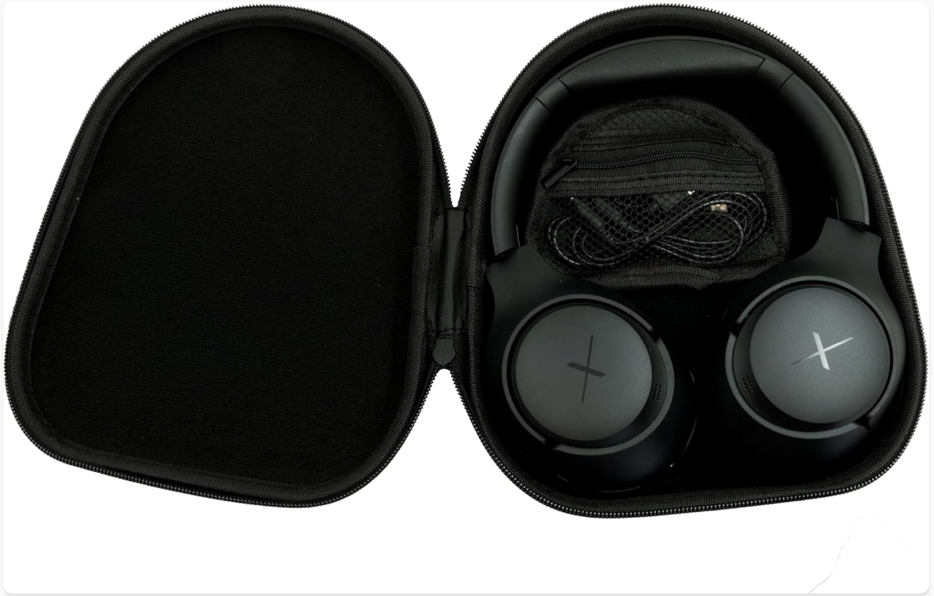
Image: VolcanoX VXH300 Headphones neatly stored in their carrying case, alongside the included charging and audio cables.