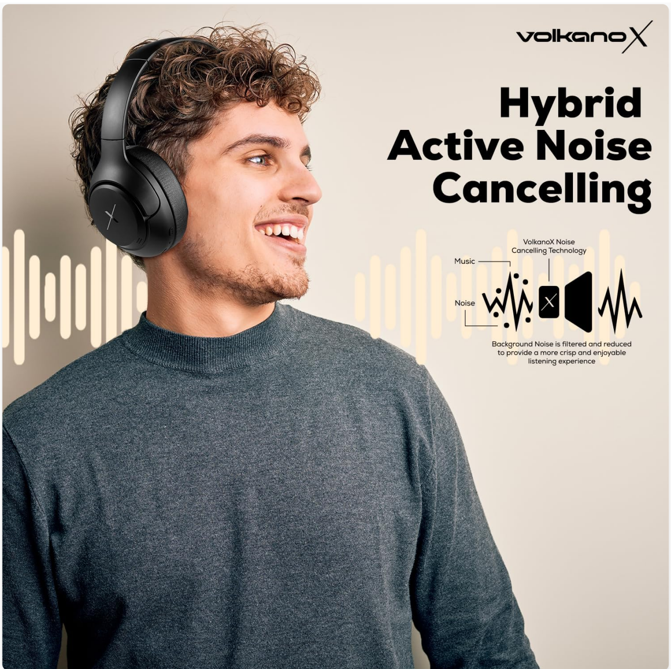
Image: A visual representation of Hybrid Active Noise Cancelling, showing how external noise is filtered to enhance the listening experience.