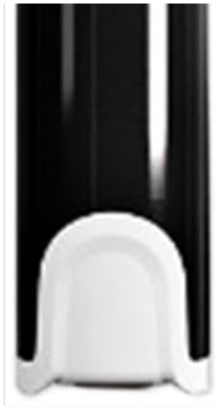
Image: A clear, standalone view of the Handheld Electric Beverage Mixer, highlighting its sleek black handle and white whisk attachment.