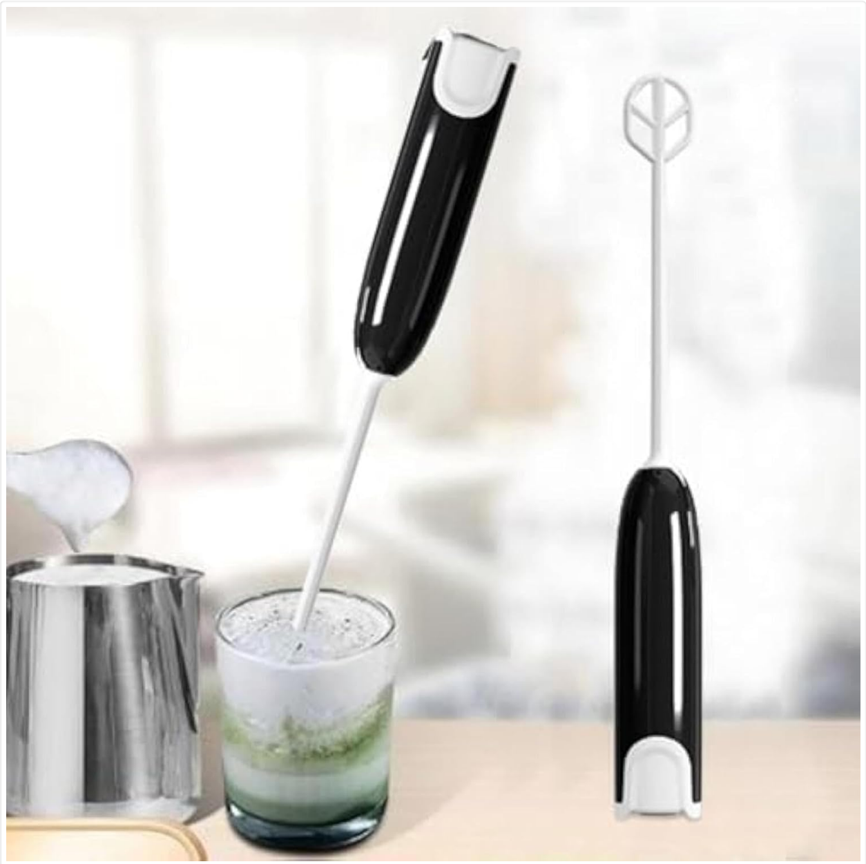
Image: The Handheld Electric Beverage Mixer positioned next to a stainless steel frothing pitcher and a glass containing a green beverage, illustrating its use in a kitchen setting.

Store the mixer in a dry place, away from direct sunlight and extreme temperatures. Ensure the whisk attachment is clean and dry before storage.