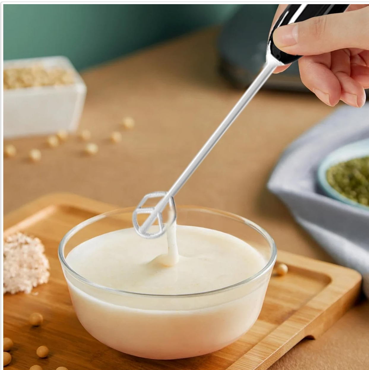
Image: The Handheld Electric Beverage Mixer actively frothing a light-colored liquid in a clear glass bowl, demonstrating its mixing capability.