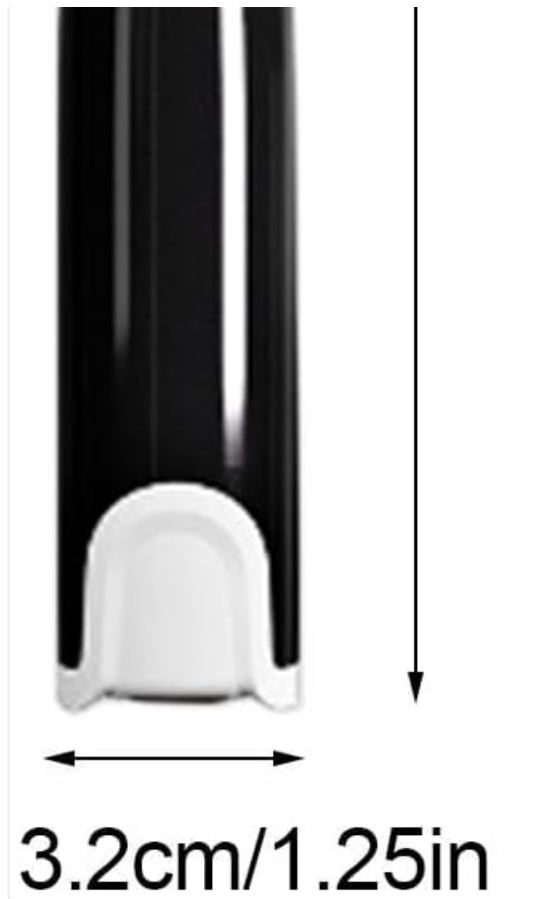
Image: A diagram showing the dimensions of the Handheld Electric Beverage Mixer, indicating a length of 26 cm (10.23 inches) and a width of 3.2 cm (1.25 inches).