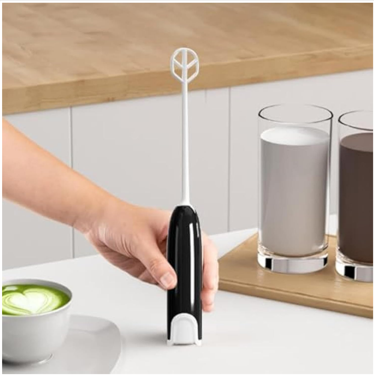
Image: A hand holding the Handheld Electric Beverage Mixer upright on a kitchen counter, with two glasses of beverages in the background, illustrating its compact size and ease of handling.