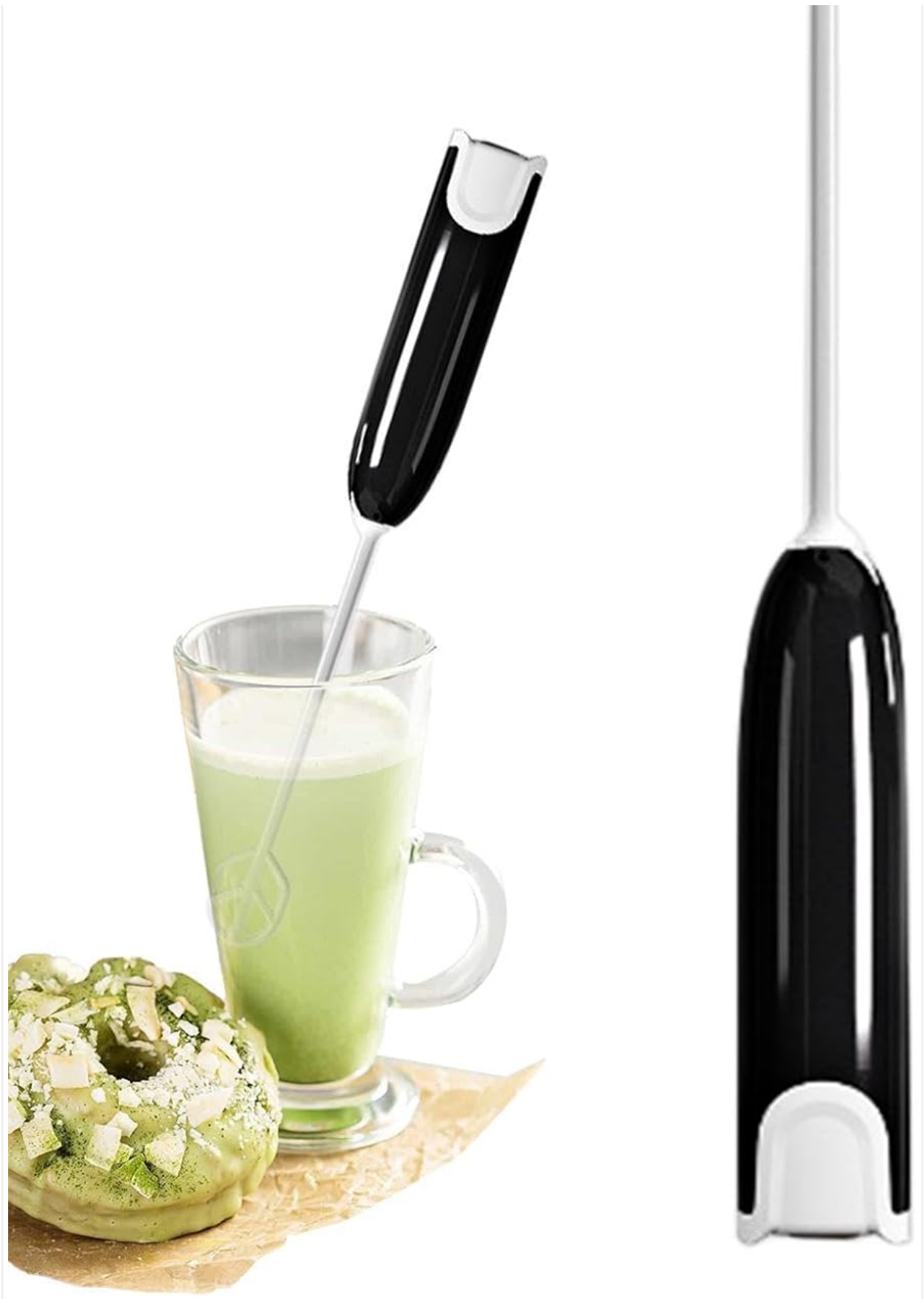
Image: The Handheld Electric Beverage Mixer shown in use, frothing a green beverage in a clear glass. A pastry is visible in the foreground.