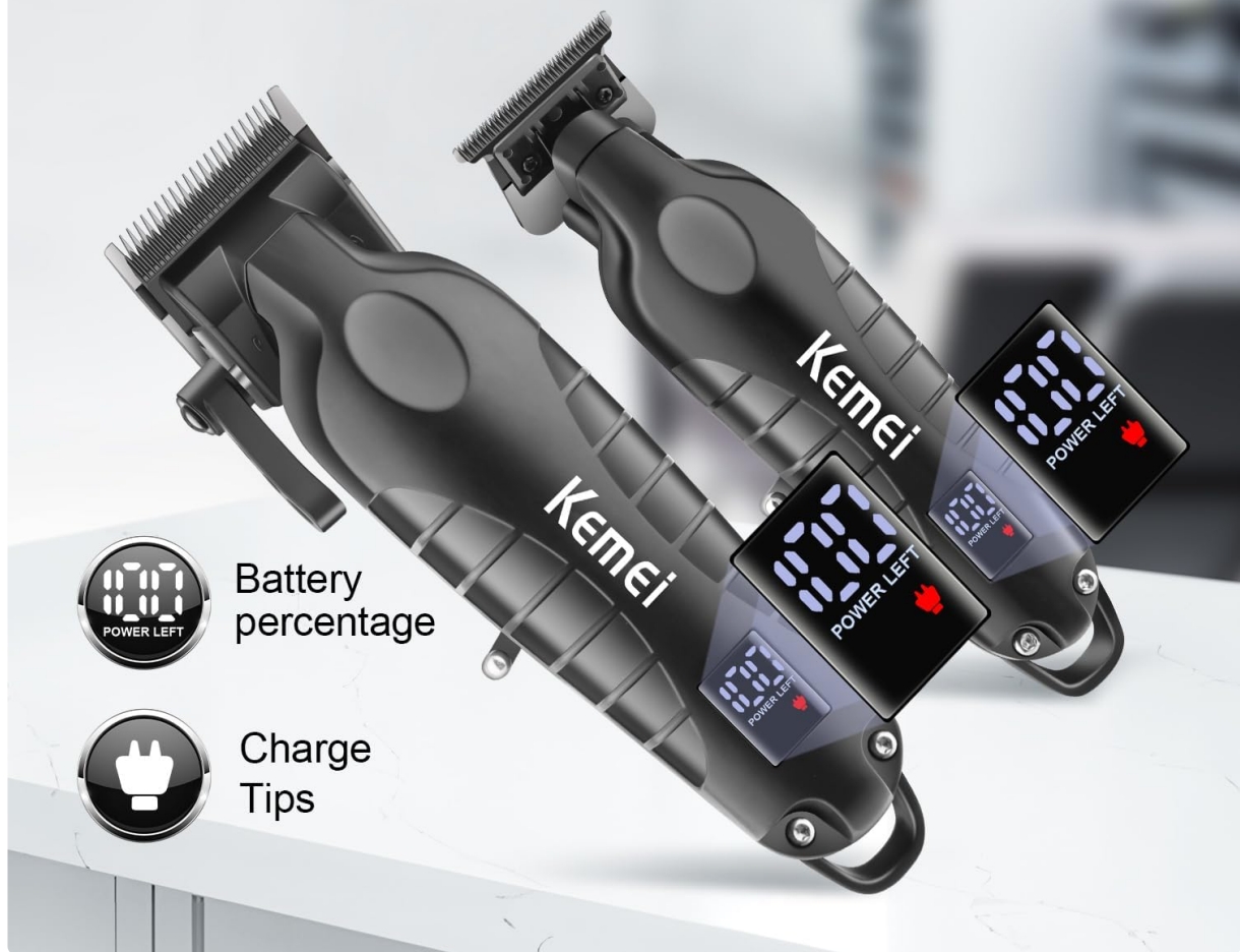
Image 4.2: The digital display on the KEMEI clipper and trimmer, indicating the remaining battery percentage for convenient power monitoring.

You don't have to worry about the sudden loss of power during use