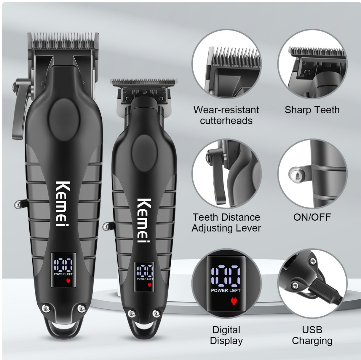
Image 6.1: A detailed breakdown of the KEMEI clipper and trimmer, highlighting features such as wear-resistant cutterheads, sharp teeth, teeth distance adjusting lever, ON/OFF switch, digital display, and USB charging port.