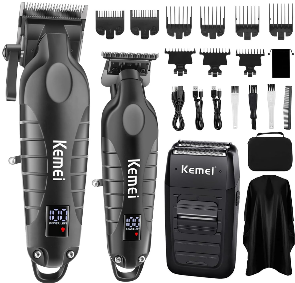
Image 3.1: Overview of the KEMEI grooming kit, showing the clipper, trimmer, shaver, and all included accessories such as guide combs, charging cables, cleaning brushes, comb, cape, and storage bag.