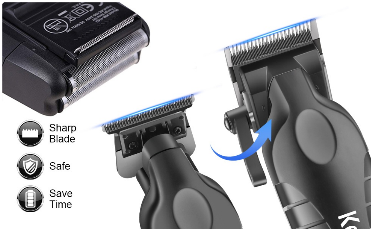
Image 7.1: A close-up view of the KEMEI clipper and trimmer blades, illustrating their sharp, safe, and efficient design for effective grooming.