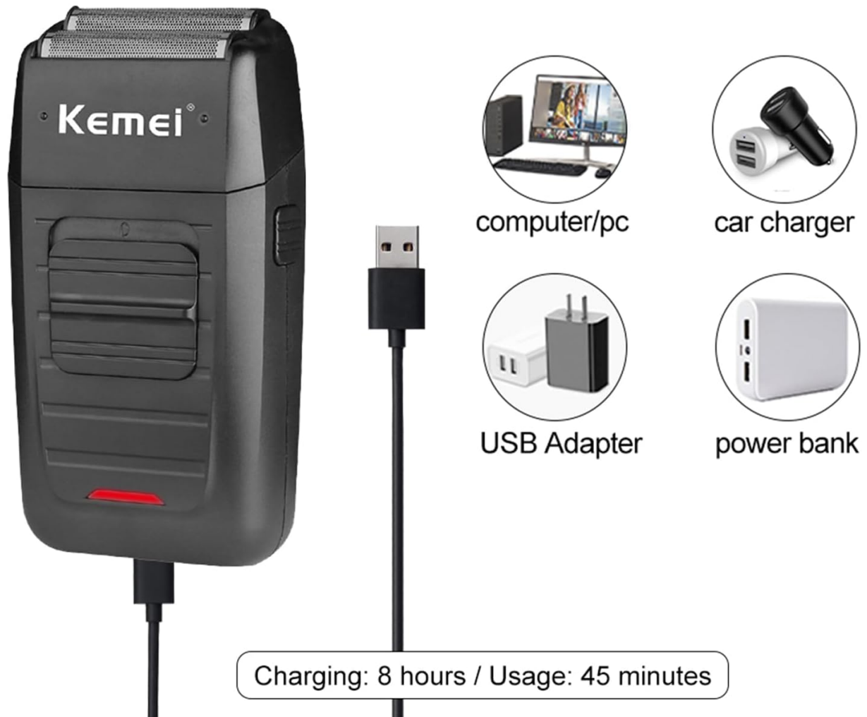
Image 5.2: The KEMEI electric shaver connected to its USB charging cable, demonstrating compatibility with various USB power sources like computers, car chargers, USB adapters, and power banks.