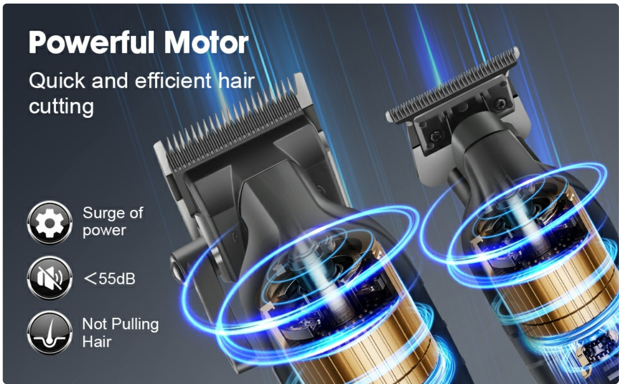
Image 4.3: Visual representation of the powerful motor in KEMEI clippers, emphasizing its efficiency, quiet operation (less than 55dB), and design to prevent hair pulling.