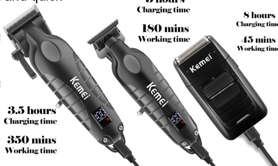
Image 8.1: An illustration of the KEMEI grooming set highlighting USB charging convenience and specifying the individual charging and working times for the clipper, trimmer, and shaver.