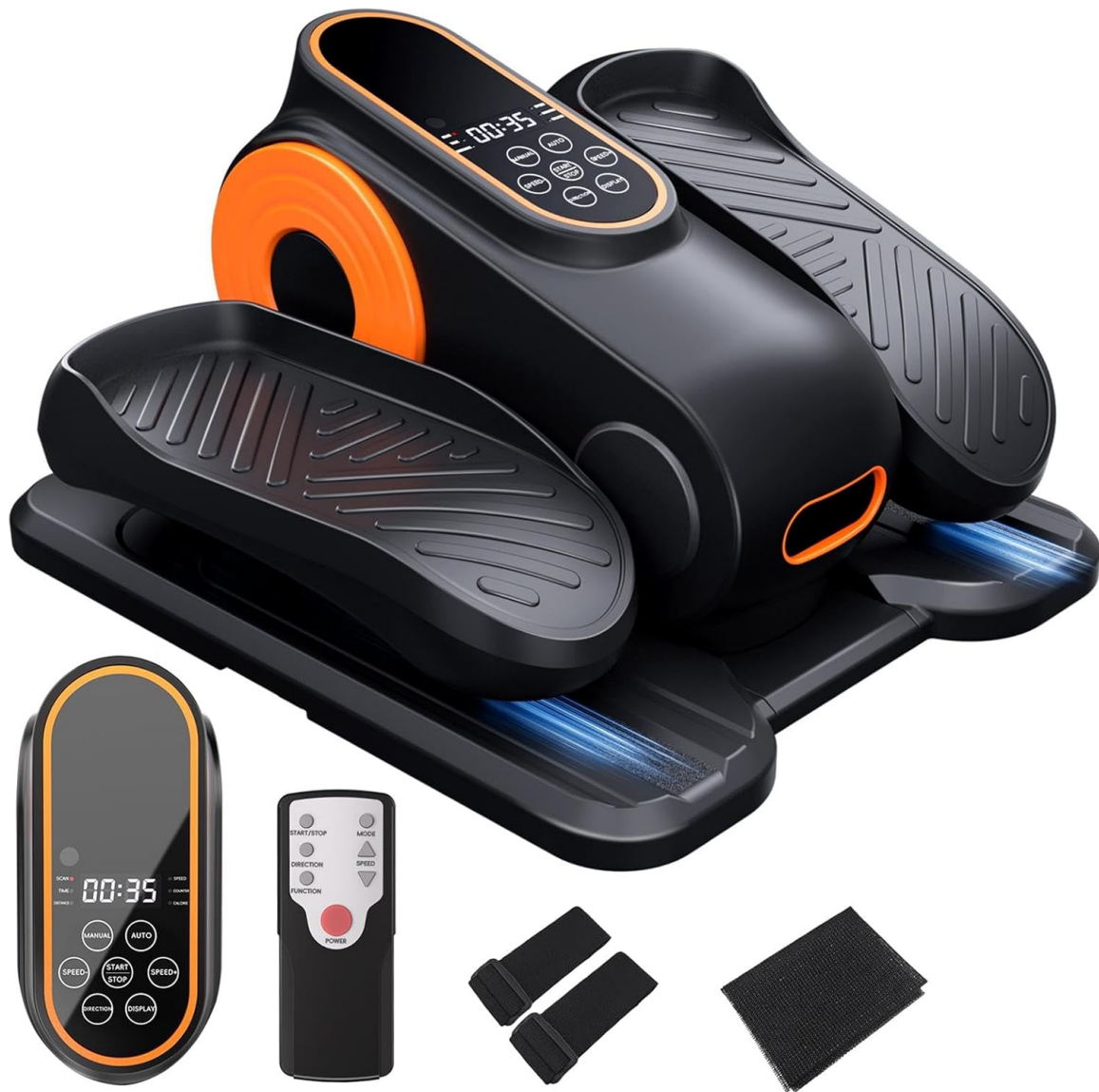
Image: All components included in the Morelax Mini Electric Under-Desk Elliptical package.