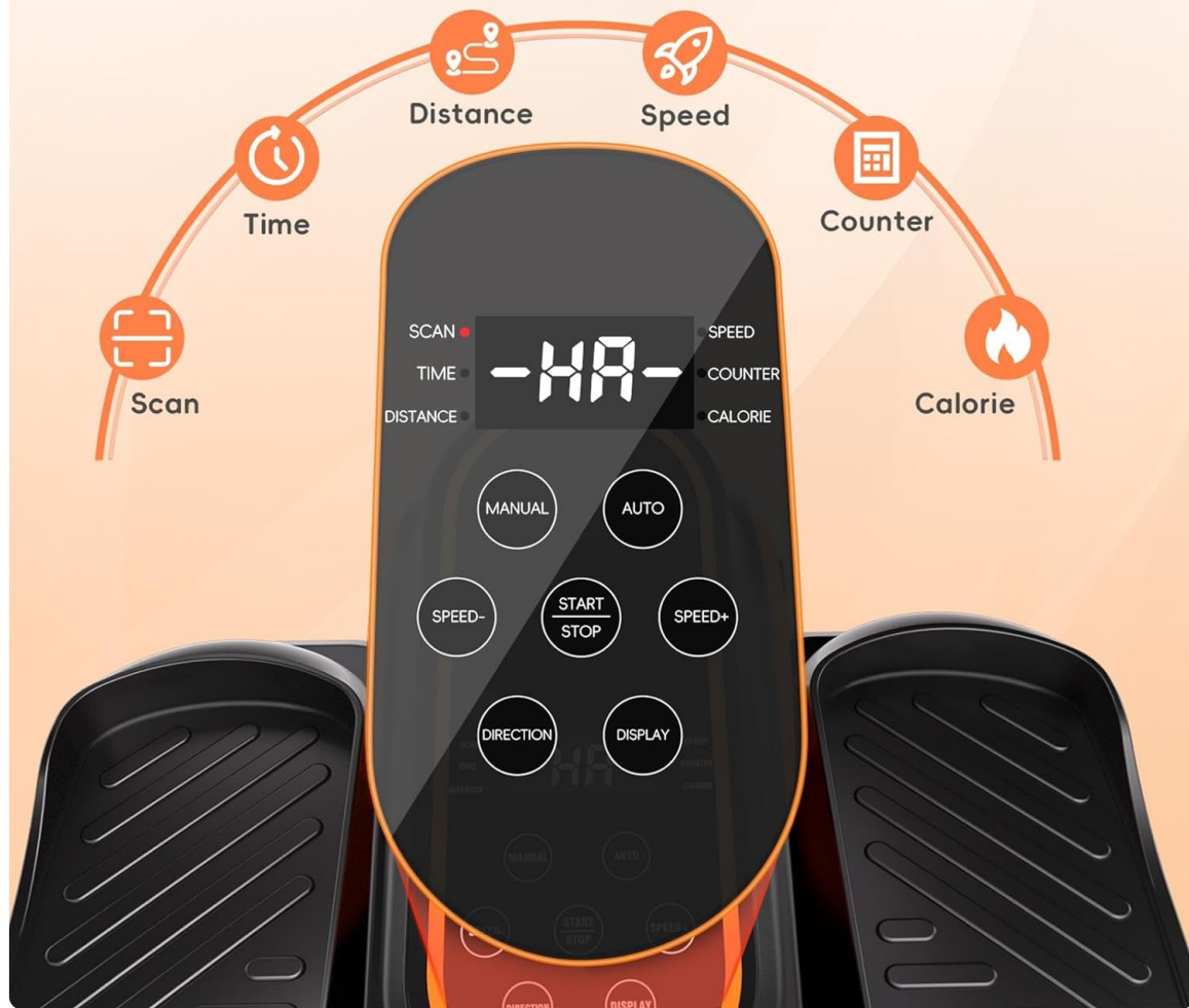
Image: The remote control, allowing users to adjust settings without bending down.