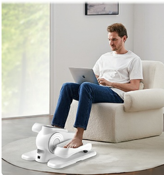
Image: The elliptical placed on an anti-slip mat for stability during use.