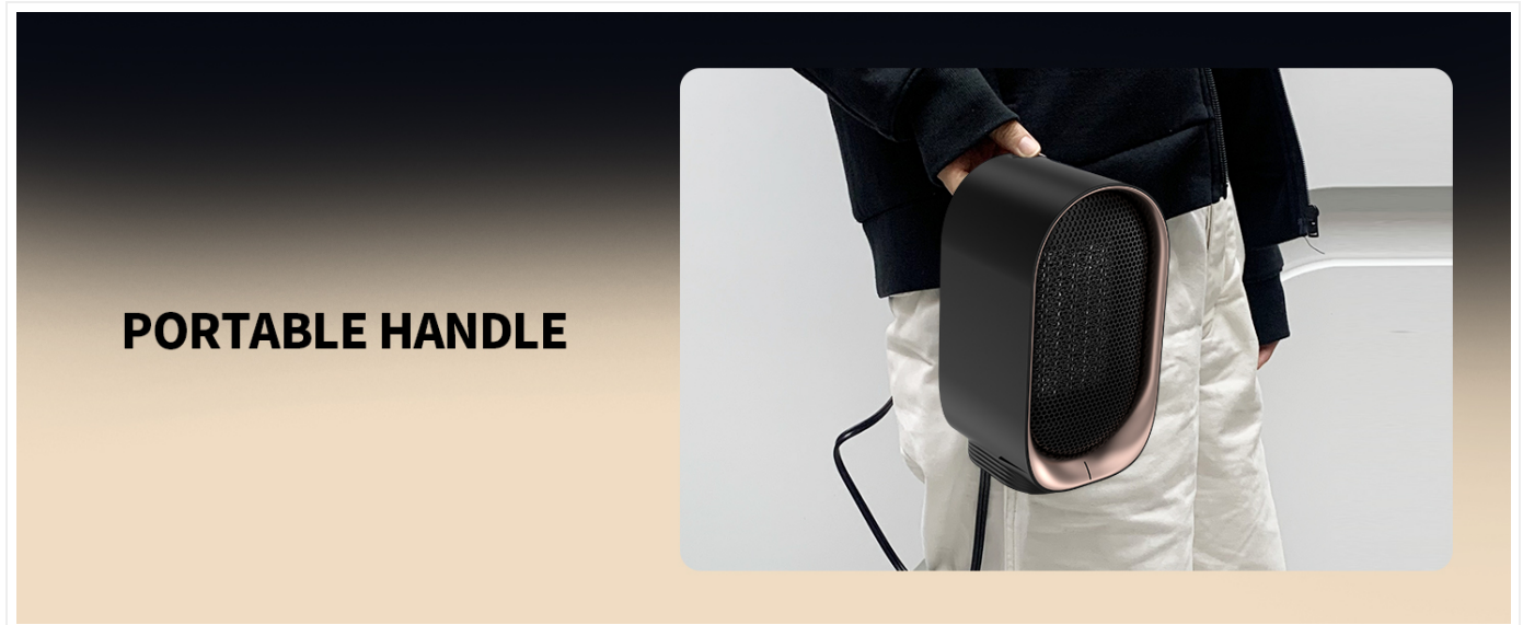
Figure 2: The compact design of the heater, highlighting its portable handle for easy transport.