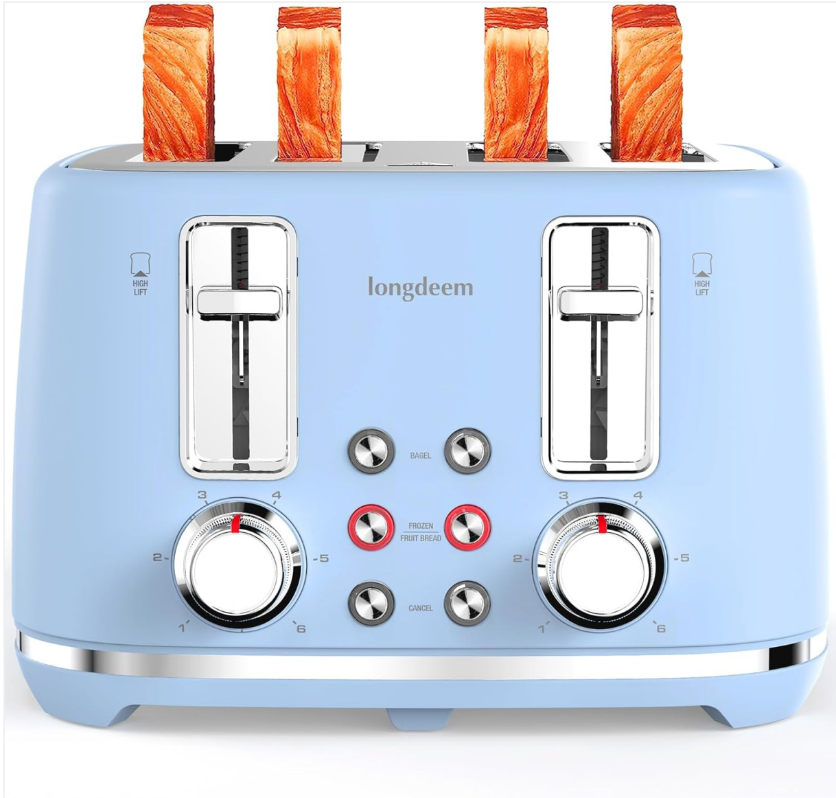
Image: Front view of the LONGDEEM 4 Slice Countertop Toaster, light blue in color, with four slices of bread being toasted in its wide slots. The control panel with buttons and browning dials is visible.

The LONGDEEM 4 Slice Countertop Toaster is designed for efficient and versatile toasting. It features extra-wide slots to accommodate various bread types and multiple browning settings for customized results.