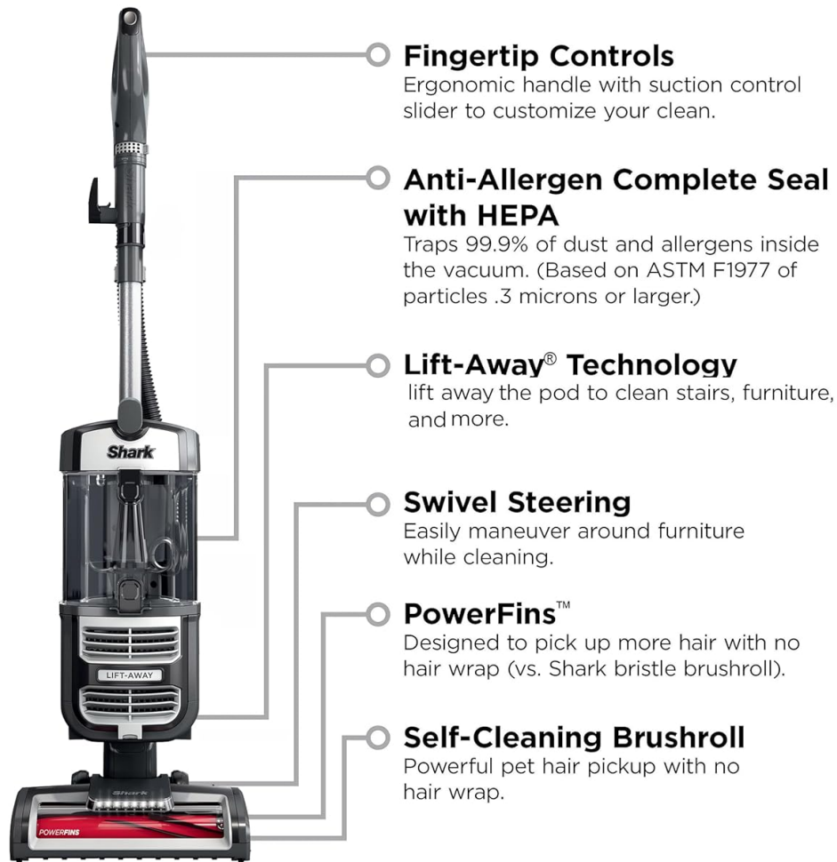
Anatomy of the Shark Lift-Away Vacuum, detailing its ergonomic controls, filtration, and cleaning technologies.