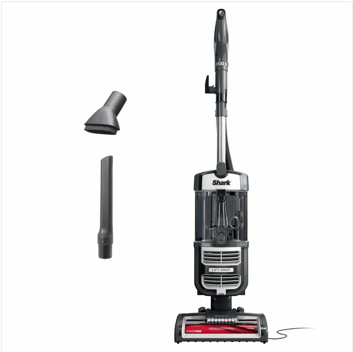
The Shark UV730 Navigator Lift-Away Upright Vacuum, a versatile cleaning solution.