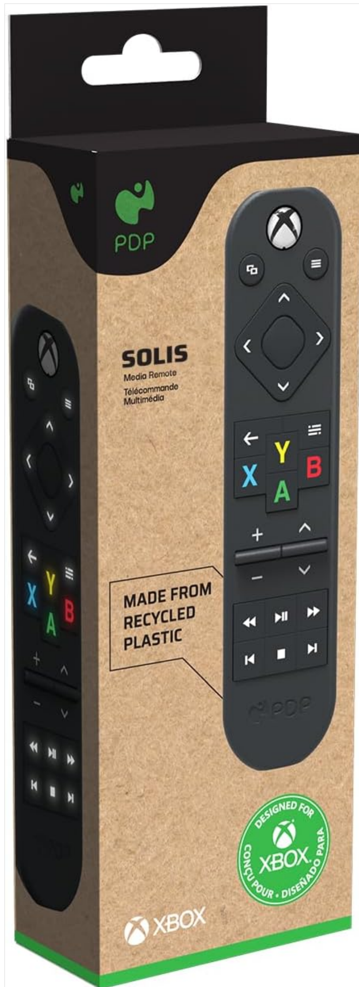
Image: The remote displaying its motion-activated backlit buttons.