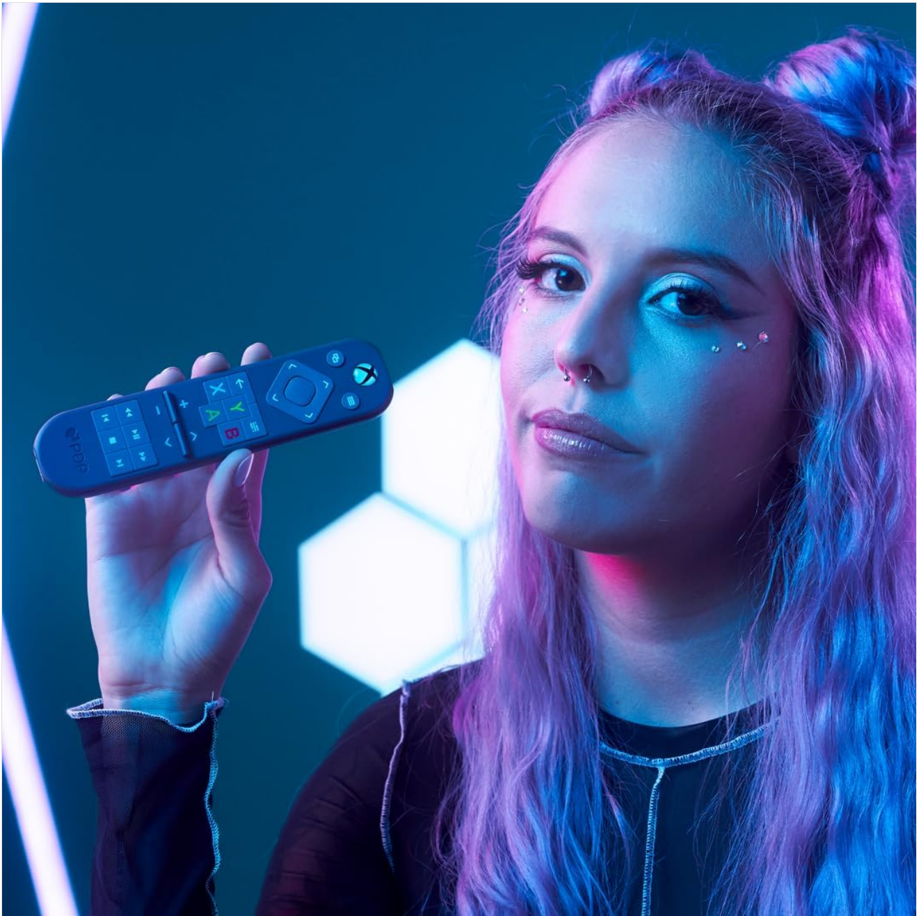
Image: Close-up of the A, B, X, Y action buttons.