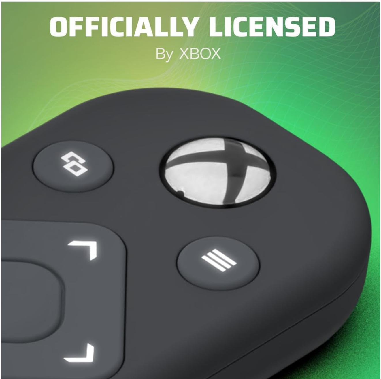
Image: Close-up of the media playback controls.