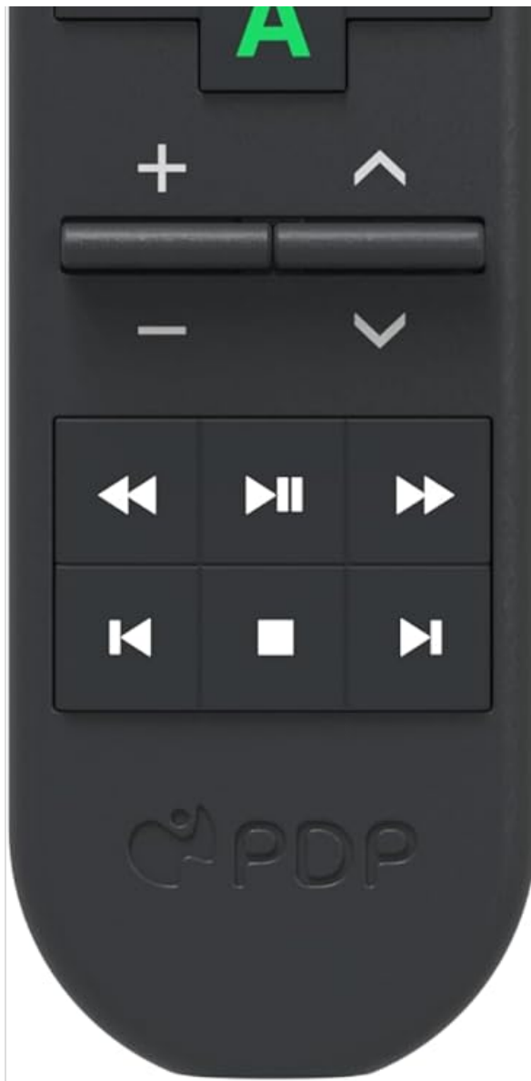
Image: Front view of the PDP Solis Xbox Gaming Media Remote Control.