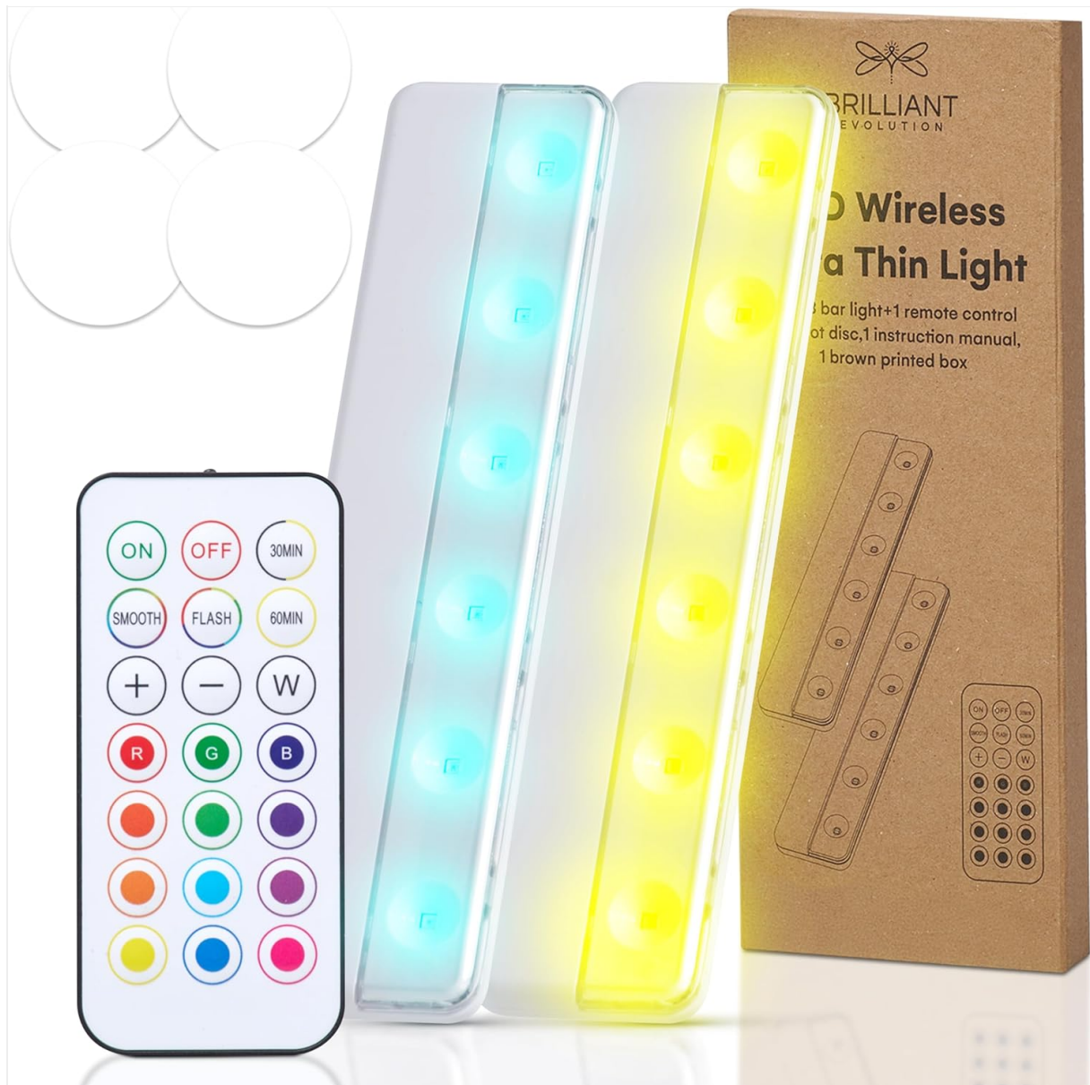
Figure 4.1: Complete product package showing light bars, remote, and mounting discs.

The Brilliant Evolution LED Wireless Ultra Thin Light system consists of the light bar units and a dedicated remote control. Each light bar is designed to be ultra-thin for discreet placement and houses multiple LEDs capable of producing white and RGB colors. The remote control allows for comprehensive management of light functions.