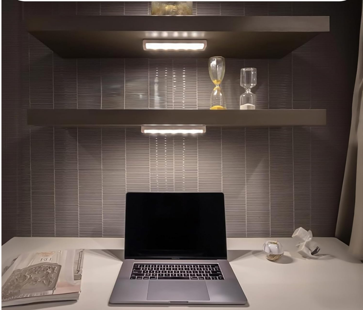
Figure 6.3: Demonstrating the smart auto-off timer function.