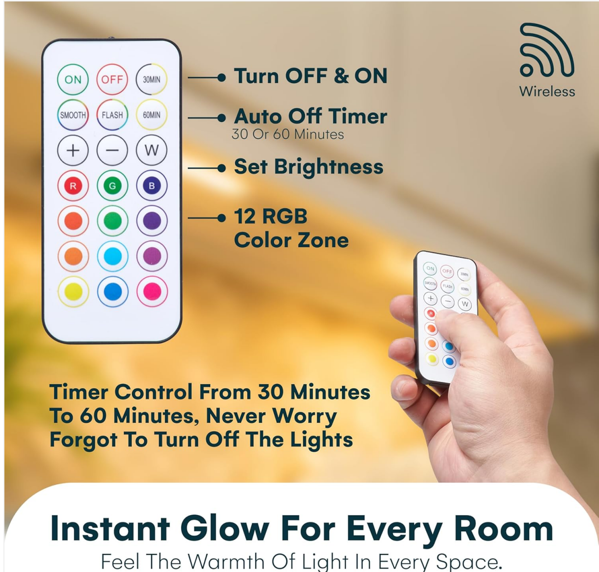
Figure 6.1: Remote control layout and functions.

The Brilliant Evolution LED Wireless Ultra Thin Light is operated using the provided remote control.