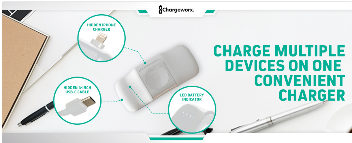
Image 4.1: Diagram illustrating the key features of the CHARGEWORX CX6898, including the collapsible Lightning connector, the integrated USB-C cable, and the LED battery indicator lights.

Familiarize yourself with the components of your CHARGEWORX CX6898 power bank: