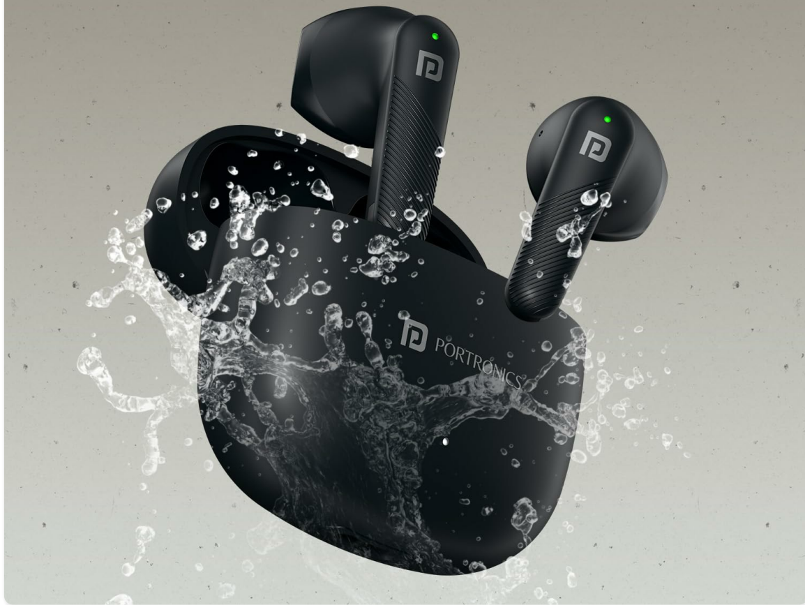
highlighting the IPX5 water resistance feature.