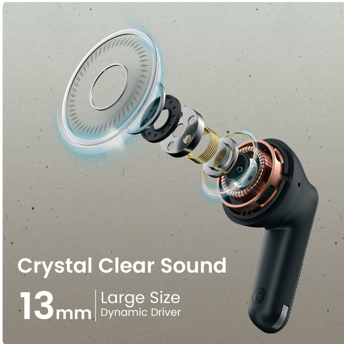
Image: Detailed view of the 13mm dynamic driver for crystal clear sound.