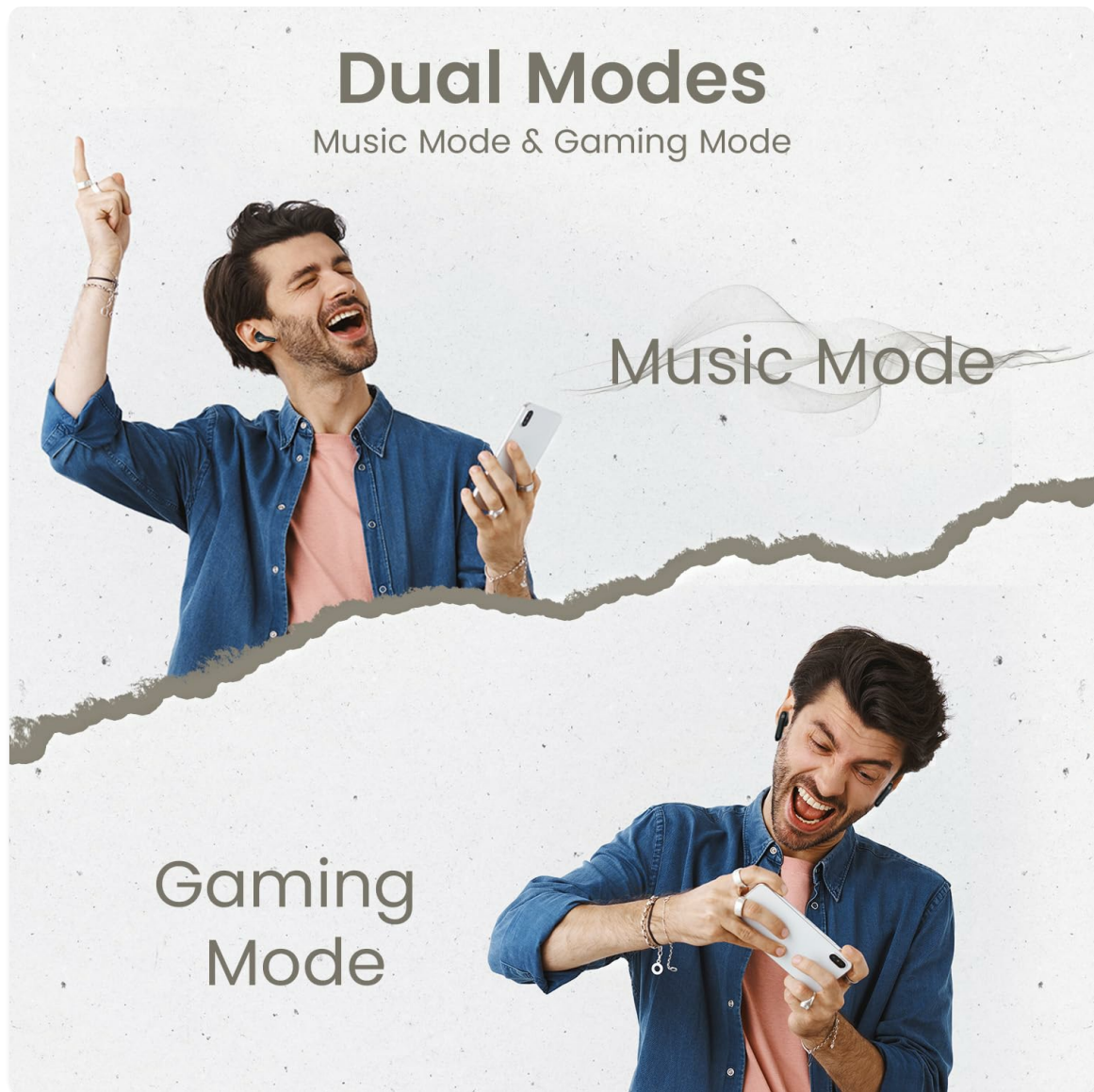
Image: Depiction of switching between Music Mode and Gaming Mode.

Switch between modes by long pressing the Right earbud (approximately 2 seconds).