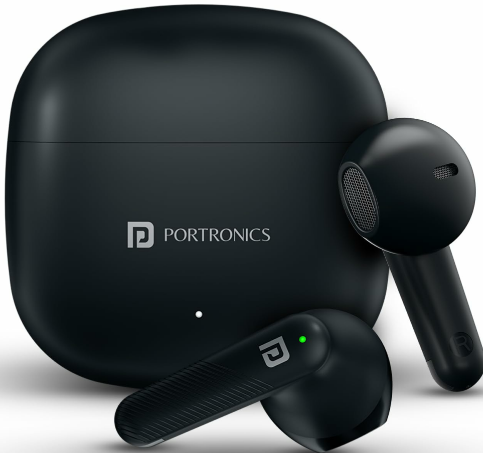
Image: Portronics Harmonics Twins S18 TWS Earbuds and their charging case.