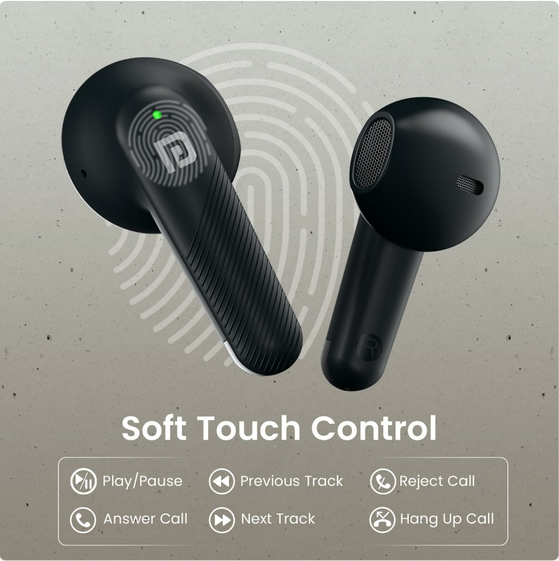
Image: Visual guide to the soft touch controls on the earbuds.

The earbuds support dual modes to optimize your audio experience: