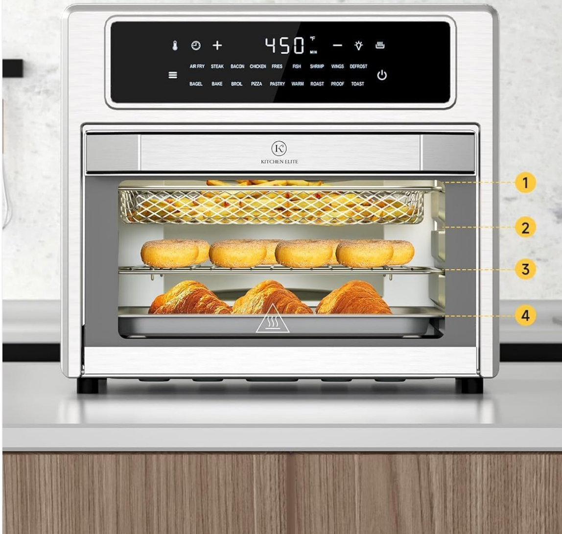
Figure 3.1: Illustration of multi-layer cooking with different accessories in the oven.

Multiple layers can be cooked at the same time, greatly reducing cooking time