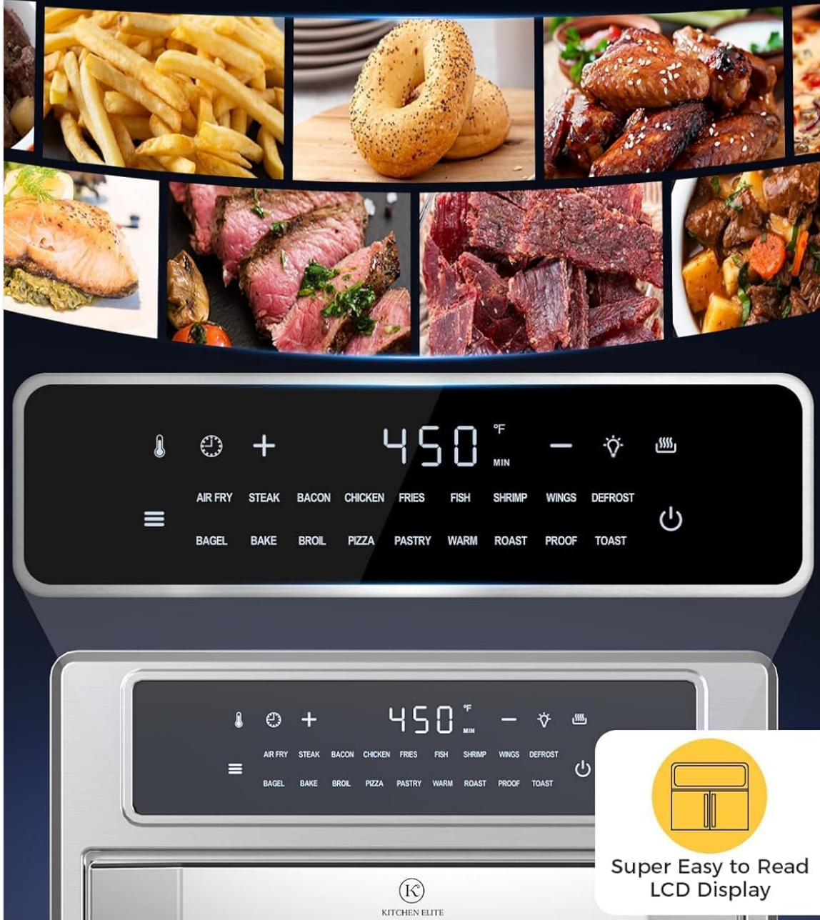
Figure 4.1: Digital control panel displaying various preset cooking modes.

Fully combines the functions of an air fryer & oven