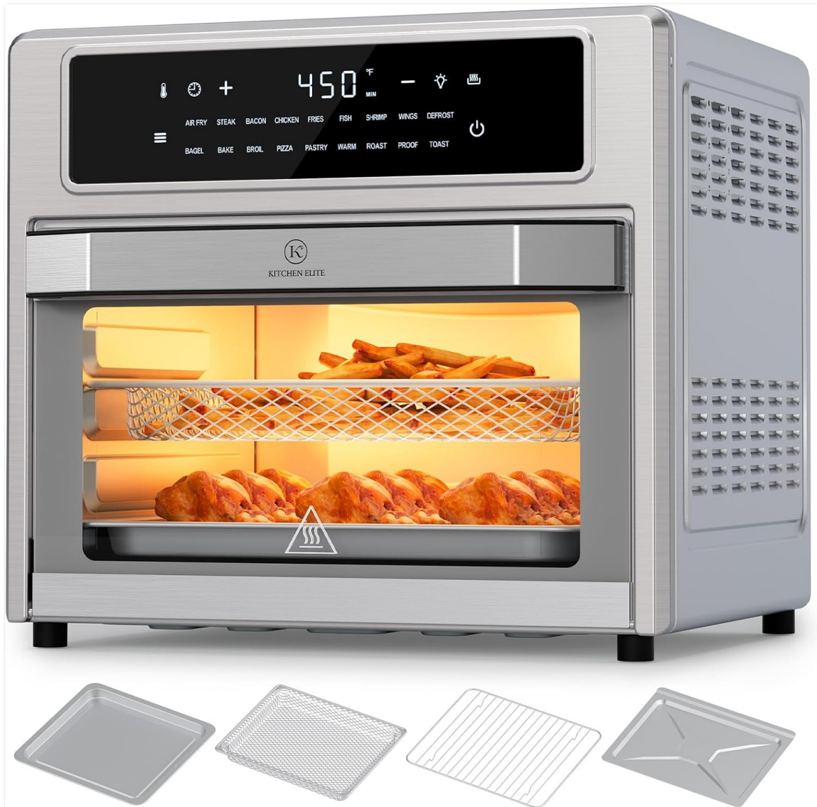
Figure 2.1: Front view of the Kitchen Elite Air Fryer Toaster Oven Combo with included accessories (drip tray, mesh basket, wire rack, baking tray).