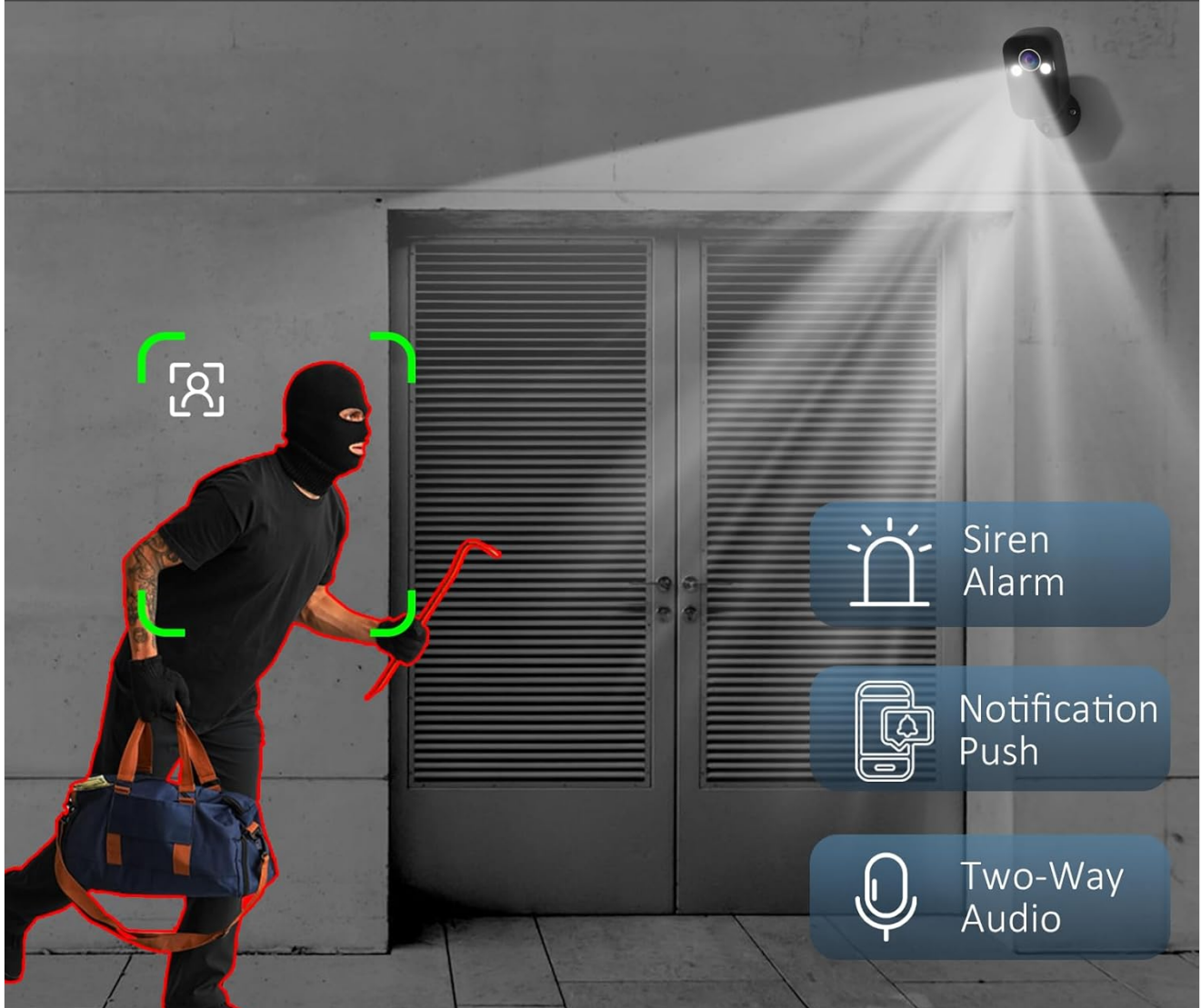
Figure 3.4: AI Motion Detection Capabilities.