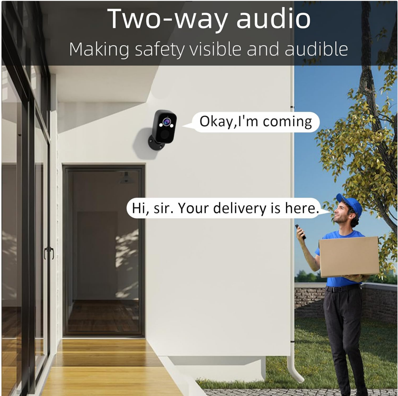
Figure 3.6: Two-Way Audio Communication.

Communicate directly with visitors or deter intruders using the built-in microphone and speaker.