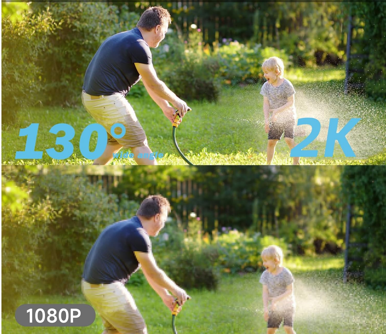
Figure 3.2: 2K Resolution and 130-degree Wide Angle View.