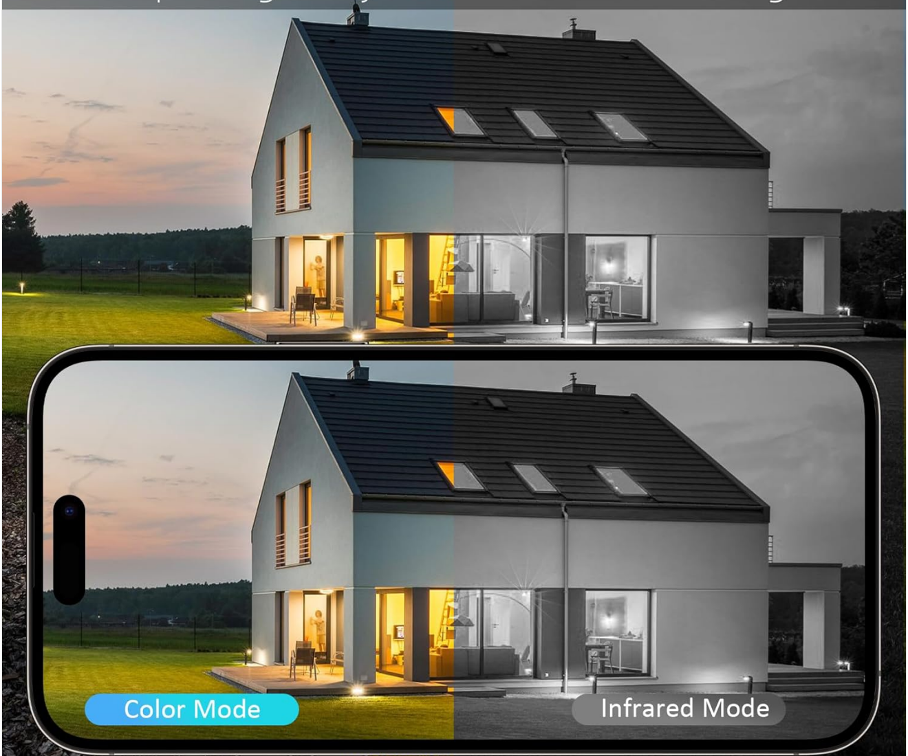
Figure 3.3: Full Color Night Vision vs. Infrared Mode.

Capturing every vivid moment of the night