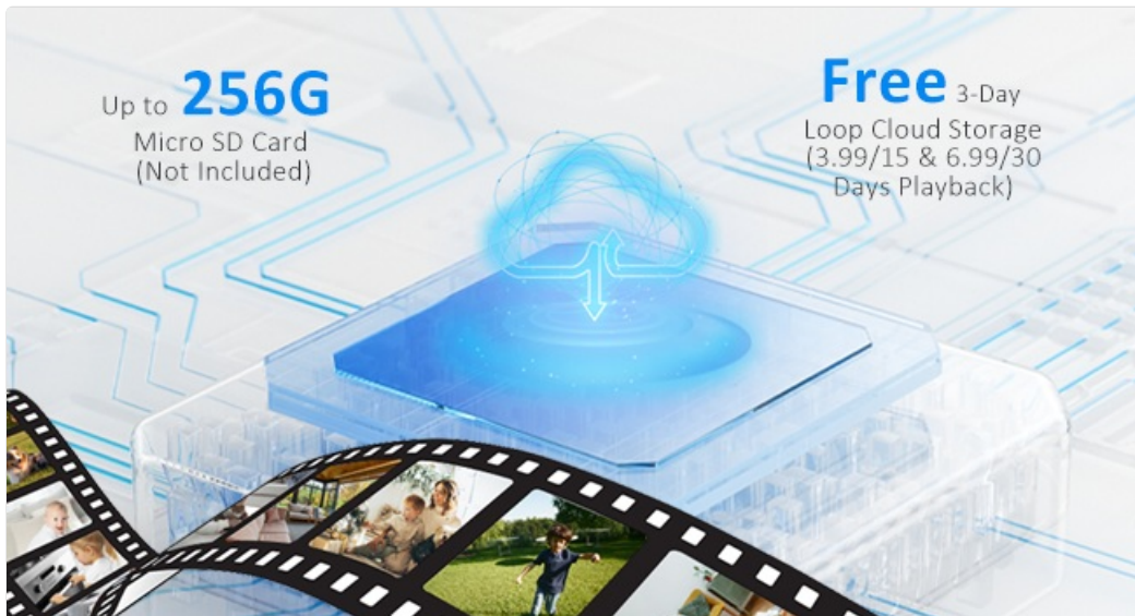
Figure 3.8: Cloud and Micro SD Storage Options.

Record footage to a Micro SD card (up to 256GB, not included) or utilize cloud storage services for secure data backup and access.