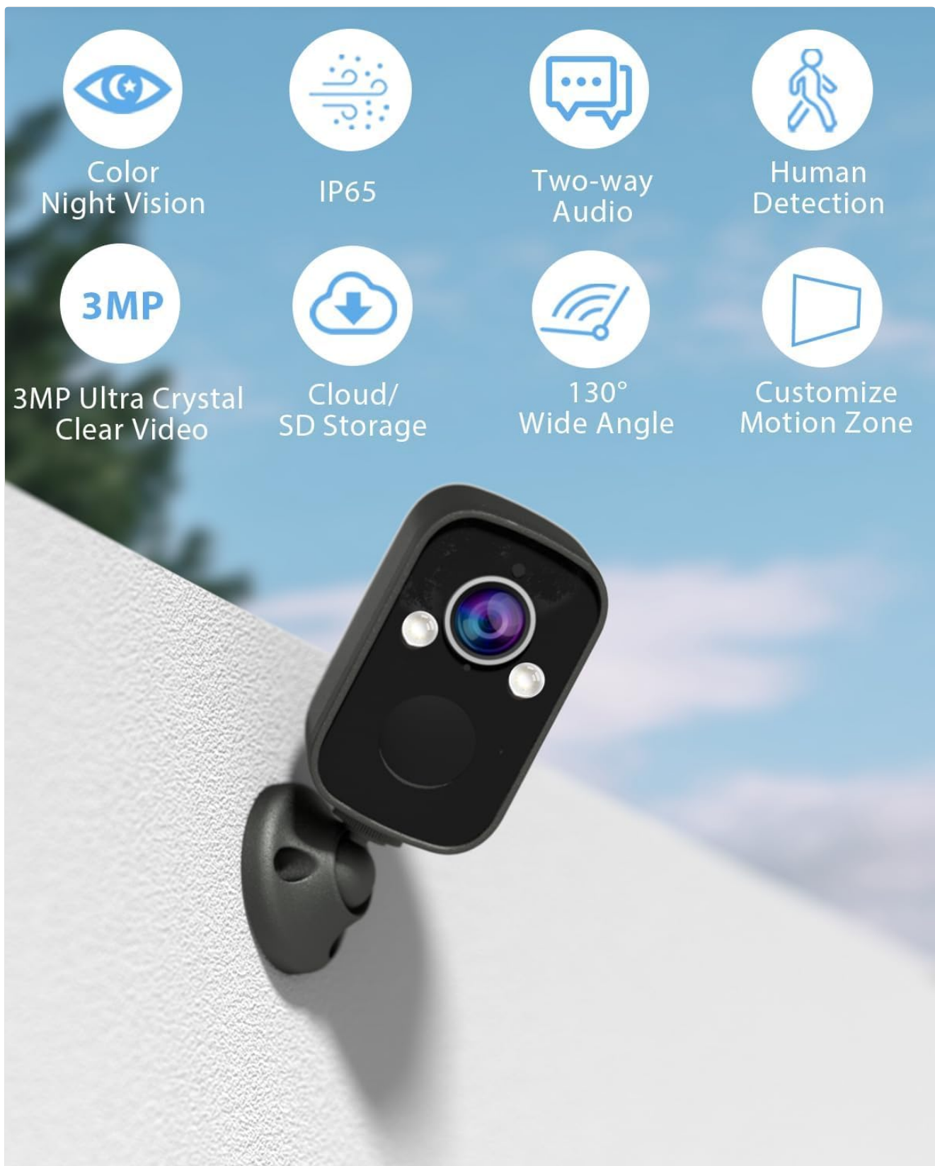
Figure 3.1: Overview of Raycom BW6 Camera Features.