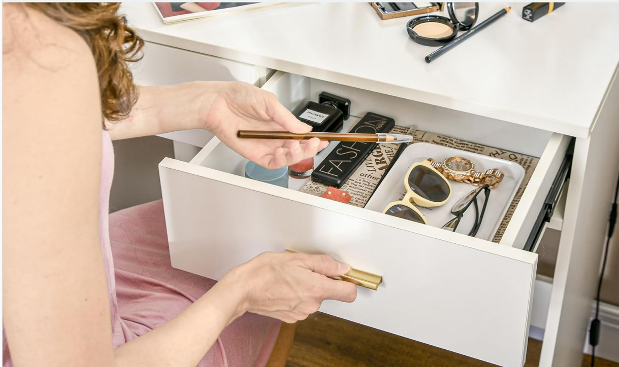
Image 5.3: An open drawer demonstrating the spacious storage capacity.