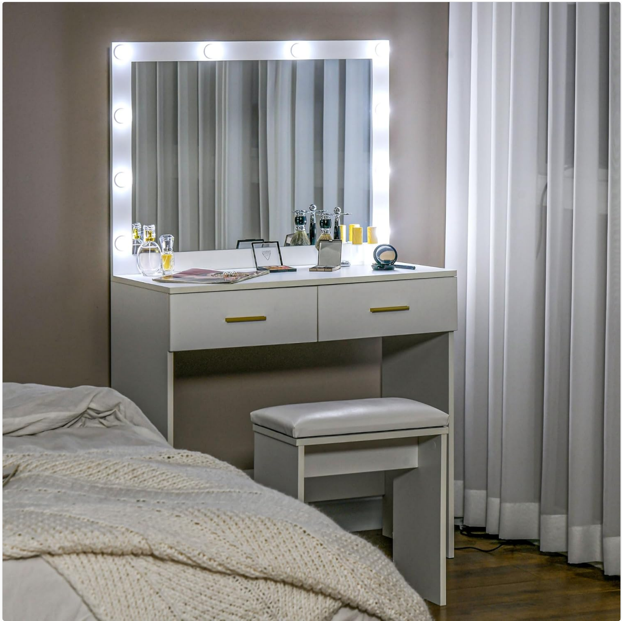
Image 5.1: The vanity desk with its LED lights providing illumination.