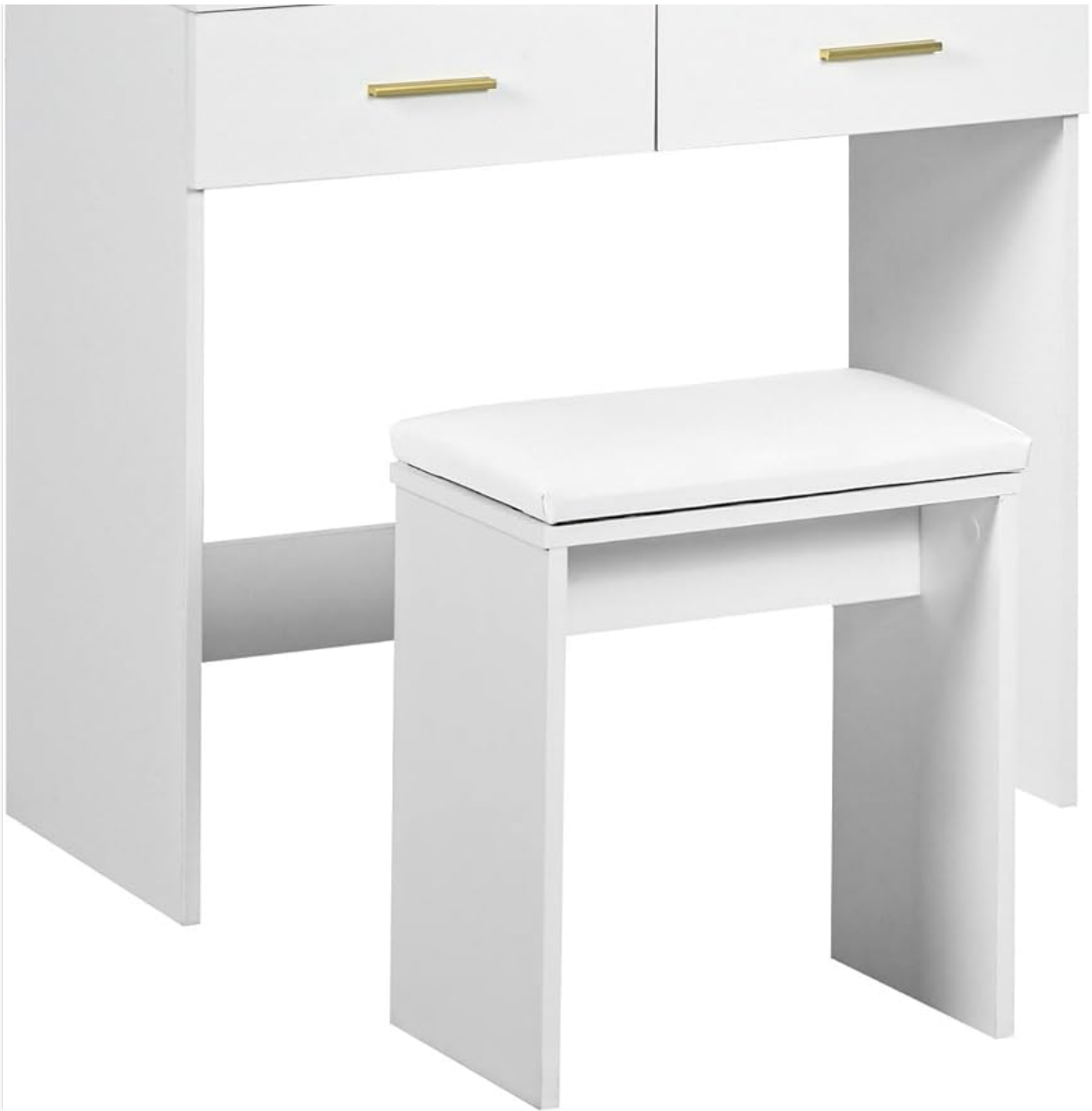
Image 1.1: The HOMCOM Vanity Desk with Mirror and Lights, featuring a white finish, two drawers, and a matching stool.