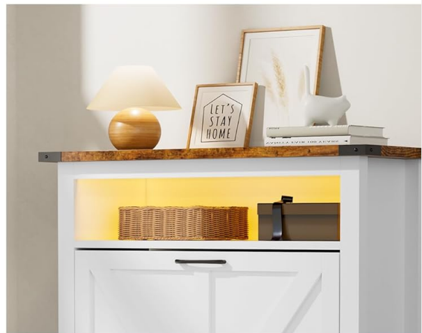
Large Storage Space

Image: Detailed views of the MU Shoe Cabinet, highlighting its black metal handles, the rustic farmhouse-style top, anti-slip foot pads for floor protection, and the illuminated open storage area.