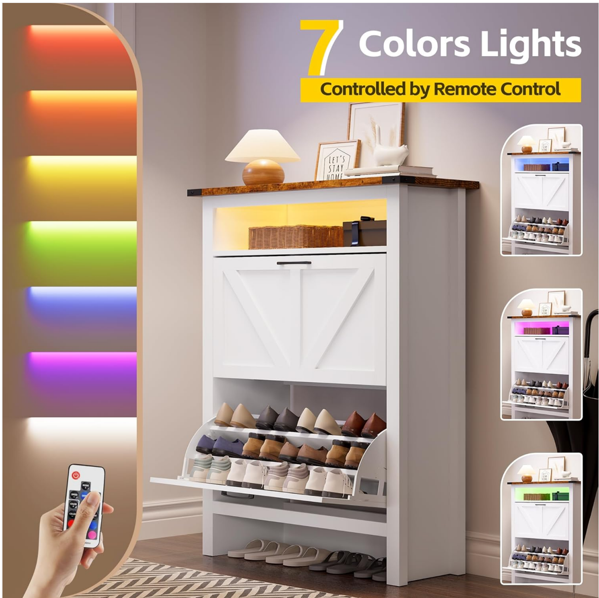
Image: The MU Shoe Cabinet showcasing its LED light feature, with examples of different colors (red, green, blue, purple, yellow, white) illuminating the open top compartment.