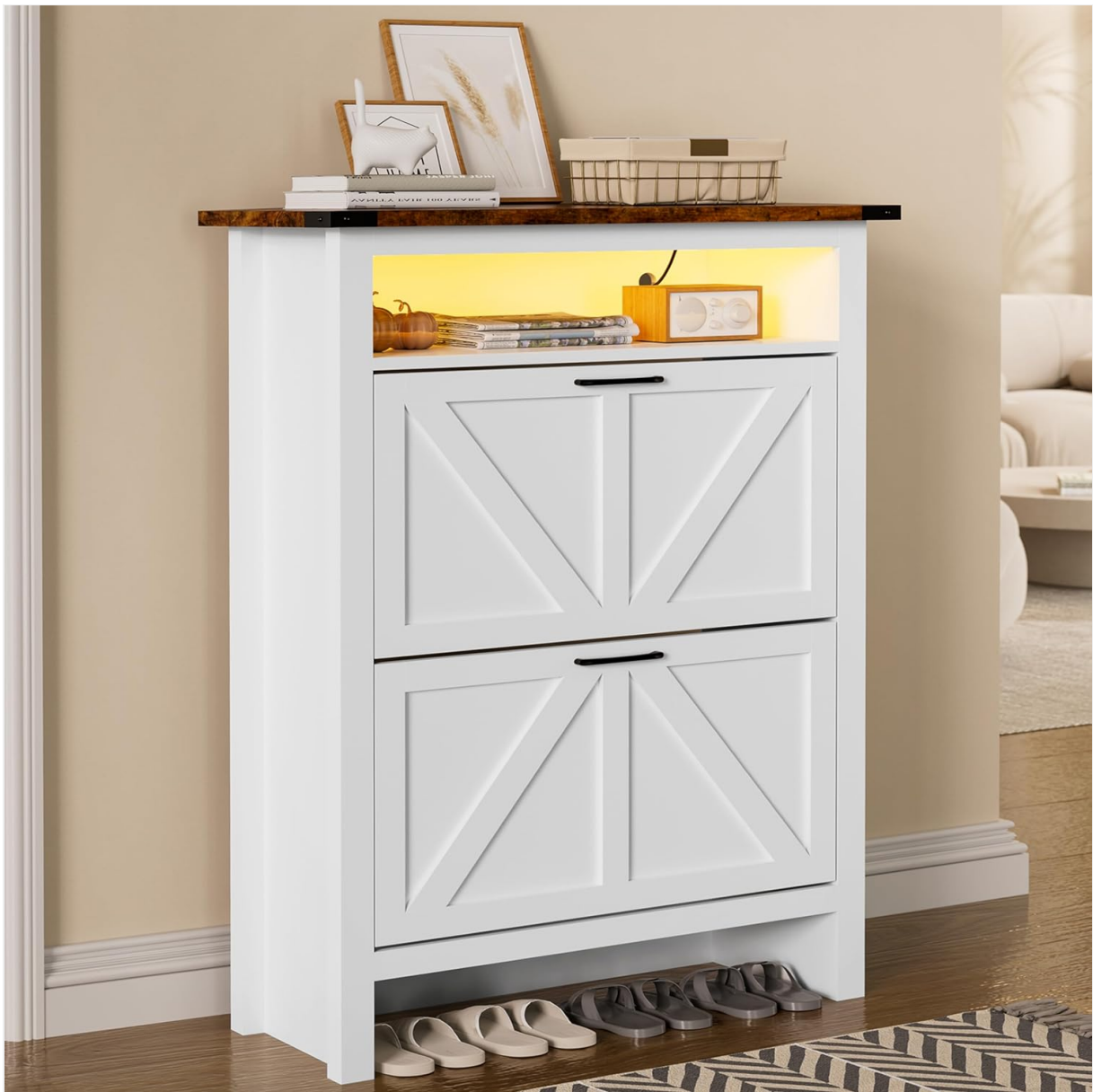
Image: The MU Shoe Cabinet, white with a brown top, featuring two flip-down drawers and an open top compartment with illuminated LED lighting, positioned in an entryway.