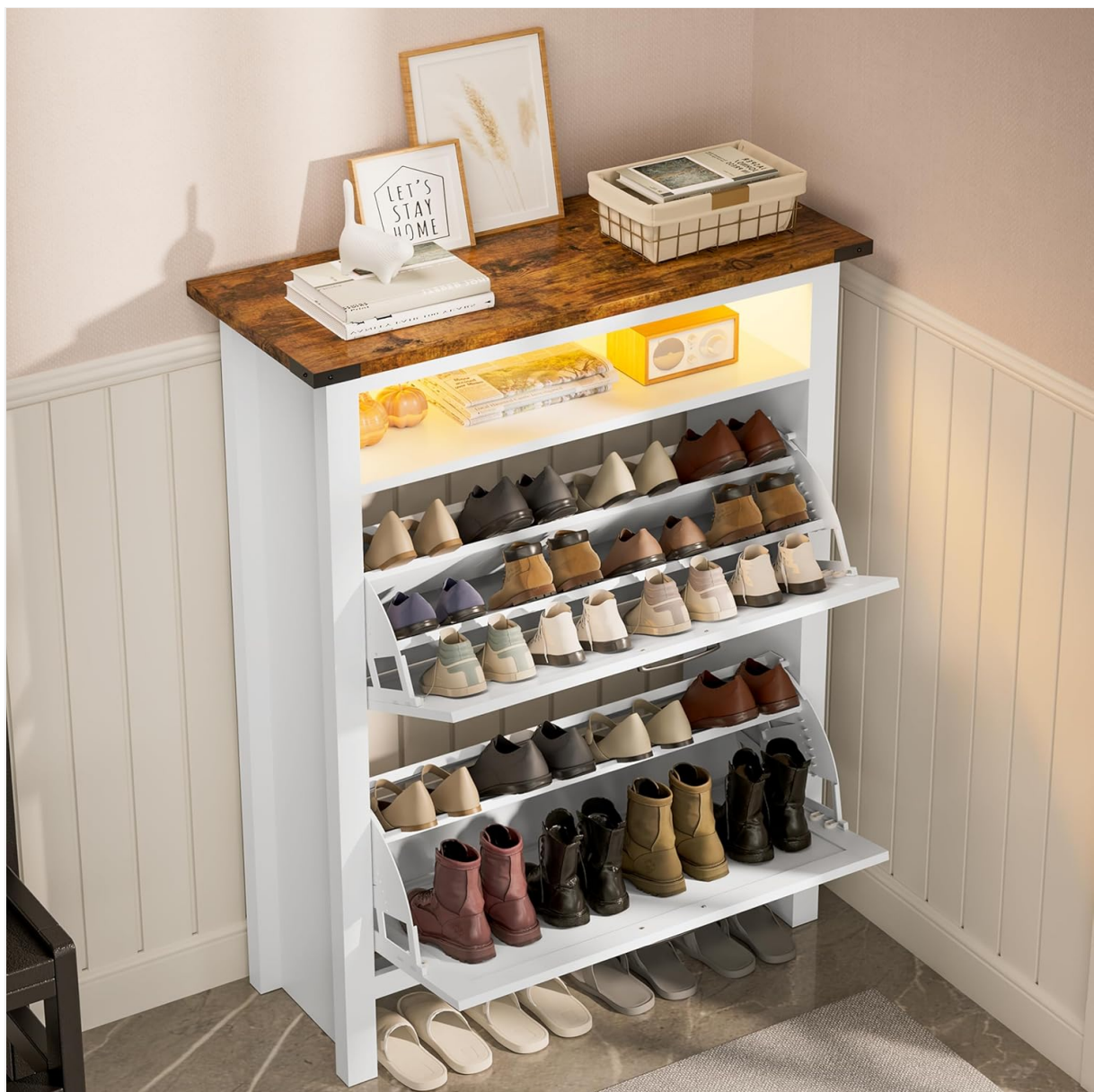
Image: The MU Shoe Cabinet with both flip drawers open, showcasing various types of shoes neatly stored within its compartments.