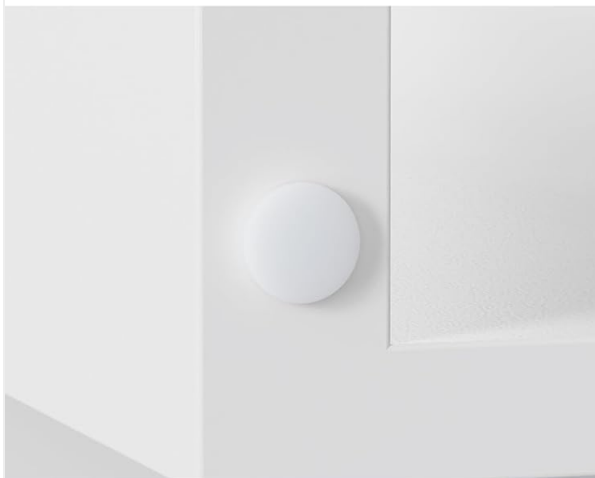
Anti-slip Foot Pads