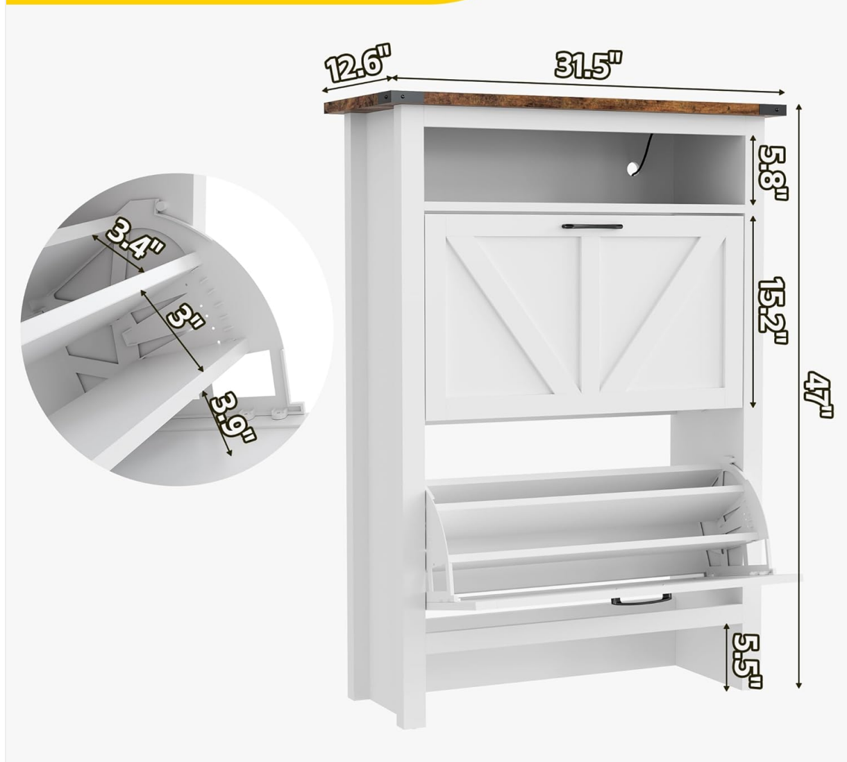
Image: A detailed diagram illustrating the dimensions of the MU Shoe Cabinet, including its height, width, and depth, as well as internal measurements for shoe storage.