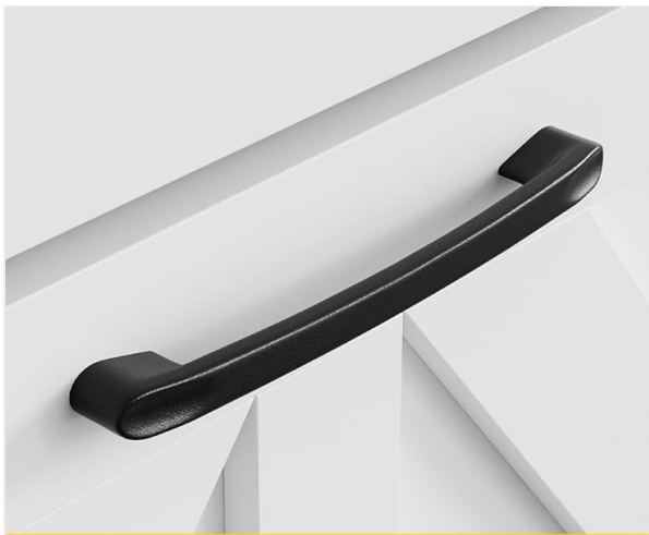
Black Metal Handles