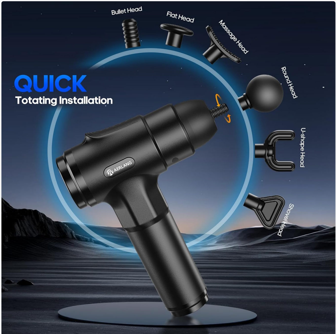
Image 2: Illustration of the AERLANG Massage Gun and its six interchangeable heads, demonstrating the quick rotating installation method.