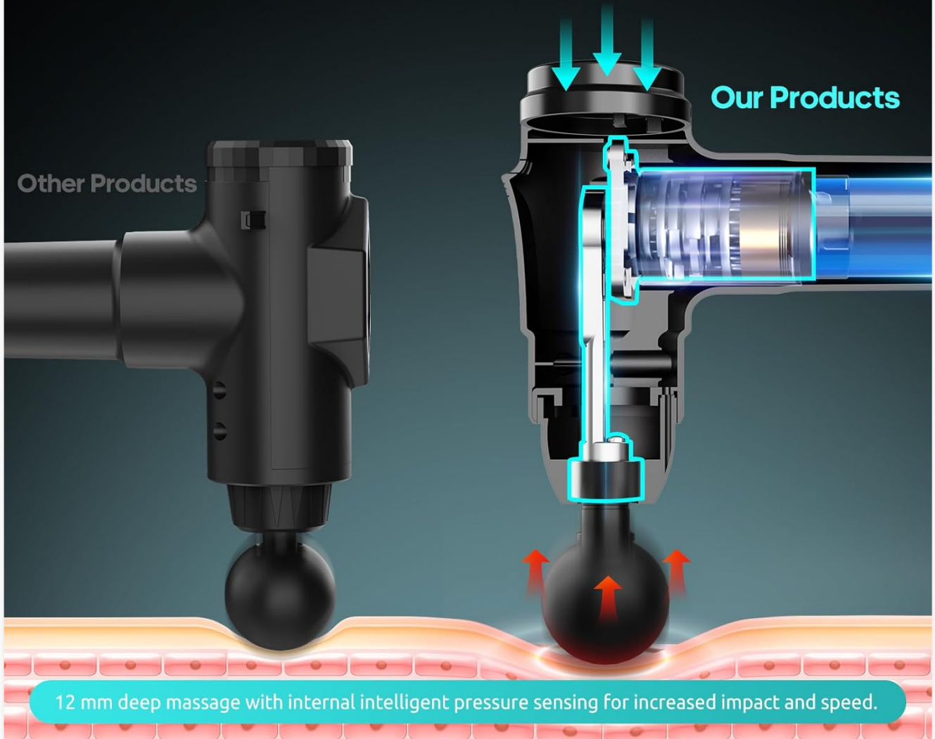
Image 5: A diagram illustrating the 12mm deep impact capability of the AERLANG Massage Gun, enhanced by its built-in intelligent pressure sensing system.

Built-in Intelligent Pressure Sensing System