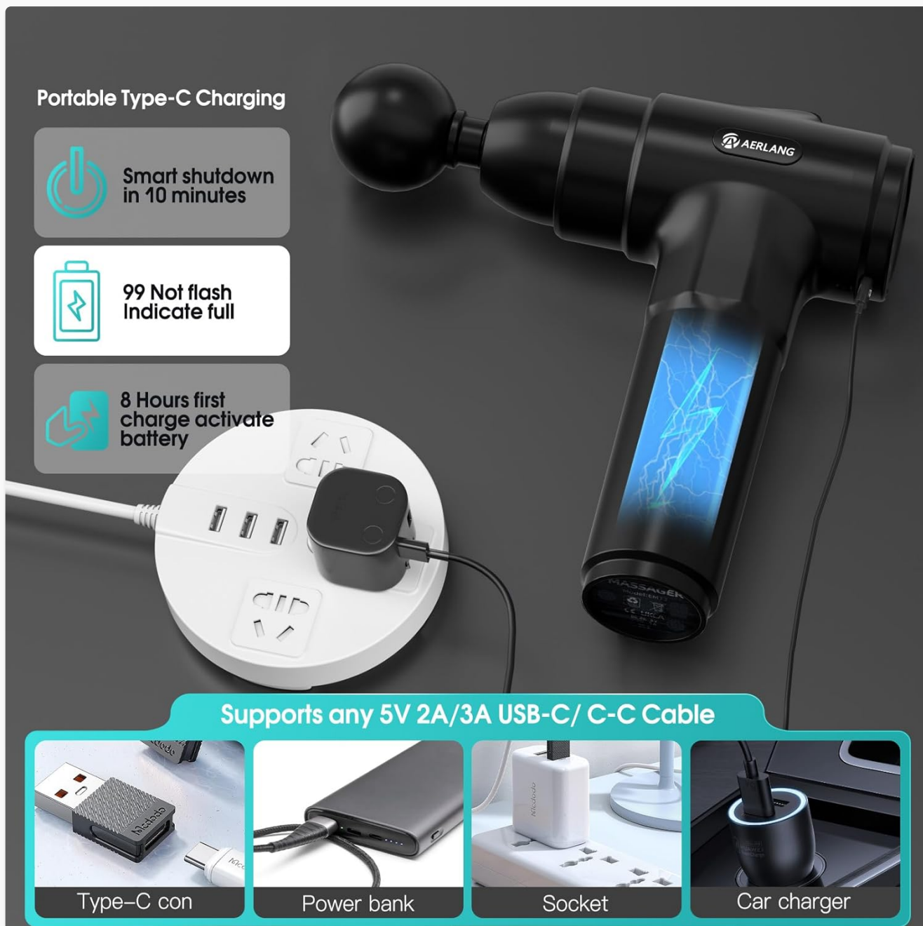
Image 3: The AERLANG Massage Gun connected for charging via its portable Type-C port, showing compatibility with various 5V 2A/3A USB-C power sources.