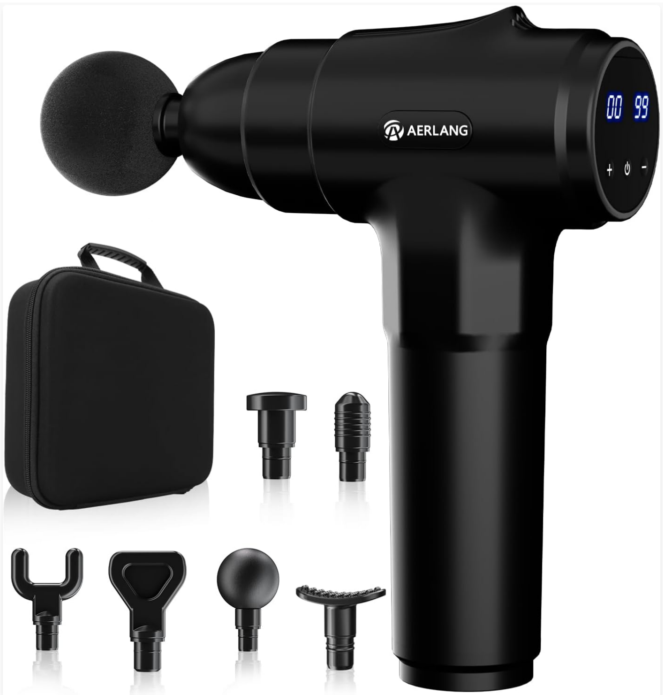
Image 1: The AERLANG EM13 Percussion Massage Gun, its six interchangeable massage heads, and the included carrying case.