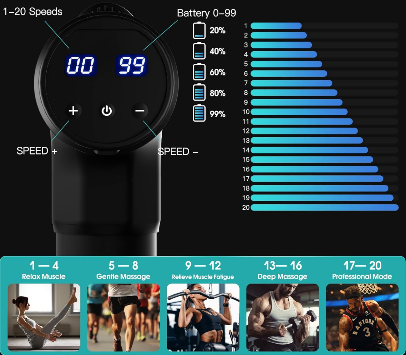
Image 4: The LED touch screen interface of the AERLANG Massage Gun, illustrating the 20 speed levels and battery charge indicator.