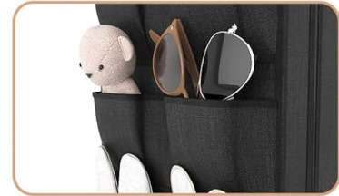
Exact 6 Side Pockets