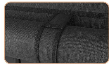
Hook and Loop Fastener