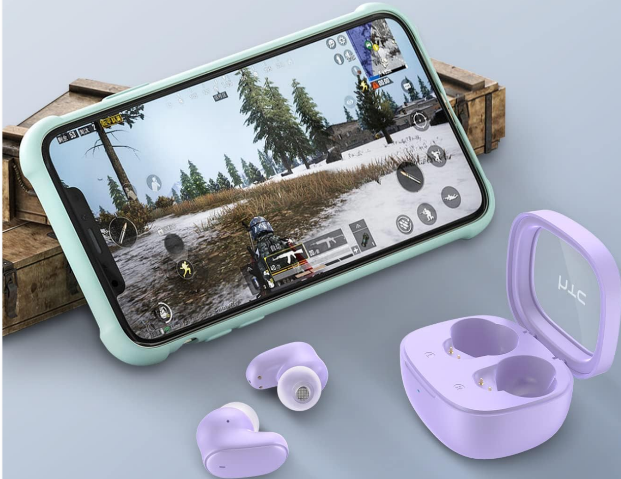
Image: A smartphone displaying a mobile game, with the HTC TWS9 earbuds and their open charging case nearby, illustrating the use of Game Mode for low-latency audio.