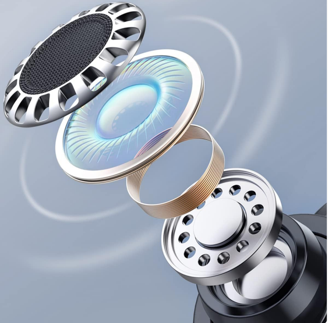
Image: An exploded diagram illustrating the internal components of an HTC TWS9 earbud, including the 10mm speaker and composite diaphragm, designed for sound quality.

The 10mm speaker and thickened composite diaphragm produces powerful bass and stunning treble.