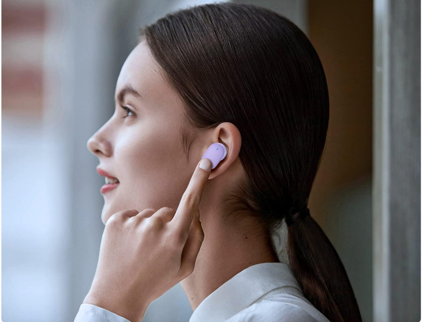
Image: A person wearing an HTC TWS9 earbud, demonstrating its ergonomic design and how it fits in the ear.