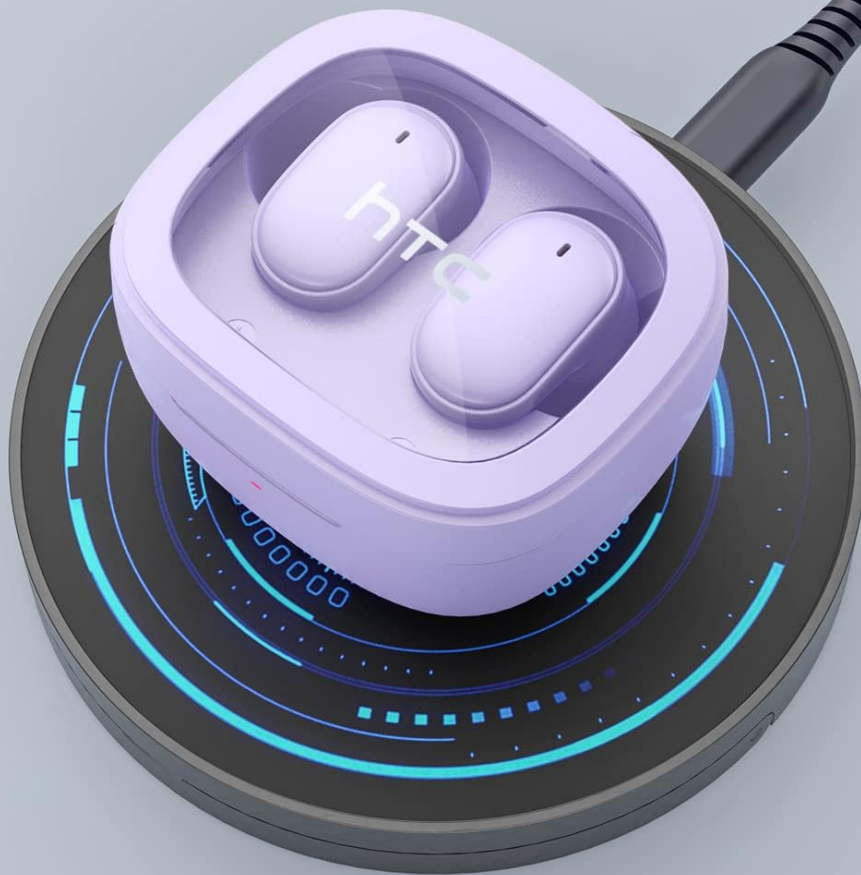
Image: The HTC TWS9 charging case placed on a wireless charging pad, indicating its wireless charging capability.

HTC TWS9 earbuds could be charged with wireless charger, so you can get rid of the cable and immerse yourself in the music world.