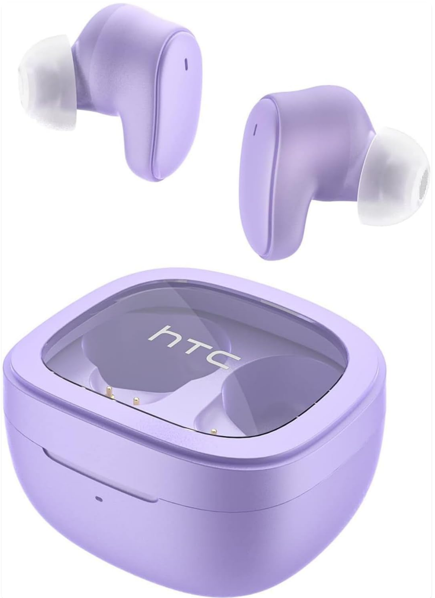
Image: HTC TWS9 True Wireless Bluetooth Earbuds 9 in purple, shown with their transparent charging case. The earbuds are visible inside the open case, and also separately above it.