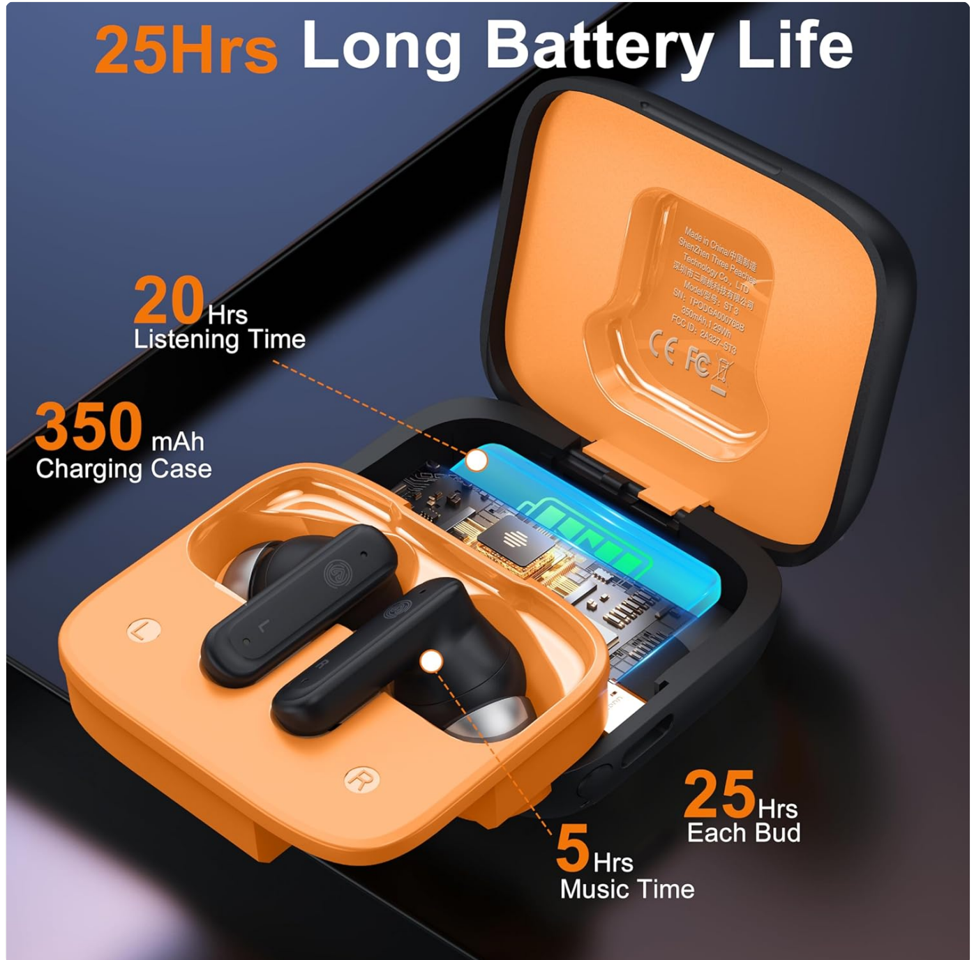
Figure 2: Illustration of the charging case displaying battery levels and indicating up to 5 hours of music time per earbud and 20 hours from the charging case, totaling 25 hours.