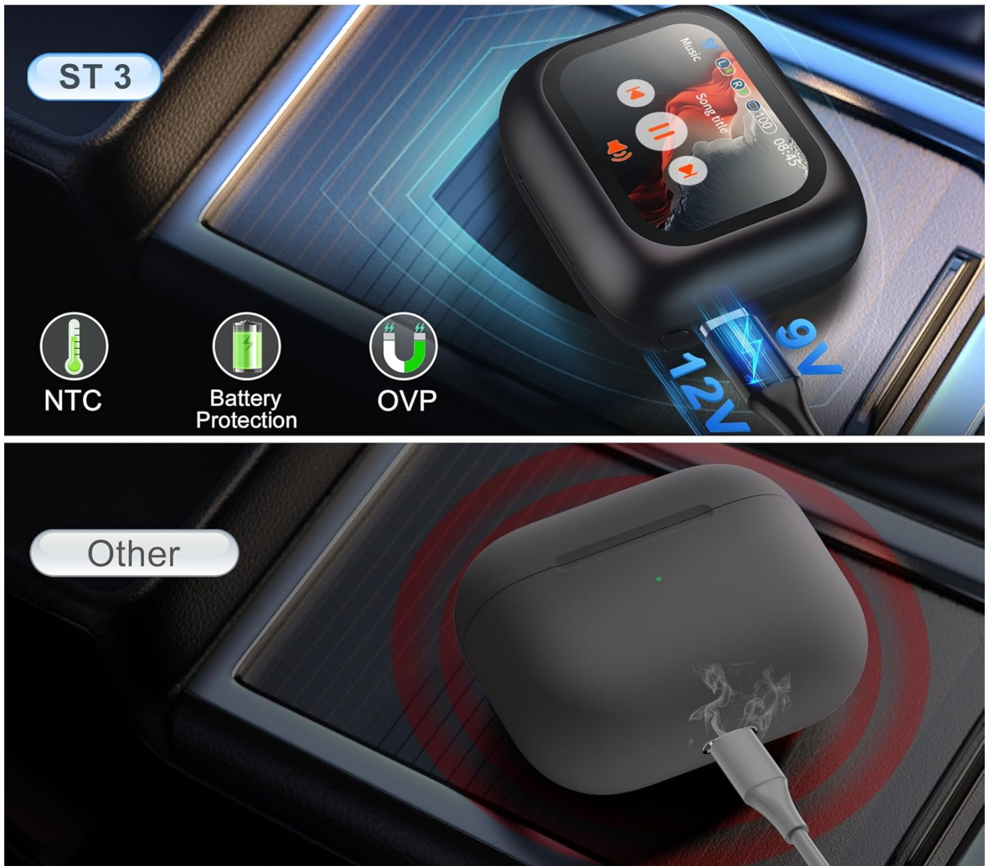
Figure 7: Illustrates the overvoltage protection (OVP) feature of the ST 3 charging case, highlighting NTC, Battery Protection, and OVP for safe charging compared to other devices without such protection.