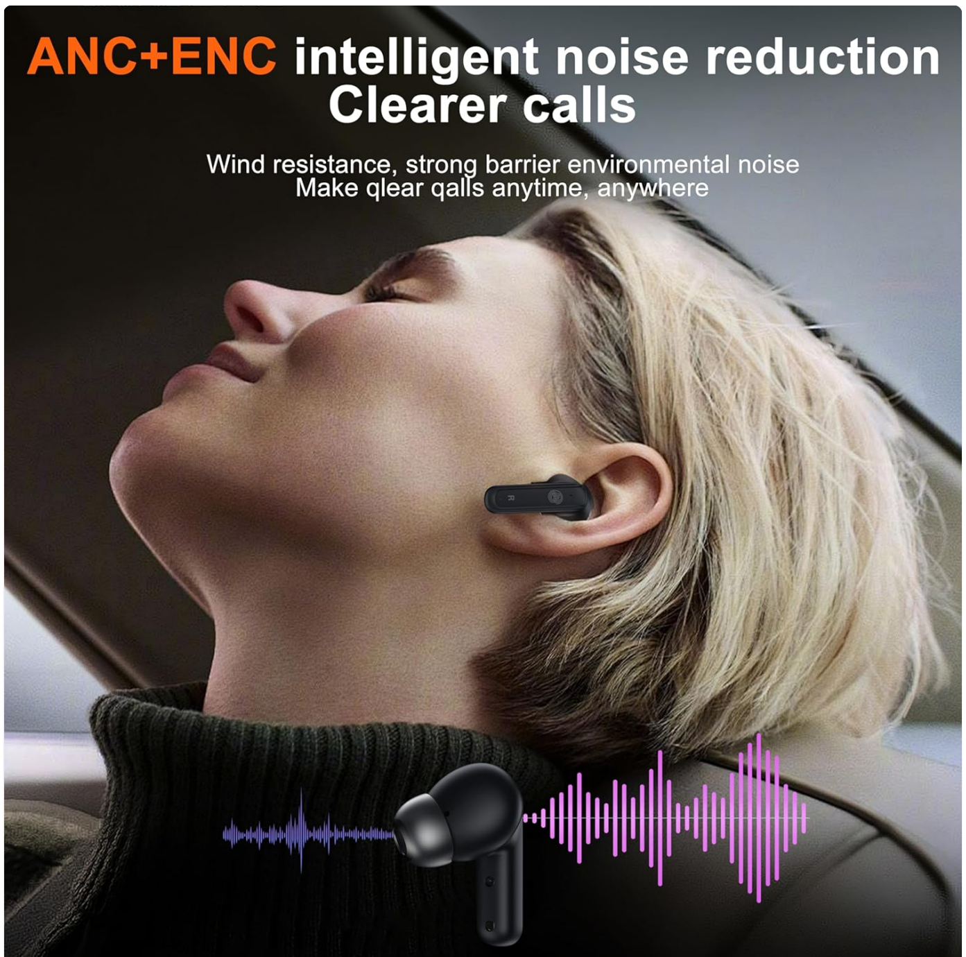
Figure 5: Illustrates the ANC+ENC intelligent noise reduction feature, showing an earbud in use with sound waves indicating noise cancellation for clearer calls and listening.

The earbuds feature both Active Noise Cancellation (ANC) and Environmental Noise Cancellation (ENC) for calls. ANC reduces ambient noise during listening, while ENC focuses on clear voice transmission during calls.