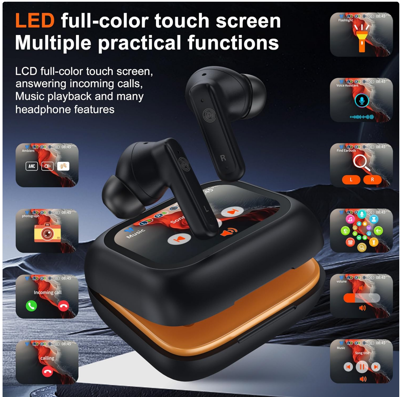
Figure 4: Displays the various functions accessible via the touch screen on the charging case, including music playback, equalizer settings, call management, flashlight, voice assistant, and the "Find Earbuds" feature.

The 2.01-inch LCD touch screen on the charging case provides access to a wide range of features: