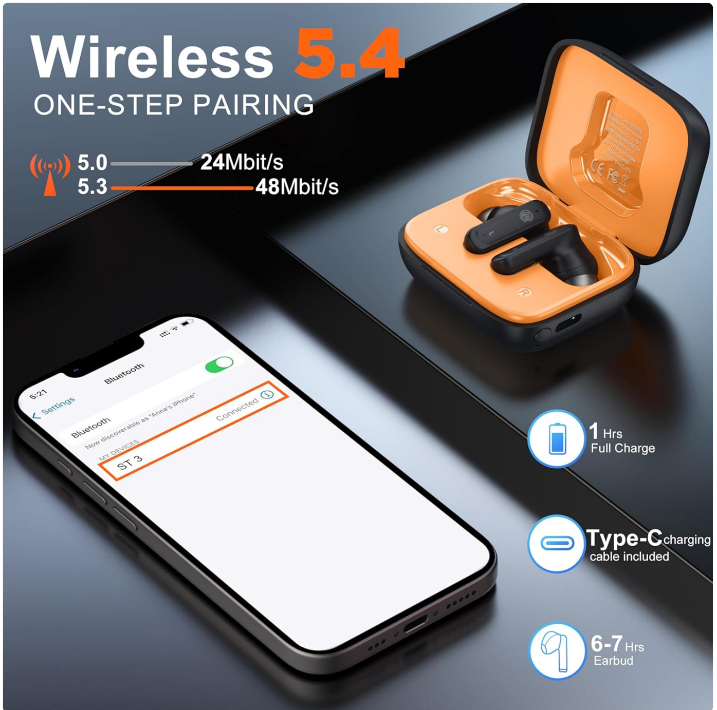
Figure 3: Demonstrates the Bluetooth pairing process, showing a smartphone's Bluetooth settings with "ST 3" listed as a discoverable device, along with charging information.

Note: The earbuds will automatically reconnect to the last paired device when removed from the case, if Bluetooth is enabled on the device.