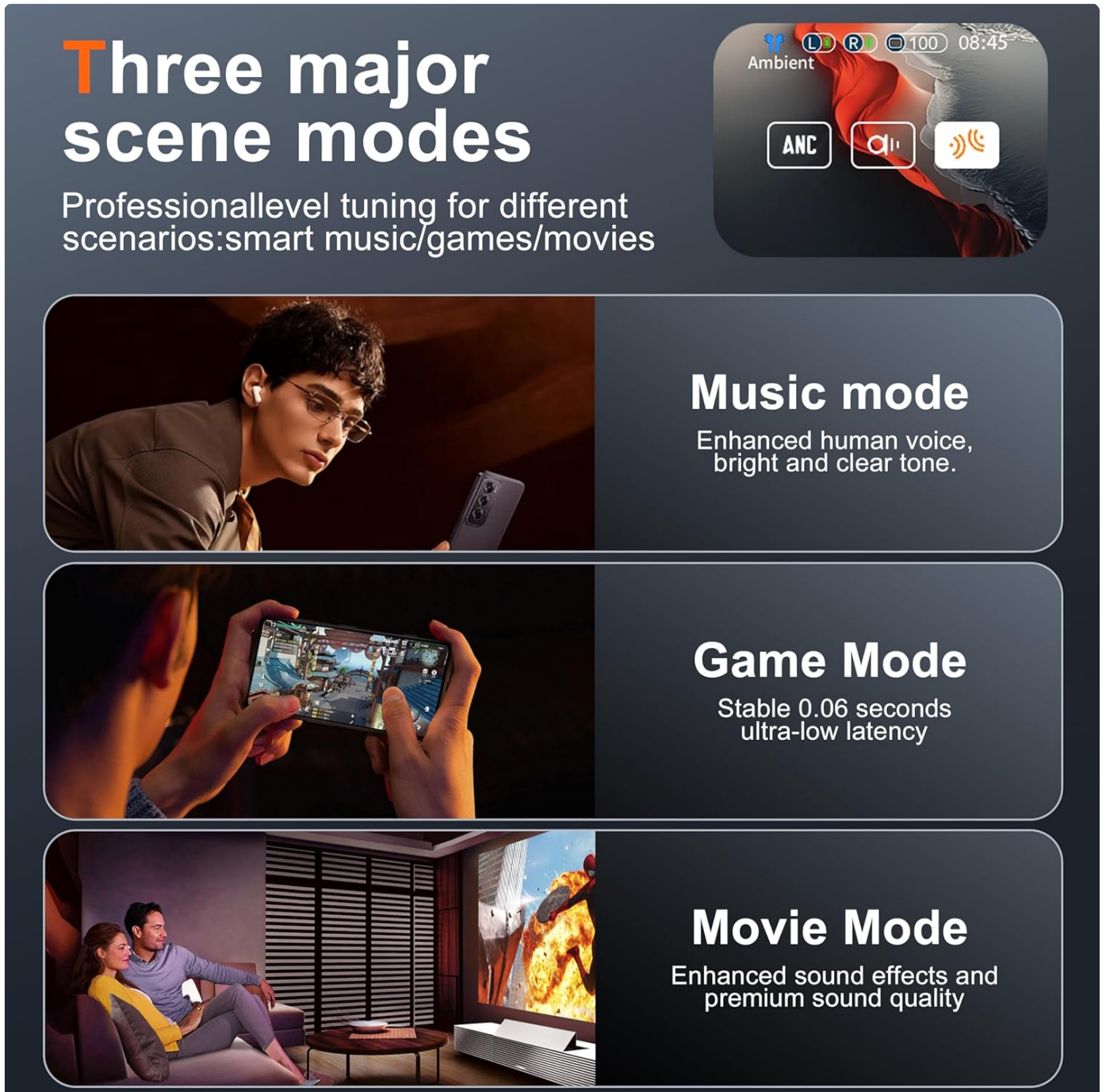
Figure 6: Depicts the three major scene modes: Music, Game, and Movie, illustrating how each mode optimizes audio for specific content types.