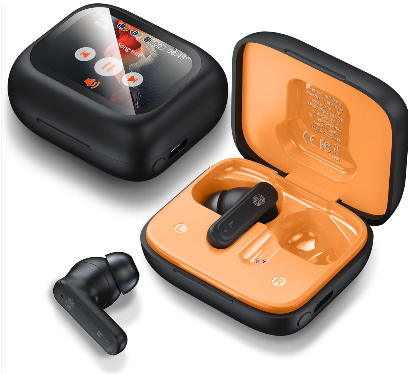
Figure 1: Overview of the THREE PEACHES ST 3 Wireless Earbuds and their charging case. The case features a touch screen display, and the earbuds are shown both inside and outside the case.