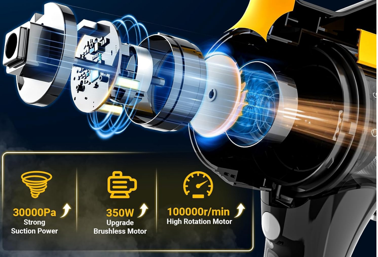
Image: An exploded view diagram highlighting the 350W brushless motor, 30000Pa strong suction power, and 100000r/min high rotation motor.