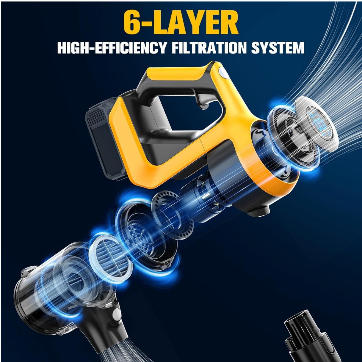
Image: An exploded view diagram illustrating the 6-layer high-efficiency filtration system, designed to capture fine dust and allergens.