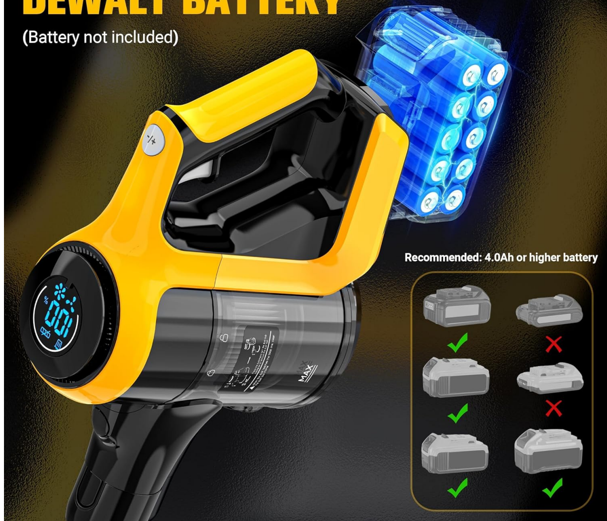
Image: The main yellow and black vacuum unit with a yellow DeWALT 20V battery attached, illustrating battery compatibility.