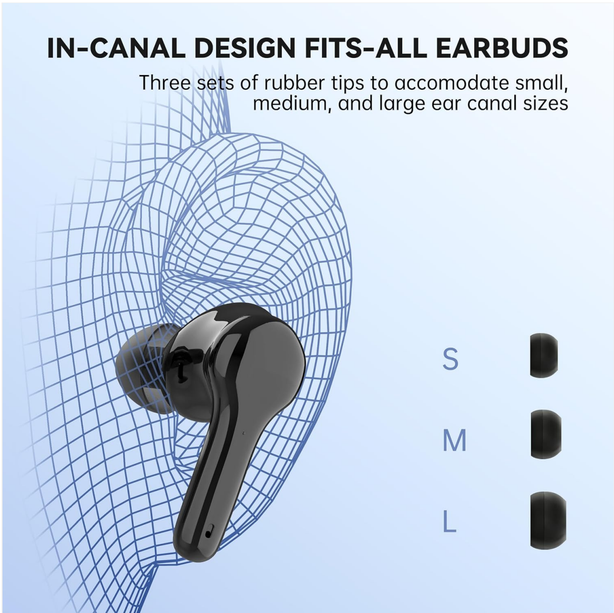
Image: A diagram showing the in-canal design of the earbud and three different sizes of ear tips (S, M, L) to accommodate various ear canal sizes for optimal fit and comfort.

Three sets of rubber tips to accommodate small, medium, and large ear canal sizes