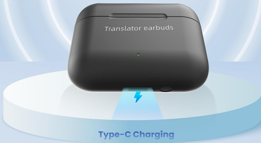
Image: The Wooask M6 charging case with indicators for continuous translation time (5 hours), total battery life with case (19 hours), and full charge time (90 minutes via Type-C).