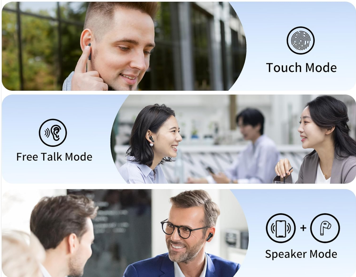
Image: Visual representation of the three operating modes: Touch Mode (person touching earbud), Free Talk Mode (two people conversing naturally), and Speaker Mode (one person with earbud, another using a phone).