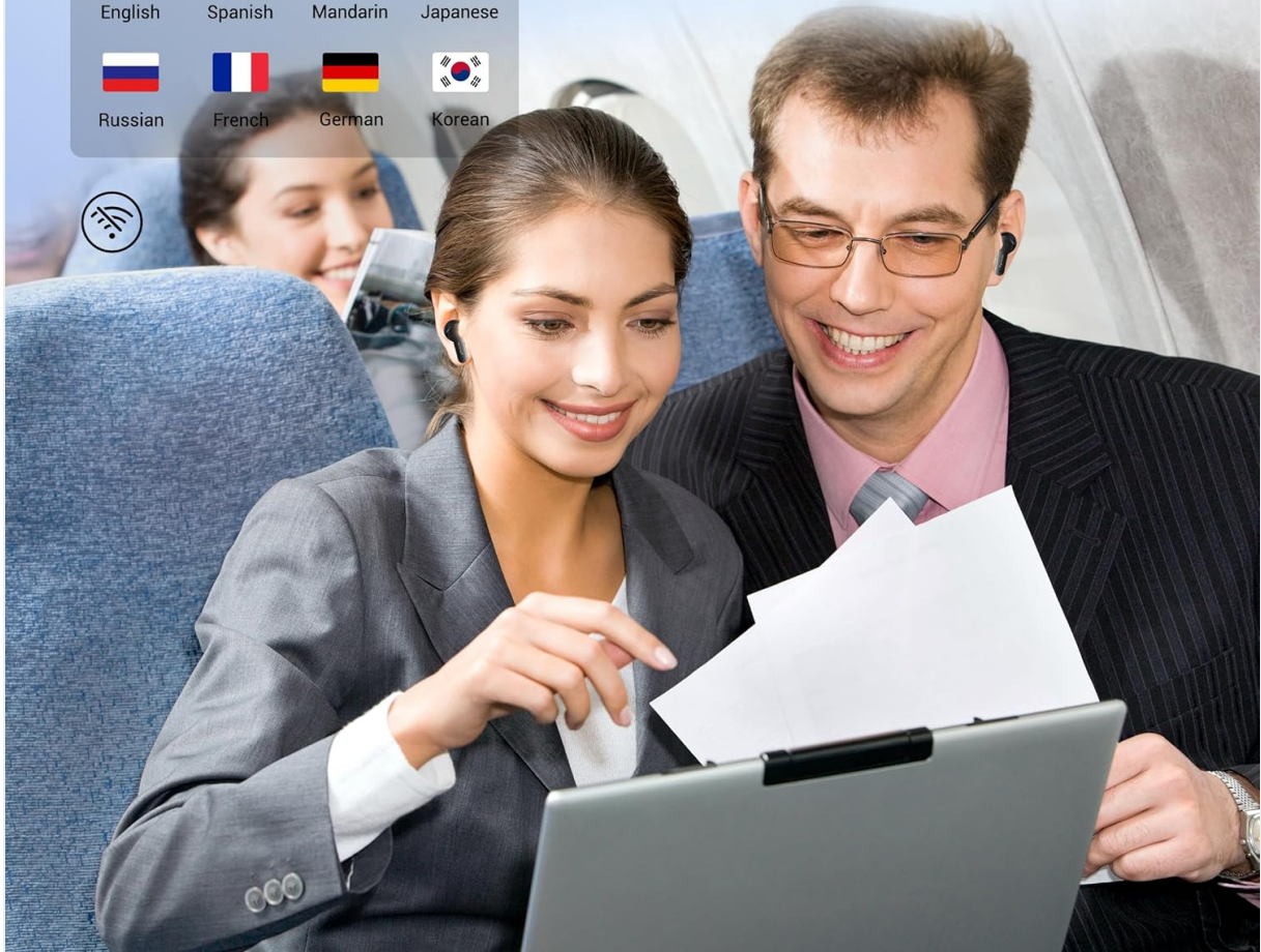
Image: A visual display of the flags and names of the 8 languages available for offline translation: English, Spanish, Mandarin, Japanese, Russian, French, German, and Korean.