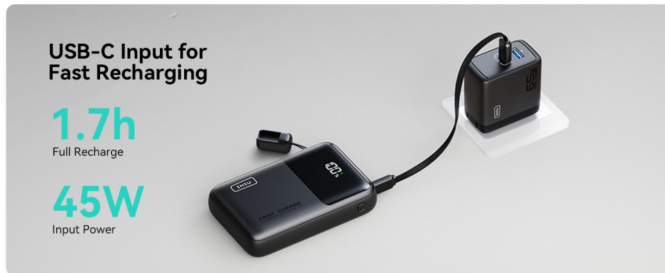
Recharging the INIU Power Bank using a USB-C wall adapter for fast input.