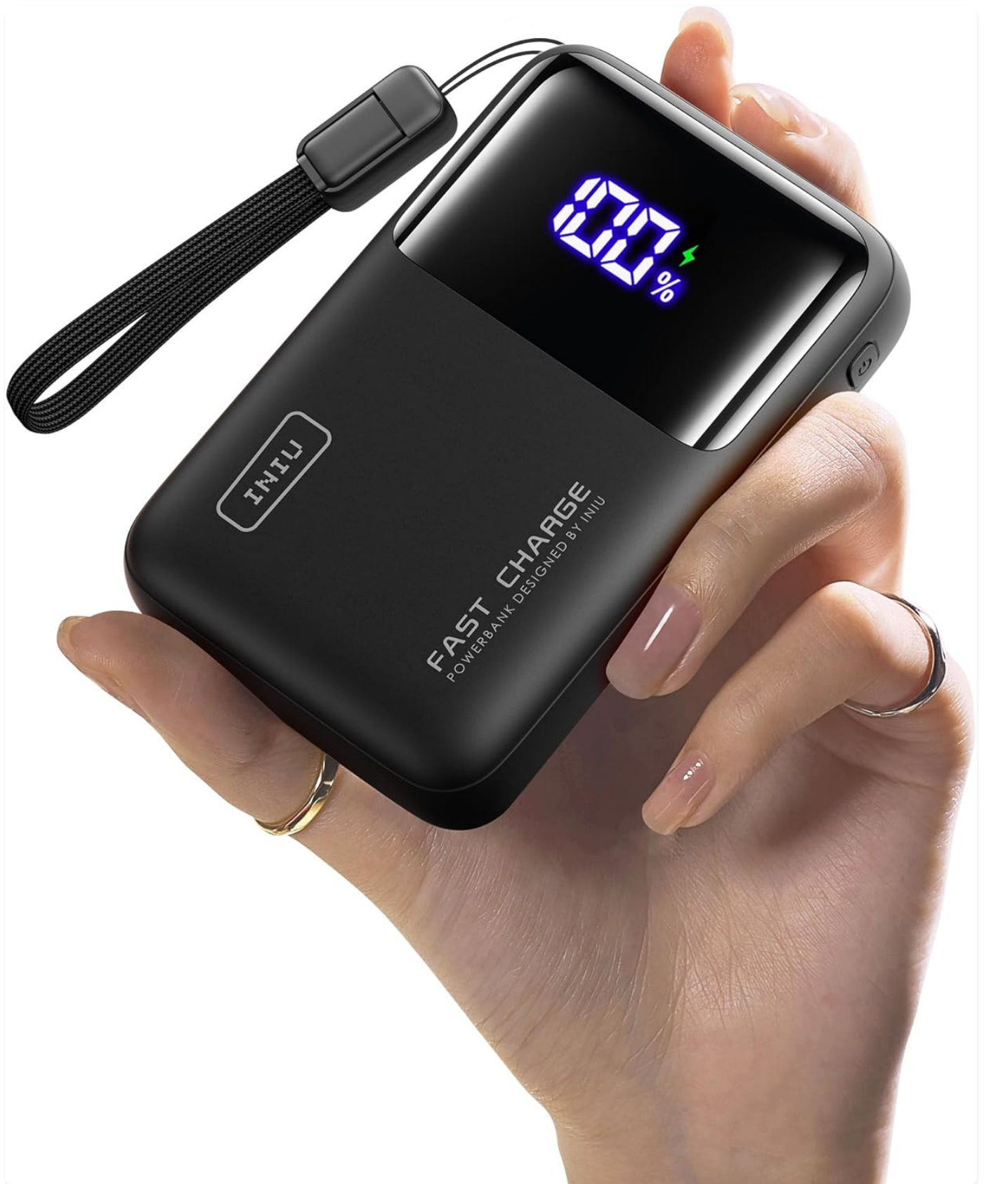
The INIU 20000mAh 65W Power Bank, showcasing its compact design and digital display.