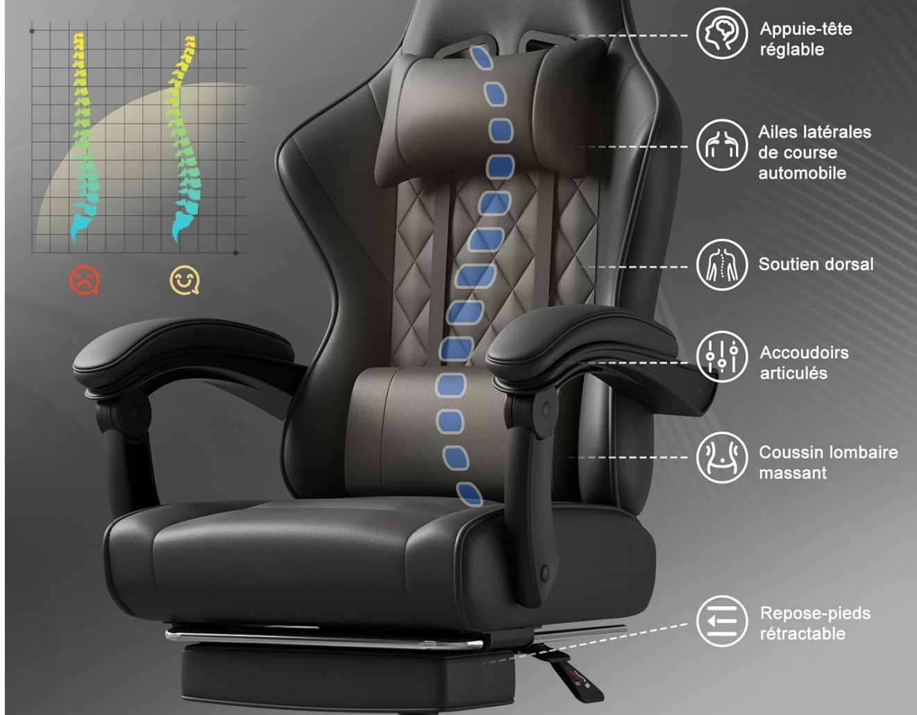
Image: An overview of the chair's ergonomic design, highlighting key support points for the head, back, and lumbar region, along with adjustable armrests and footrest.