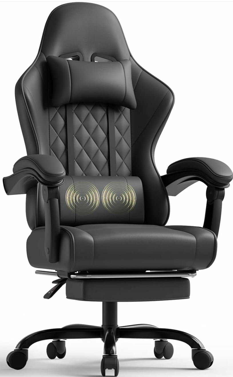
Image: The TRIUMPHKEY Massage Gaming Chair, Model 0758, showcasing its design and features in a typical use environment.