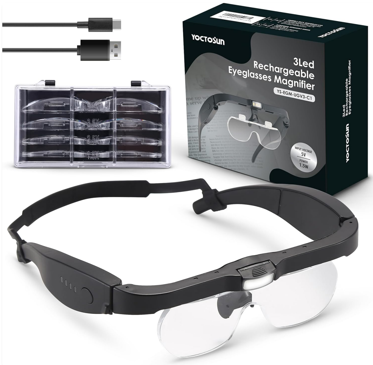
Figure 1: YOCTOSUN Magnifying Glasses with Light, showing the main unit and lens case.

The magnifying glasses are ideal for activities such as cross-stitch, reading, painting, observing, modeling, repairing, sewing, soldering, and jewelry making, allowing you to see objects magnified up to 500% of their original size with high clarity.