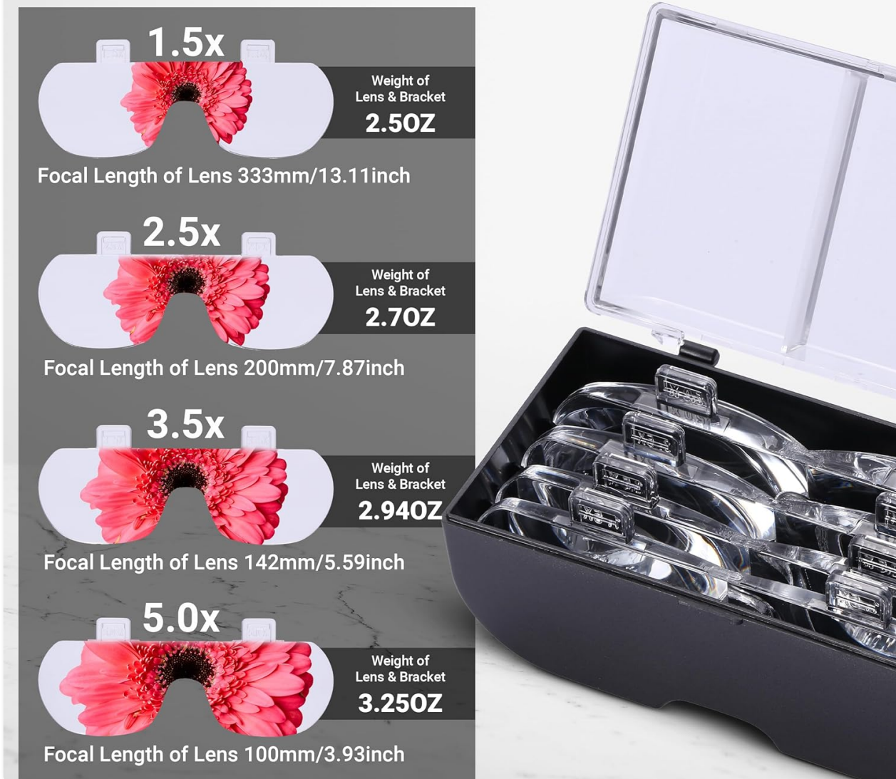
Figure 3: The four interchangeable acrylic lenses, detailing their magnification strengths and focal lengths.