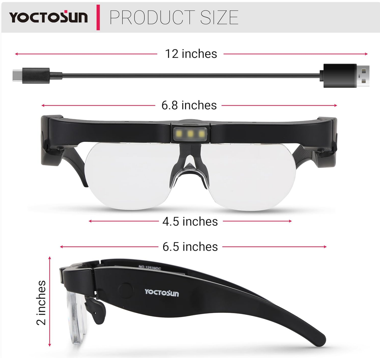
Figure 7: Detailed product dimensions for the magnifying glasses and charging cable.